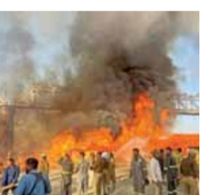
Smoke billows out after a fire broke out in a camp during Mahakumbh, at Sangam in Prayagraj

Celsius. People will wake up to a less chill morning on Monday as the met department has predicted moderate fog on Monday, with the maximum and the minimum temperatures likely to settle around 24 and 11 degrees Celsius, respectively. The humidity level oscillated between 71 per cent and 100 per cent. Earlier on Friday, the CAQM had revoked the actions under Stage III ('Severe' Air Quality) of the GRAP following an improvement in the national Capital's AQI after it reached 302 a day before.