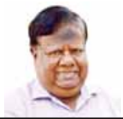
C K NAYAK

A historic event captivated the world as a herd of 15 wild elephants embarked on a 500-km journey from Xishuangbanna to the bustling city of Kunming