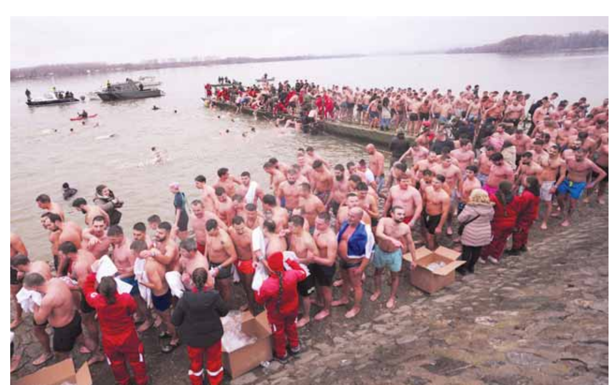
Christian Orthodox believers walk after a swim in the icy water of the Danube river in Belgrade, Serbia, on Sunday