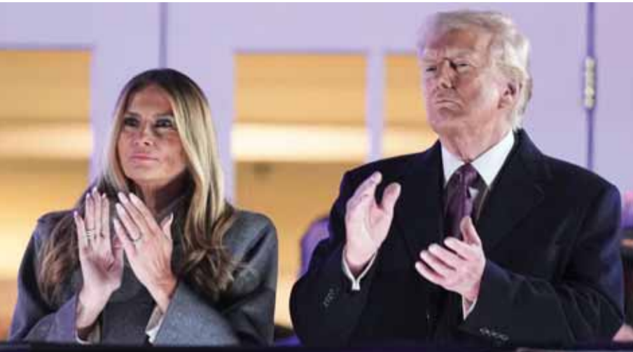
President-elect Donald Trump, right, and Melania Trump clap during a fireworks show at Trump National Golf Club in Sterling, Va., ahead of the 60th Presidential Inauguration

PTI ■ WASHINGTON President-elect Donald Trump is spending the eve of his inauguration in a series of Washington events that celebrate his return to power and his "Make America Great Again" movement as he prepares to move back into the White House at a time of deep national political divisions. Washington has prepared in unprecedented ways to keep the unfolding events safe and secure. But unlike when Trump helped spark a mob of his supporters to attack the Capitol and tried to retain power in 2021 after his loss to Democrat Joe Biden, officials are not expecting massive protests, unrest and violence this time. Instead, the city is braced for crowds celebrating Trump's second term and MAGA's total control of the Republican Party. It is a remarkable turnaround after Trump left the nation's