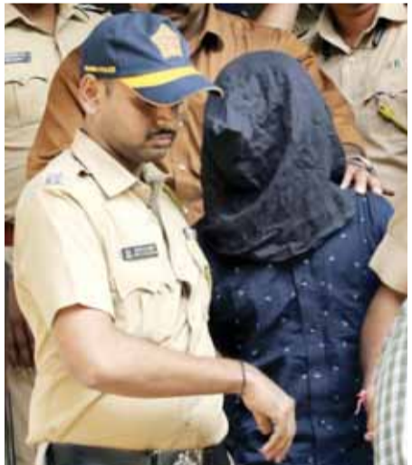
Police personnel take the accused, arrested in connection with the alleged attack on Bollywood actor Saif Ali Khan, to a hospital for medical examination before producing him at a court, in Mumbai