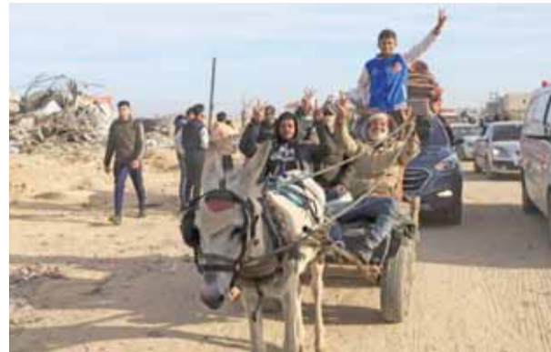
Displaced Palestinians flash V-sign as they return to Rafah, while a ceasefire deal between Israel and Hamas went into effect, in Rafah, Gaza Strip