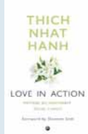
Book: Love in Action: Writings on Nonviolent Social Change Author: Thich Nhat Hanh Publisher: Alpha book company Price: ₹399