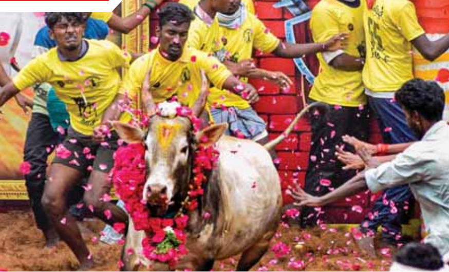
People try to tame a bull as they participate in the 'Jallikattu' event as part of 'Pongal' celebrations, in Tiruchirappalli