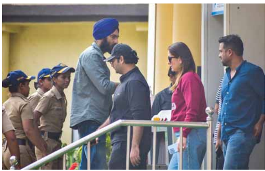
Bollywood actor Kareena Kapoor at the Lilavati Hospital where actor Saif Ali Khan was admitted after he was injured in an attack by an intruder with a knife, in Mumbai