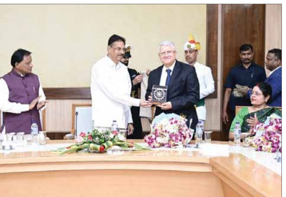
Governor Dr Hari Babu Kumbhampati and Chief Minister Mohan Charan Majhi attend a farewell meeting for Chief Justice of Orissa High Court Justice Chakradhari Sharan Singh at the Lok Seva Bhawan in Bhubaneswar on Thursday.

Thursday. The National Eligibility-cum-Entrance Test (NEET) is the largest entrance exam in the country in terms of number of candidates appearing for the test. In 2024, a record more than 24 lakh candidates took the exam. The NTA conducts the NEET every year for admission into medical colleges. A total of 1,08,000 seats are available for MBBS course. Of the seats available for the MBBS course, approximately 56,000 are in government hospitals and about 52,000 in private colleges. Admissions to undergraduate courses in Dentistry, Ayurveda, Unani, and Siddha also utilise the results of the NEET for admission.