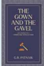
Book: The Gown and the Gavel: Life Journey of a Former Chief Justice of India Author: G.B. PATNAIK Publisher: Niyogi books Price: ₹695