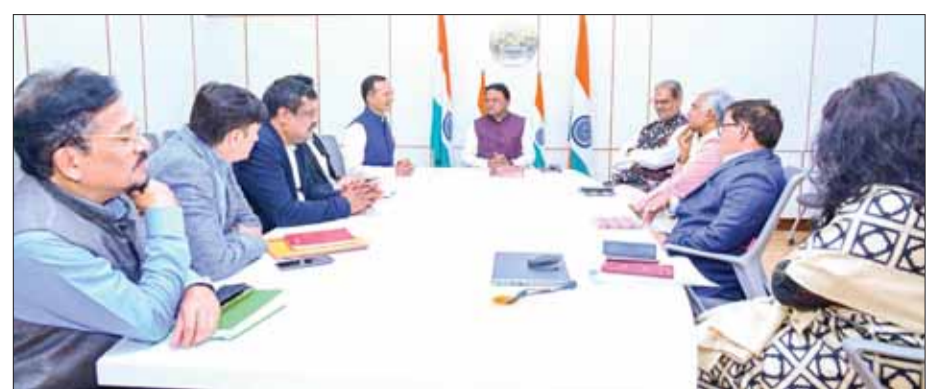
Jindal Steel and Power Chairman Naveen Jindal pays a courtesy call on Chief Minister Mohan Charan Majhi at the Lok Seva Bhawan in Bhubaneswar on Thursday.