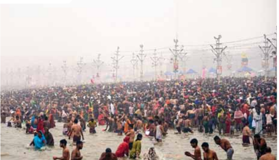
Devotees take a holy dip at Sangam on the first day of Maha Kumbh Mela 2025, in Prayagraj