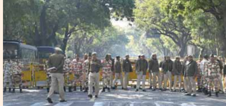
Police and security personnel stand guard outside Prime Minister's official residence at Lok Kalyan Marg, in New Delhi.