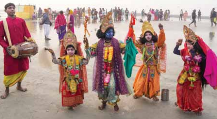
A man and children perform for alms at Sagar Island on a foggy winter morning, in South 24 Parganas