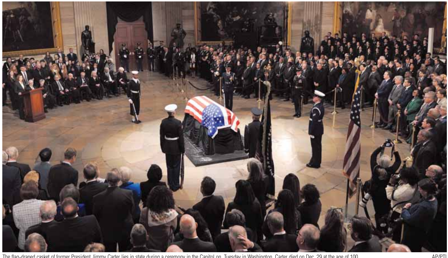
The flag-draped casket of former President Jimmy Carter lies in state during a ceremony in the Capitol on Tuesday in Washington. Carter died on Dec. 29 at the age of 100.

some really great progress and I'm really hopeful that by the inauguration we'll have some good things to announce on behalf of the president." Negotiations between Hamas and Israel are ongoing in Qatar, with Hamas this week naming 34 hostages in Gaza — including two dual US citizens — it would be willing to release in a ceasefire deal, the National Public Radio reported. Trump, in response to a question, warned Hamas to release all the hostages by January 20. "It will not be good for Hamas and it will not be good frankly for anyone. All hell will break out. I don't have to say anymore, but that's what it is. They should have given them back a long time ago — they should have never taken them. There should have never been the attack of October 7th. People forget that, but there was and many people were killed," he said.