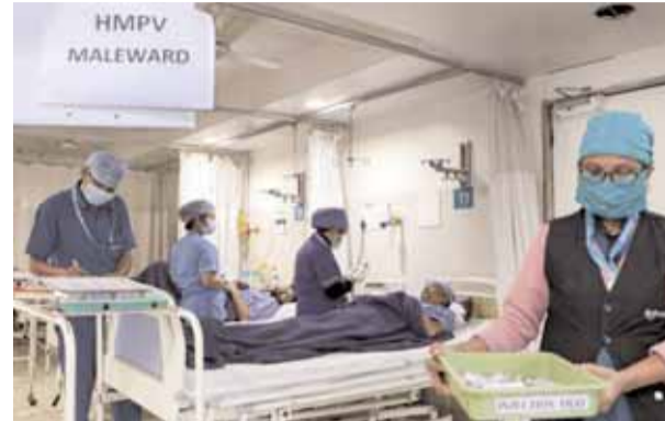
Nagpur: Preparations underway at Meditirina Hospital for patients of Human Metapneumovirus (HMPV), a day after two suspected cases of the virus were reported from the city, in Nagpur, Maharashtra.

irregularities committed in the construction of Sheesh Mahal (6, Flagstaff Road, occupied by Arvind Kejriwal as chief minister). Why did they not think of showing the Sheesh Mahal earlier and now insist on a visit when the administration is bound by a model code of conduct?" In a veiled attack on AAP leaders, BJP national spokesperson Sudhanshu Trivedi, addressing a press conference, said their conduct was also an example of "political etiquette and ethics" being demolished. This shows the writing on the wall is clear to them that the AAP is losing the Delhi assembly polls, he said. Earlier, outside the Chief Minister's house, the AAP leaders engaged in a heated argument with the police and staged a dharna outside the 6 Flag Staff Road bungalow after being denied entry, which they had invited the media to tour with them in a bid to counter the BJP's "Sheesh Mahal" jibes. Police set up barricades and deployed personnel in front of the bungalow, preventing the AAP leaders from entering the premises.