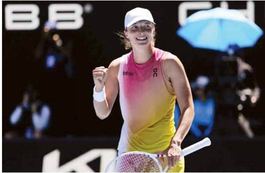
de Minaur on Wednesday night. The other men's semifinal Friday is Novak Djokovic vs. Alexander Zverev. Against Navarro, Swiatek benefited from a no-call of a double bounce on a point she won in the second set. Because Navarro continued playing the point and did not immediately stop to ask for a video review, she wasn't allowed to have the sequence checked.

night for a berth in the final. The other women's semifinal is No. 1 Aryna Sabalenka, the two-time defending champion, against her good friend, No. 11 Paula Badosa. Keys, whose best showing at a major was getting to the title match at the 2017 U.S. Open, was a 3-6, 6-3, 6-4 winner against Elina Svitolina and is into her third semifinal in Australia. "Iga is tough to beat, because she has a lot of spin, kind of naturally, on both sides. She's a good server. She's a good returner. She moves incredibly well," Keys said. "The biggest thing that makes her so difficult to beat is, because she moves so well, if you miss your spot just slightly, she has enough time to recover, and then the point goes back to neutral." There's an American in the men's semifinals, too: No. 21 Ben Shelton got that far in Melbourne for the first time with an entertaining 6-4, 7-5, 4-6, 7-6 (4) win over unseeded Lorenzo Sonego of Italy. Shelton was a semifinalist at the 2023 U.S. Open and now will meet No. 1 Jannik Sinner, the defending champion, or No. 8 Alex de Minaur in that round. Sinner faced