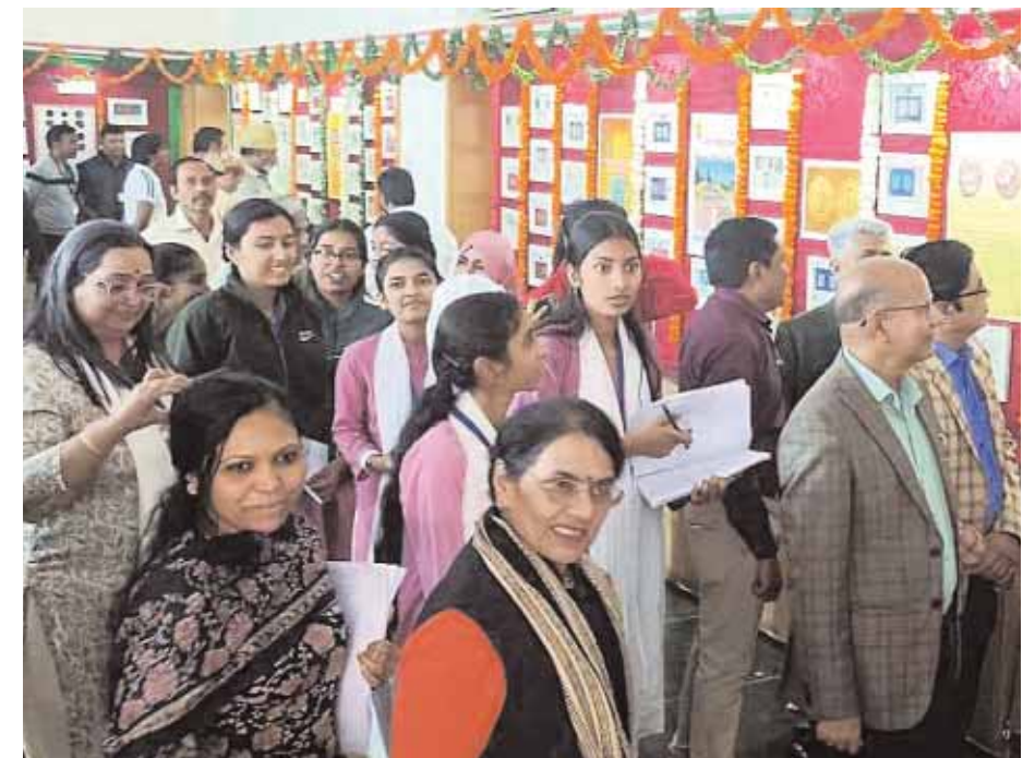
Visitors go through an exhibition on 'Ancient Coins' at the State Museum in Bhopal on Wednesday.