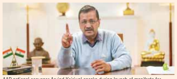
AAP national convener Arvind Kejriwal speaks during launch of manifesto for middle class ahead of the upcoming Delhi Assembly elections.