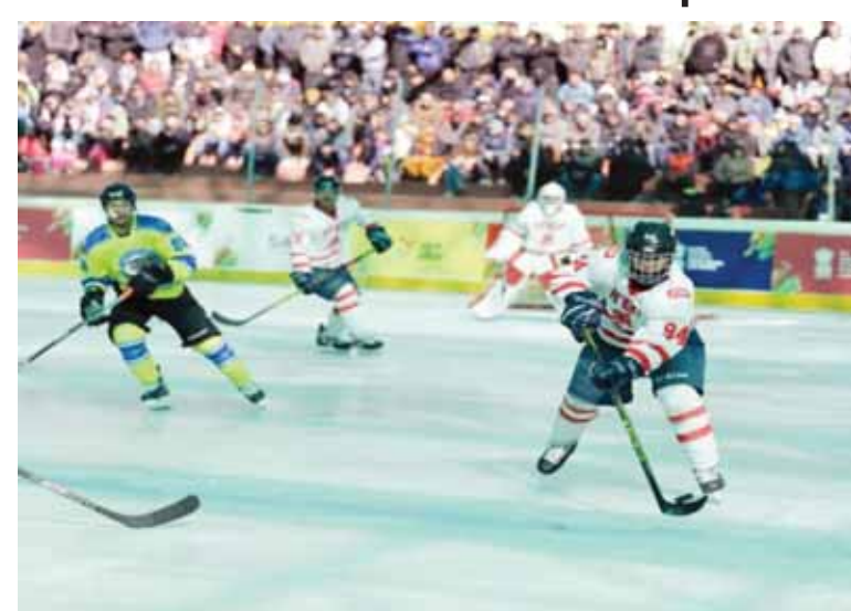
This will be the second time Ladakh hosts the Winter Games, now in its fifth edition, the spokesperson said. "All teams have arrived in Leh, which is at an altitude of 11,562 feet. Himachal Pradesh has the largest contingent, comprising 78 athletes and support staff," he added. Haryana (62), hosts Ladakh (52), and Maharashtra (48) will compete in the Ladakh edition. Uttarakhand, which will host the National Games later this

■ LEH/JAMMU The Khelo India Winter Games (KIWG) 2025 that starts on Thursday will feature 428 athletes from 19 competing teams. Sports Minister Mansukh Mandaviya is set to declare the Games open in Leh on Thursday. Nineteen teams, comprising states, Union Territories, and institutional outfits, will compete over five days across two events - ice hockey and ice skating - marking the first part of KIWG 2025. A traditional Ladakhi-style opening ceremony has been planned to welcome 594 participants, including 428 athletes. The second part, featuring snow games like skiing, will be hosted by Jammu and Kashmir from February 22 to 25. "Sports Minister will attend the opening ceremony at the iconic Nawang Dorjay Stobdan Sports Complex in Leh on Thursday and will declare the games open," an official spokesperson said. Mandaviya will be joined by a host of dignitaries, including the Lieutenant Governor of Ladakh, Brigadier Dr BD Mishra, and senior officials from the Sports Authority of India and the Ladakh Autonomous Hill Development Council.