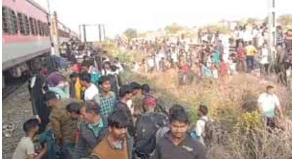
People gather at the site following the death of several passengers after they stepped down due to a rumour of fire and were run over by another train passing on the adjacent tracks, in North Maharashtra's Jalgaon district.