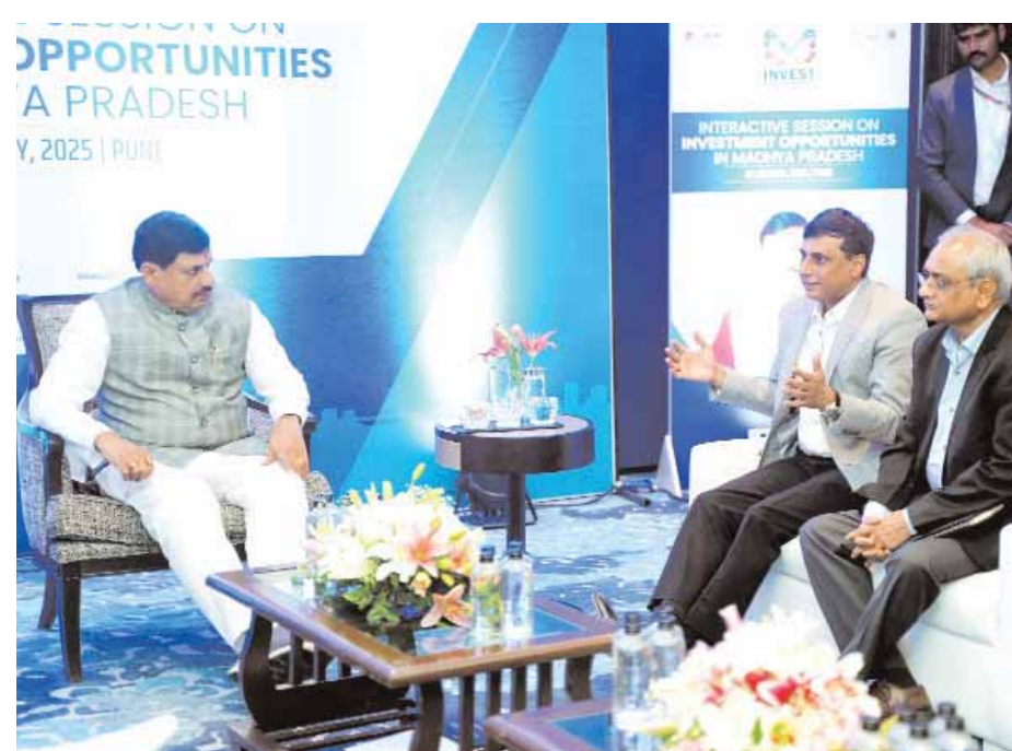
Madhya Pradesh Chief Minister Mohan Yadav during one-to-one discussion with the investors during an interactive session on investment opportunities in Madhya Pradesh, organised in Pune, Maharashtra on Wednesday.

in advancing the country's economy. Just as a soldier protects the nation at the border, an industrialist contributes to making the country capable, prosperous, and magnificent through skilled management. Industrial groups are an effective means of generating employment. Madhya Pradesh and Maharashtra Share a Historical Bond Chief Minister Yadav remarked that Madhya Pradesh shares a deep emotional connection with Maharashtra. The climate of Pune is similar to that of Madhya Pradesh. All the holy sites of Malwa are linked with Maharashtra. Referring to Chhatrapati Shivaji, the Scindias, the Holkars, and the Peshwas, Dr. Yadav highlighted the exemplary governance, valor, skill development, and religious contributions of Lokmata Ahilya Devi.