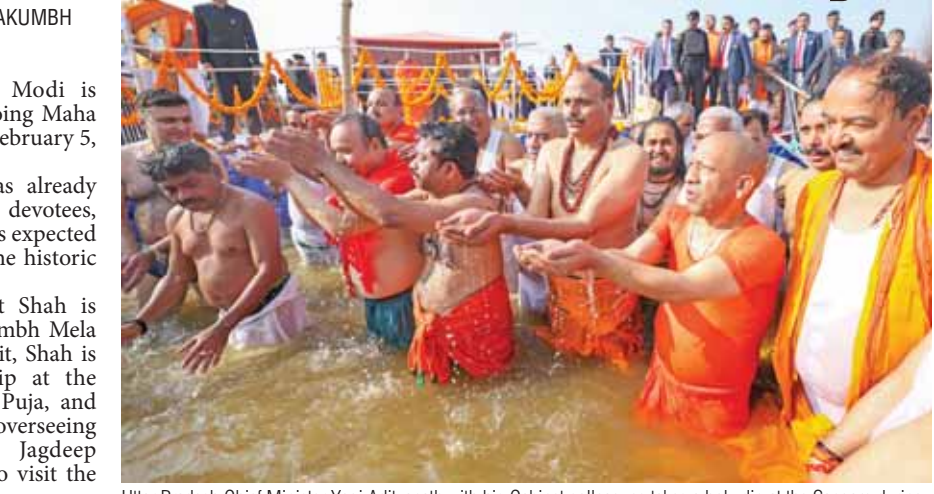
Uttar Pradesh Chief Minister Yogi Adityanath with his Cabinet colleagues takes a holy dip at the Sangam during the Maha Kumbh Mela 2025, in Prayagraj.

Prime Minister Narendra Modi is scheduled to visit the ongoing Maha Kumbh Mela in Prayagraj on February 5, according to sources. The grand spiritual event has already seen an influx of millions of devotees, and the Prime Minister's visit is expected to draw further attention to the historic gathering. Union Home Minister Amit Shah is slated to attend the Maha Kumbh Mela on January 27. During his visit, Shah is expected to take a holy dip at the Sangam, perform the Ganga Puja, and hold discussions with officials overseeing the event. Vice President Jagdeep Dhankhar is also scheduled to visit the Mela on February 1. Uttar Pradesh Chief Minister Yogi Adityanath previously confirmed the participation of top dignitaries, including President Droupadi Murmu, Vice President Jagdeep Dhankhar, Prime Minister Narendra Modi, and Union Home Minister Amit Shah. "Their presence underscores the cultural and spiritual significance of the Maha