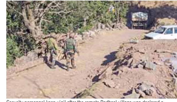
Security personnel keep vigil after the remote Badhaal village was declared a containment zone and prohibitory orders imposed on all public and private gatherings in Jammu and Kashmir's Rajouri district.

Raising a 'red flag,' the District Magistrate Rajouri has declared Badhaal village, which has so far witnessed 17 deaths due to 'mysterious illness' since December 7, 2024, a 'containment zone' under section 163 of Bharatiya Nagarik Suraksha Sanhita (BNSS) with immediate effect. Section 163 of the BNSS gives magistrates the power to issue written orders in urgent situations. According to the order issued by the office of the District Magistrate, Rajouri on January 21, 2025, "In view of the recent health situation in the Badhaal area and to curb the spread of infection the following orders are issued under section 163 of BNSS." Meanwhile, four villagers including three sisters have been admitted to the hospital