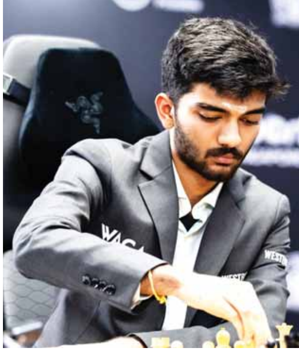
who is perceived as a strong opponent at all levels. With black, Gukesh was looking only optically worse but the Indian equalised without much trouble

was necessary to put up resistance and Pragnanandhaa made the most of it to emerge victorious. Erigaisi pressed hard against local hero Anish Giri, who was almost winning against Gukesh in the opening round. The battle took a steep turn with both players fighting for advantage in the rook and knight endgame but as it turned out, the draw was a result that most experts expected. Fabiano Caruana was the player of the day as he gradually crushed second best Dutchman Jorden van Foreest right from the early middle game. It was an innocuous London system that Caruana started with and then capitalised on an unforced error to win a pawn which proved decisive. Earlier, after a tension filled game against Giri, Gukesh relaxed with his black pieces and was never in any problem against Fedoseev,