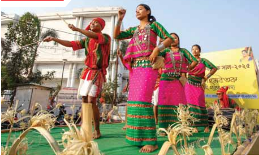
School students perform during Kokborok Day celebrations, in Agartala