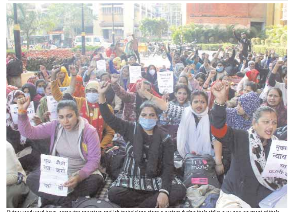
Outsourced ward boys, computer operators and lab technicians stage a protest during their strike over non-payment of their wages and demanded to revoke the termination of employees, at Government Hamidia Hospital in Bhopal on Monday.