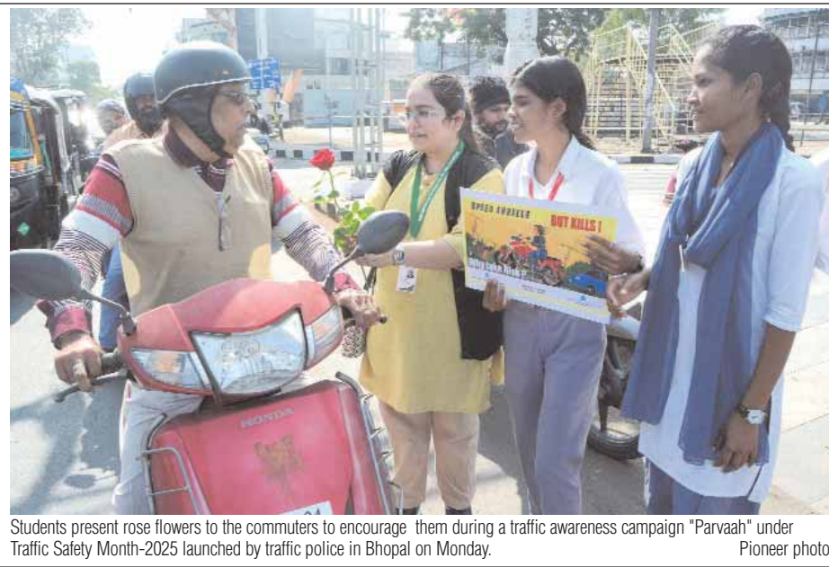
Students present rose flowers to the commuters to encourage them during a traffic awareness campaign 'Parvaah' under Traffic Safety Month-2025 launched by traffic police in Bhopal on Monday.