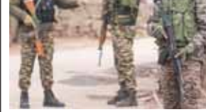
Security personnel stand guard near the site of the encounter, at Gujjarpatli area in Sopore, Baramulla district of Jammu and Kashmir

In an overnight anti-terrorist operation, a soldier of the Indian Army laid down his life in the line of duty in the Gujjarpatli area of Sopore in North Kashmir's Baramulla district on Monday. This is the first incident of terrorist-related violence this year in which a soldier has sacrificed his life in the valley. Braving adverse weather conditions, the security forces have been maintaining a tight vigil along the Line of Control and the International Border amid reports of desperate infiltration bids by heavily armed terrorists from across the border in Pakistan. Meanwhile, the entire security grid has been beefed up in the run-up to the Republic Day celebrations across the Union Territory of Jammu and Kashmir.