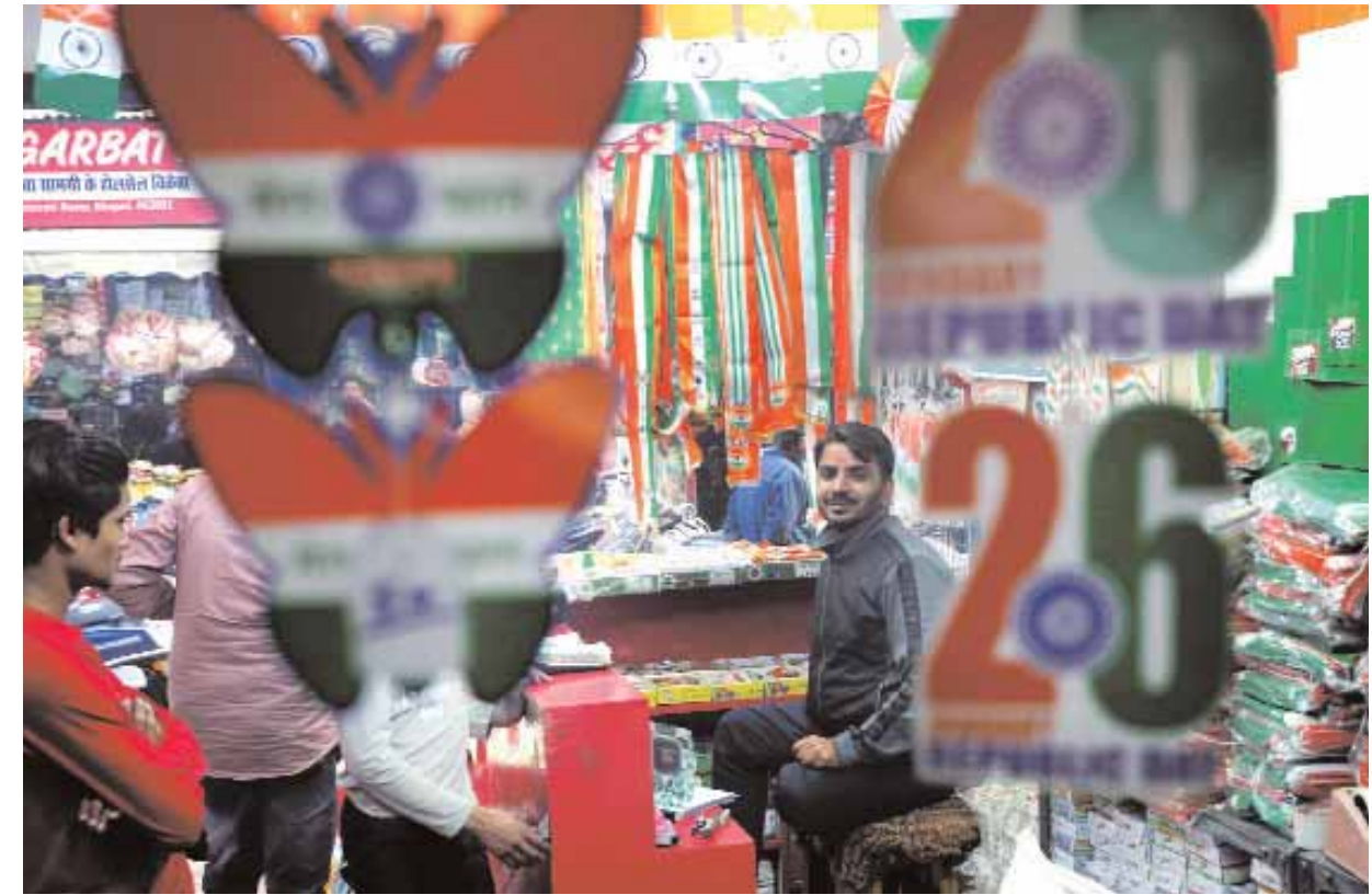
Tricolor decorative items on display for sale in the market ahead of the Republic Day celebration in Bhopal on Monday.

minorities, favoring only their capitalist allies. Patwari also claimed that Prime Minister Narendra Modi and Home Minister Amit Shah mock Ambedkar in Parliament, which is unacceptable to Congress and Ambedkar's followers. Senior leaders, including Umang Singh and Sachin Yadav, criticized the BJP for its alleged anti-Ambedkar mentality and attempts to tamper with the Constitution. They highlighted that the people of India have already rejected the BJP's divisive politics, as seen in the party's reduced seat count. The meeting witnessed participation from MLAs Hiralal Alawa, Rajkumari Upadhyay, and a large number of Congress workers.