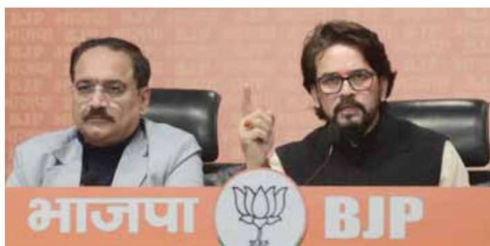
BJP MP Anurag Thakur with Delhi party President Virendra Sachdeva addresses a press conference, in New Delhi

and free 'clean drinking' water. There were speculations that the second part of the manifesto will also include 300 free units of electricity for households. However, party sources said that the BJP, which is vying to end its drought of not being in power in the national capital for more than two decades, will wait for the ruling party to first announce its scheme regarding electricity bill and strategies accordingly if they want to increase the units. The AAP led Delhi government currently has a scheme that provides electricity free up to 200 units for households. In a bid to counter the AAP's free bus ride for women, which proved