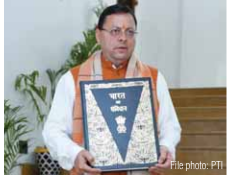
PIONEER NEWS SERVICE ■ DEHRADUN/NEW DELHI

Uttarakhand is all set to implement the Uniform Civil Code (UCC) on the occasion of Republic Day making it the first State in the country. Sources said a cabinet meeting led by Chief Minister Pushkar Singh Dhami on Monday decided to start the process of enforcement of the UCC on January 26 as the cabinet also approved the rules under UCC as how to move ahead in the historic step. In fact last month the State government had announced that UCC would be implemented in January and with municipal elections scheduled for January 23 the results of which would be declared on January 25, sources said the government is prepared to announce UCC implementation on Republic Day. "The mandatory communiqué in this regard will be given the Union Home Ministry sooner," said a senior government source. Set to become the first Indian state to roll out the UCC, its rules manual includes provisions for tatkal registration, door-to-door services in remote areas and a state-wide mock drill on Tuesday. The list of services provided on the portal includes registration of marriage, divorce, and live-in registrations, termination of live-in relationships, intestate succession and declaration of legal heirs, testamentary successions, appeal in cases where application is