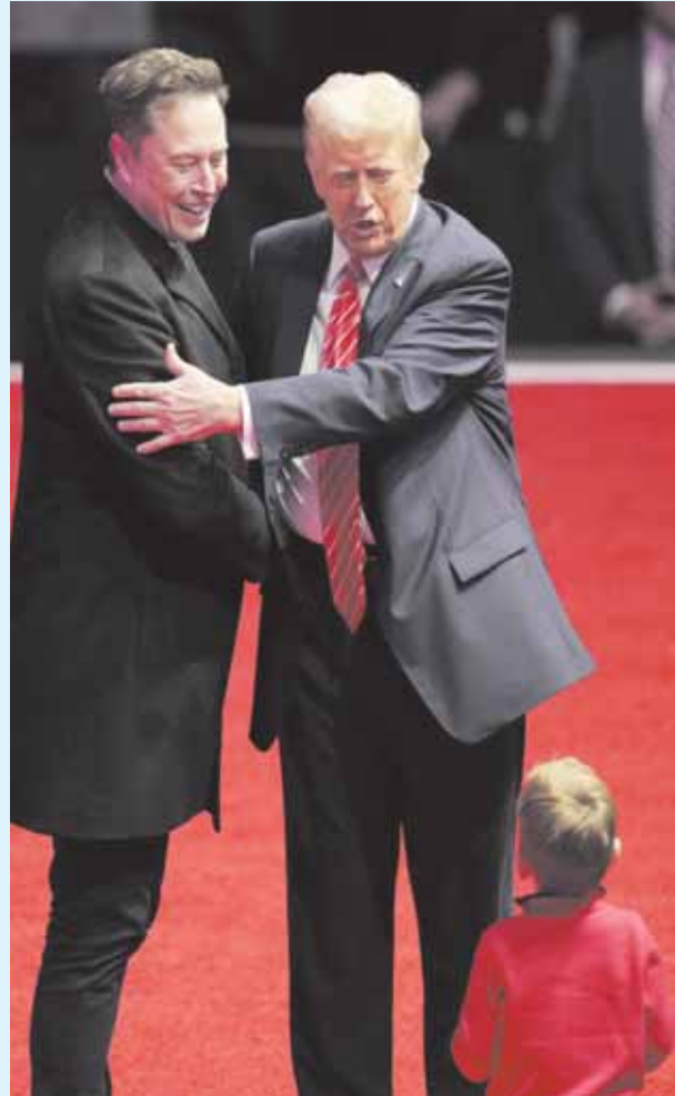
Elon Musk, left, and President-elect Donald Trump embrace as they look at Musk's son X vJ A-Xii, at a rally ahead of the 60th Presidential Inauguration, Sunday, in Washington.

"Since the election, the stock market has surged, while small business optimism has soared a record 41 points to a 39-year high. Bitcoin has shattered one record after another. Major investment company DMACC Properties has announced that it will invest between USD 20 billion and USD 40 billion in the US."