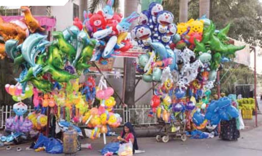
A vendor sells balloons, at the roadside in Surat