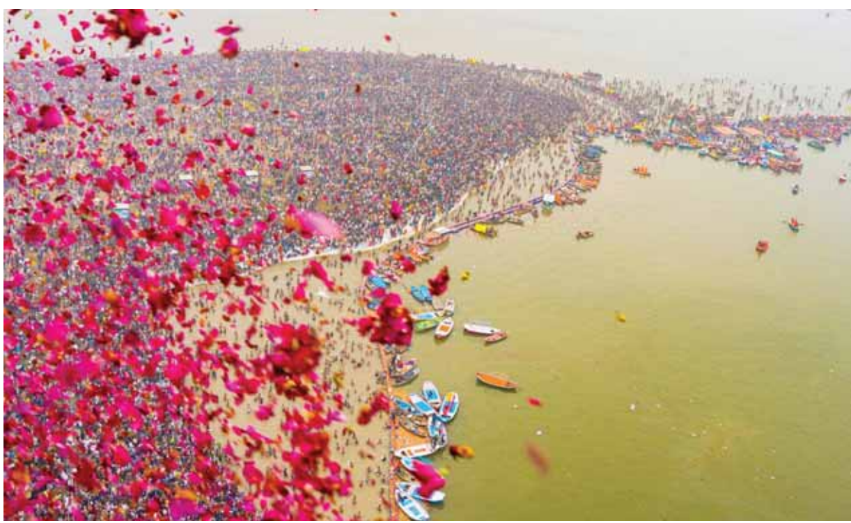
Flower petals being showered on devotees gathered to take a holy dip at Sangam on the occasion of 'Makar Sankranti' during the Maha Kumbh Mela 2025

family. "We wanted to see how this child could have done all this on his own. To investigate this, we did a background profiling of the entire family. It is revealed that one NGO, which is part of a civil society group, has a significant influence at the workplace of the juvenile's guardian. It has a longstanding association and deep connection with a political party. This NGO is known for advocacy for the political party in open public domain and questions the legitimacy of Afzal Guru's hacking, a convicted terrorist involved in the 2001 Parliament attack," the officer said.