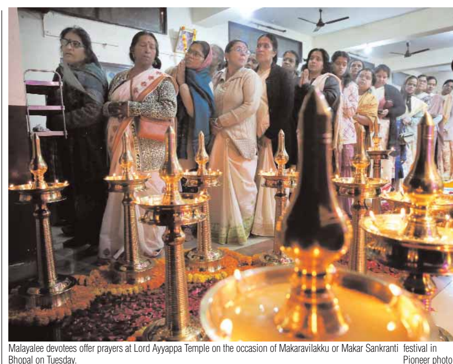
Malayalee devotees offer prayers at Lord Ayyappa Temple on the occasion of Makaravilakku or Makar Sankranti festival in Bhopal on Tuesday.

Bhopal: Chief Minister Mohan Yadav will dedicate development works worth Rs 124.01 crore and perform Bhoomi Pujan of construction works worth Rs 53.62 crore in Vidisha on Wednesday. In the programme, 3 thousand 183 beneficiaries of PM Janman Yojana and 749 of Awas Plus Yojana, a total of 3 thousand 932 beneficiaries will be given Griha Pravesh under Awas Yojana. Certificates will be distributed to 44 thousand 981 Lakhpati Didi who became Lakhpatis by benefiting from various beneficiary-oriented schemes in Vidisha. Union Minister of Agriculture and Farmers Welfare and Rural Development Shri Shivraj Singh Chouhan will also be present in the programme organised at Purani Krishi Upaj Mandi premises, Vidisha.