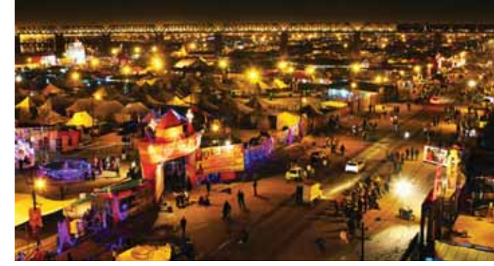
(Top) A young devotee at Sangam on the occasion of ‘Makar Sankranti’ during the Maha Kumbh Mela 2025, in Prayagraj, Uttar Pradesh. (Left) Tent city at the Mahakumbh Nagar

A video of Maha Kumbh showing people earning handsome profits, a Rs 10,000 loan from a kind friend, and the grandeur of the largest human gathering on Earth have lured four siblings from Gorakhpur to Prayagraj. While this could be anybody’s story, what sets the four siblings apart is that they left home without informing their parents, bought a pushcart, and set up a tea and snacks stall near Kali Road in Prayagraj, quietly slipping into the sea of humanity that has descended on this holy city for the Maha Kumbh. Requesting anonymity, the 22-year-old elder sister told PTI, “Our father is a policeman, while our mother is a homemaker. My father bears all the expenses for our education and running the household. It is painful to see him struggle so much.” “One day, we came across a video of the Kumbh showing people earning good profits. My younger sister then suggested that we should also set up a stall at the Kumbh. Our father was against the idea. So we ran away from home when he was out for duty, bought a pushcart, and set up a stall near Kali Road.” The runaway brigade comprises her 20-year-old younger sister, and two brothers aged 15 and 17. “My sister borrowed Rs 10,000 from a friend, and I pawned my earrings for Rs 5,000. With this amount, we started this stall,” she said.