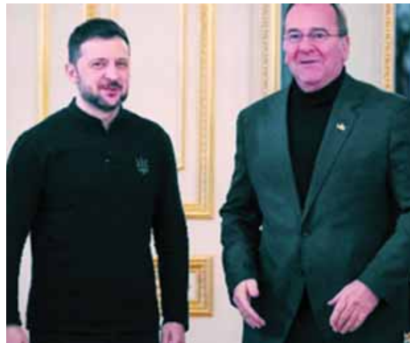
Ukrainian President Volodymyr Zelensky, left, and German Defence Minister Boris Pistorius greet each other in Kyiv, Ukraine, Tuesday.

Ukrainian President Volodymyr Zelensky said that he has held further discussions with French President Emmanuel Macron about the possibility of Western troops deploying in Ukraine to safeguard any peace deal ending the nearly three-year war with Russia. Zelensky's disclosure came before an official visit to Kyiv on Tuesday by German Defence Minister Boris Pistorius. He arrived in Kyiv on an unannounced visit following a meeting in Warsaw on Monday with his counterparts from France, the United Kingdom, Italy and Poland. Germany and the four other countries are Europe's five top military spenders. Pistorius told German news agency dpa that his visit to Kyiv aims to underscore Germany's strong support for Ukraine at a time when US President-elect Donald Trump's term beginning next week looks set to bring deep changes to Washington's policy on the war. Pistorius said that his visit "is a signal that Germany, as the biggest NATO country in Europe, stands by Ukraine — not alone, but with the group of five and many other allies." Trump has criticised the cost