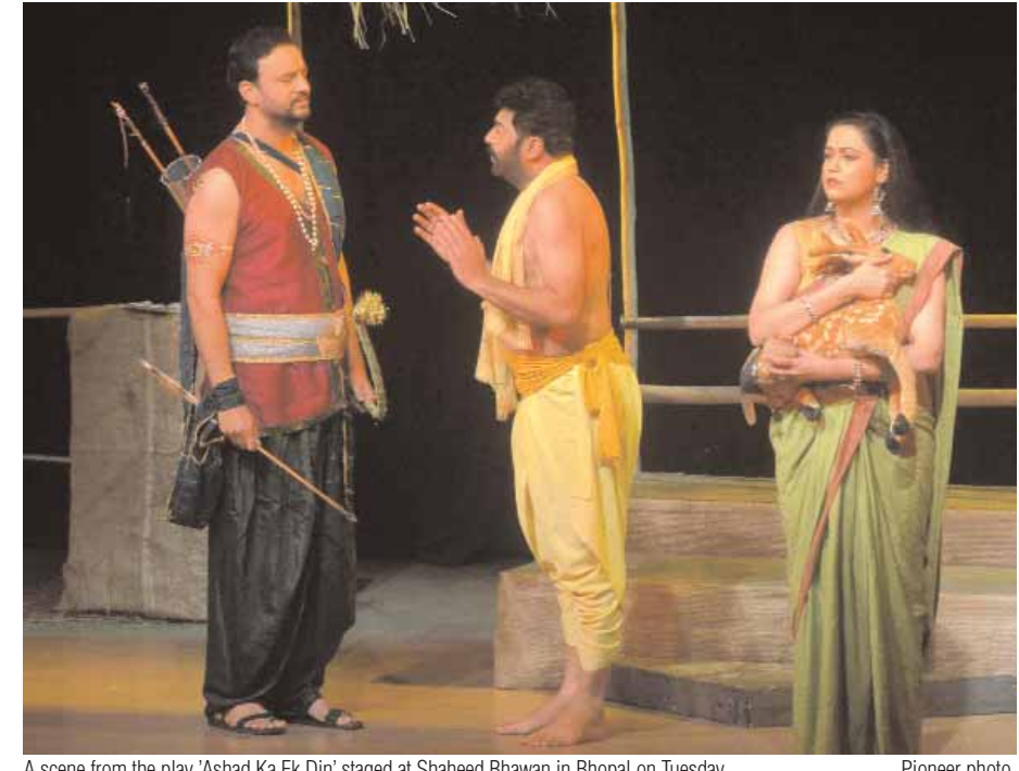
A scene from the play 'Ashad Ka Ek Din' staged at Shaheed Bhawan in Bhopal on Tuesday.