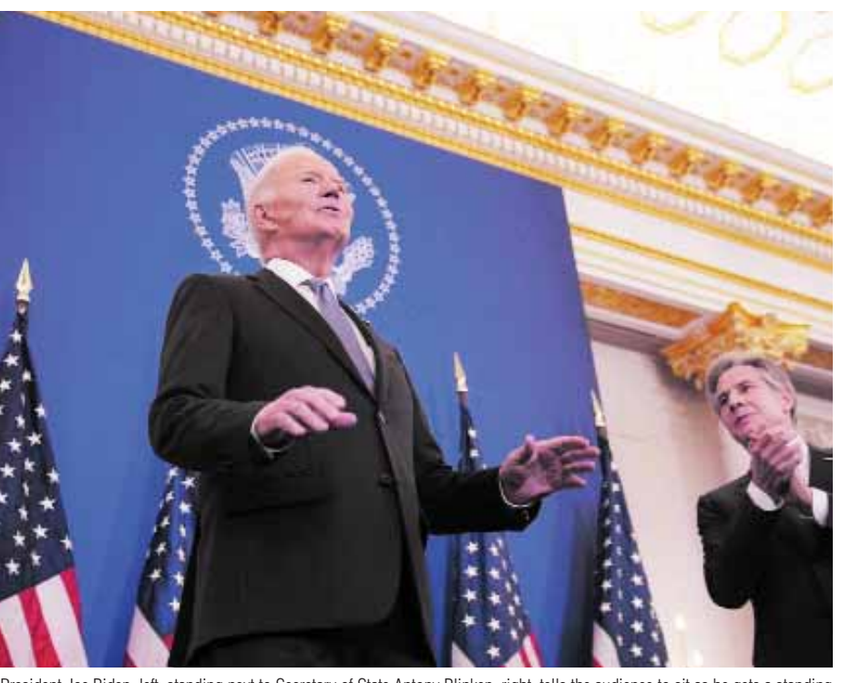
President Joe Biden, left, standing next to Secretary of State Antony Blinken, right, tells the audience to sit as he gets a standing ovation before making a speech about foreign policy at the State Department in Washington, Monday.