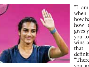
you look at it, it feels like wow, you know, you have done so much and you know why can't I do it more? You question yourself, and that's when it all starts, so yes," Sindhu said during an interaction facilitated by sports brand PUMA, which has signed her as an ambassador. Sindhu understands that she will have to endure plenty of struggles but she can't afford to lose hope.

When the going gets tough for P V Sindhu, the star badminton player dives into her highly successful past to seek inspiration to keep going in her quest for more glory.