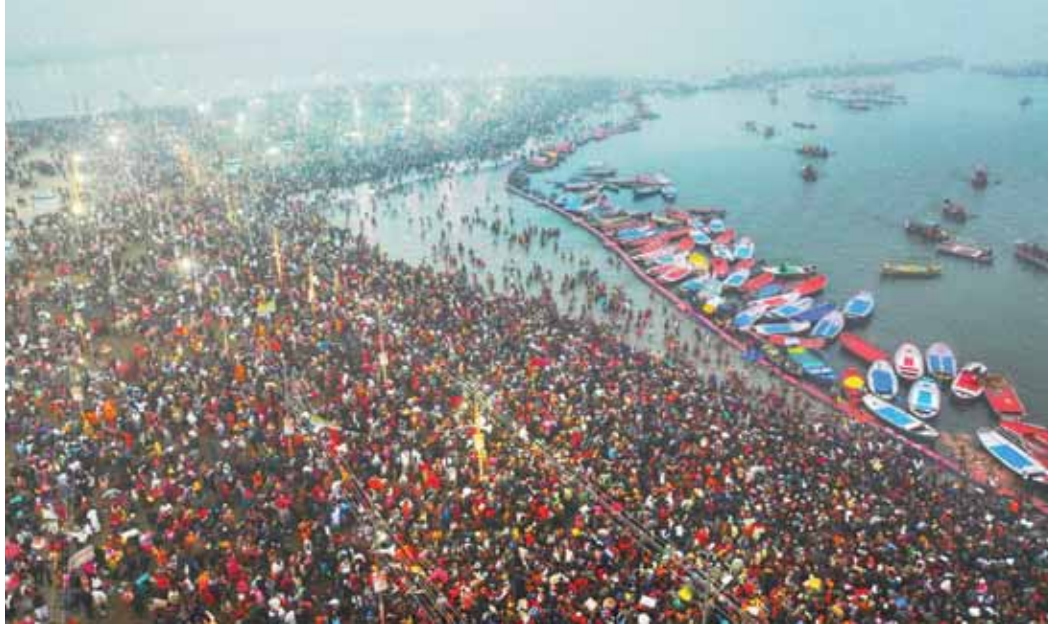
Devotees take a holy dip at Sangam during Maha Kumbh Mela 2025, in Prayagraj, Uttar Pradesh