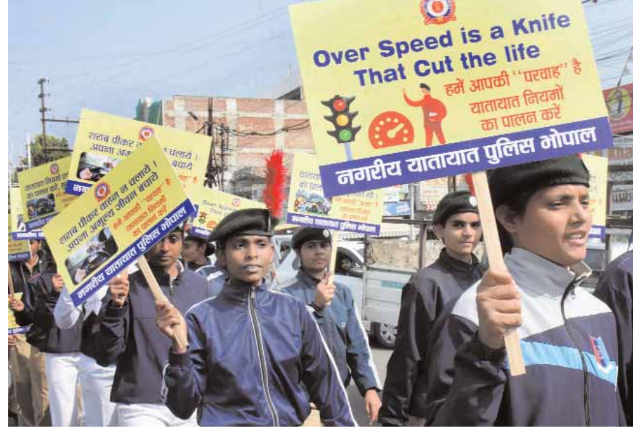
National Cadet Corps (NCC) contingents take part in a rally during a traffic awareness campaign "Parvaah" under Traffic Safety Month-2025 launched by traffic police in Bhopal on Monday.