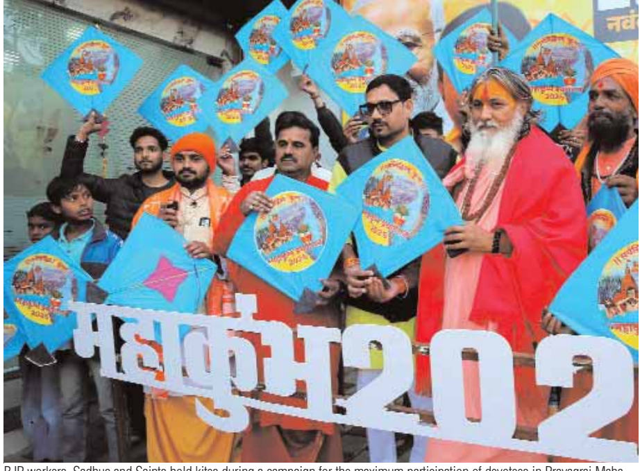
BJP workers, Sadhus and Saints hold kites during a campaign for the maximum participation of devotees in Prayagraj Maha Kumbh Mela-2025, on the eve of Makar Sankranti festival in Bhopal on Monday.