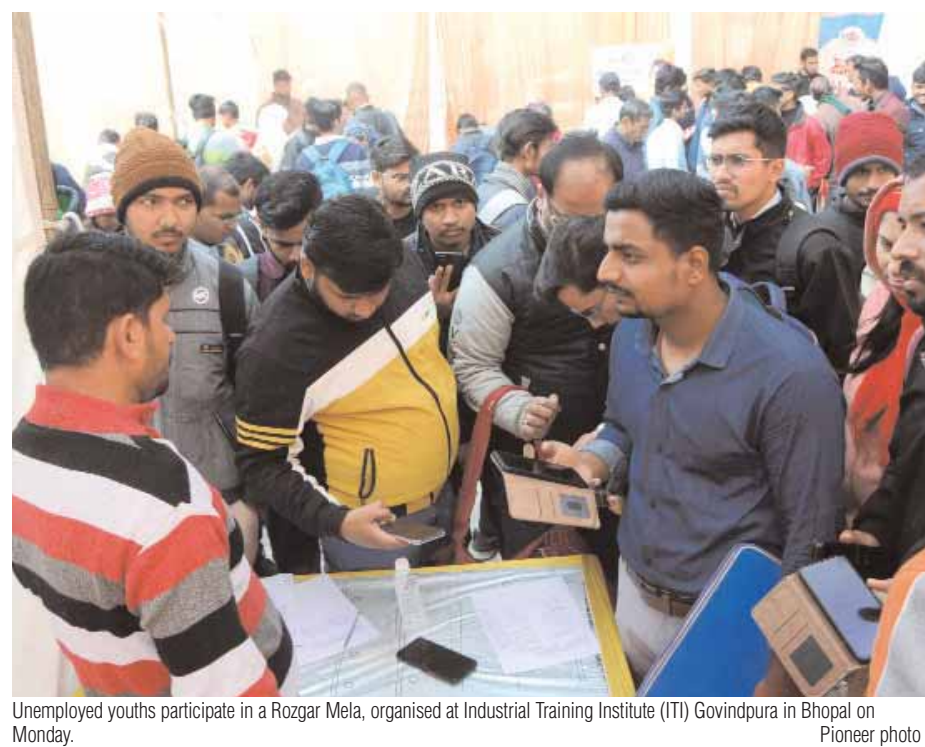
Unemployed youths participate in a Rozgar Mela, organised at Industrial Training Institute (ITI) Govindpura in Bhopal on Monday.