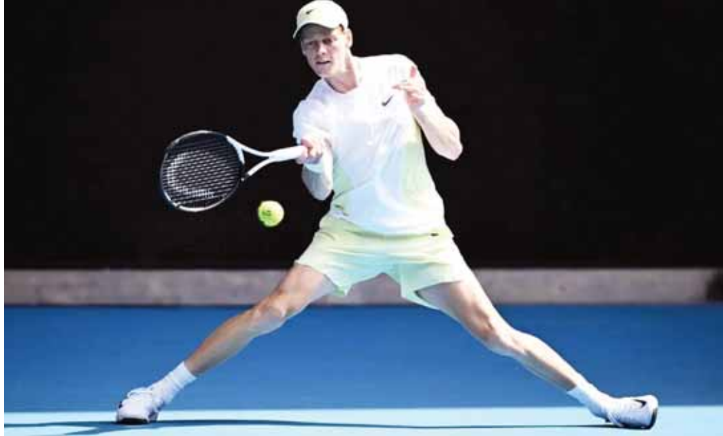
First marquee match and dropped an early service game before quickly settling into a rhythm in a 6-3, 6-3 win over 2020 champion Sofia Kenin. Third-seeded Gauff beat Swiatek

for two long, tiebreak sets against No. 35-ranked Jarry, a 29-year-old from Chile, before finding his touch. "It was a very close one because the first sets, they can go both ways," Sinner said. "In the third set when I broke it the first time, that gave me a little bit of room to breathe."