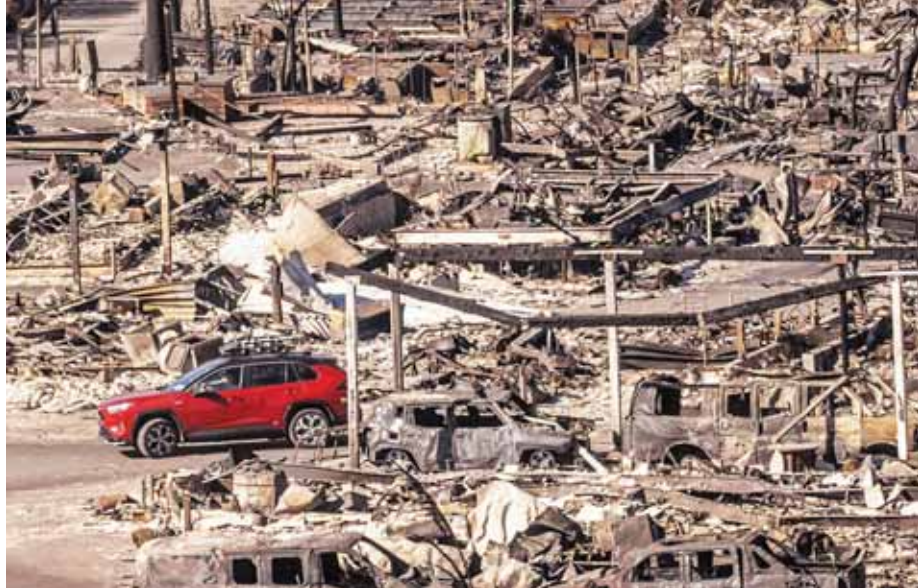
A car drives past homes and vehicles destroyed by the Palisades Fire at the Pacific Palisades Bowl Mobile Estates on Sunday, in Los Angeles.

After a weekend spent blocking the explosive growth of fires that destroyed thousands of homes and killed at least 24 people in the Los Angeles area, firefighters got a slight break with calmer weather but cast a wary eye on a forecast for yet more wind. Should that happen, already burned homes and valleys could flare anew, sending embers to unburned territory miles downwind. New fires could add to the complication. The death toll surged late Sunday with an update from the Los Angeles County medical examiner. At least 16 people were missing, a number authorities said was also likely to rise. The relative calm Sunday allowed some people to return to previously evacuated areas, however.