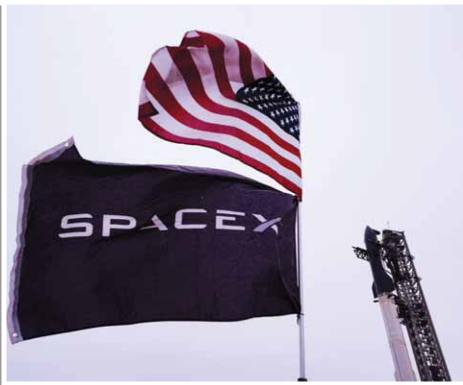
SpaceX's mega rocket Starship is prepared for a test flight from Starbase in Boca Chica, Texas, Sunday.