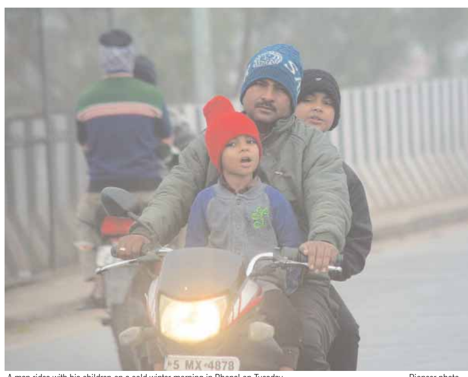
A man rides with his children on a cold winter morning in Bhopal on Tuesday.

Under the collaboration agreement between the M.P. State Co-operative Dairy Federation Limited and the National Dairy Development Board (NDDB), collection centers will be established in every Gram Panchayat to ensure fair pricing for milk producers. Milk unions' processing capacity will be expanded. Approximately Rs 1,500 crore will be invested over the next five years. The number of milk committees will increase from 6,000 to 9,000. Daily milk collection will grow from 10.5 lakh kg to 20 lakh kg. Annual income for milk producers is targeted to rise from Rs 1,700 crore to Rs 3,500 crore. Efforts will be made to promote the Sanchi brand at the national level.