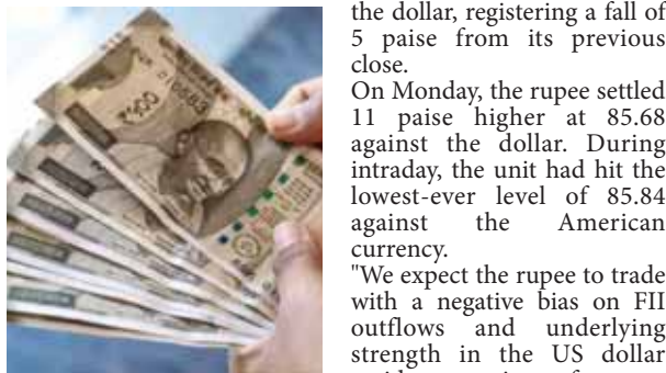
PTI ■ MUMBAI

The rupee fell 5 paise to settle (provisional) against the US dollar on Tuesday, as higher crude oil prices and outflow of foreign funds continued to weigh on the local unit.