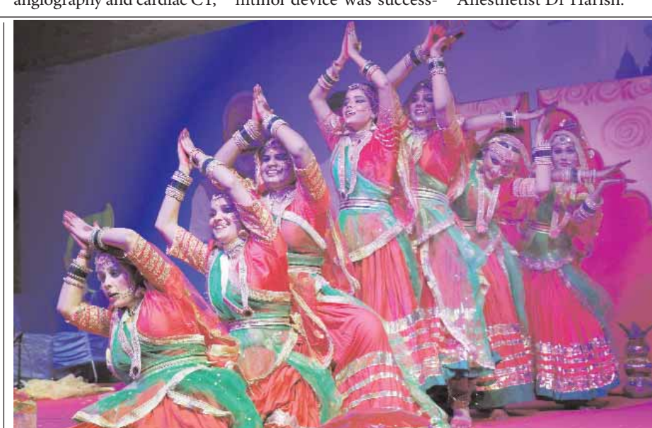
Artistes from Rewa perform during 28th State level Yuva Utsav-2025 at TT Nagar Stadium in Bhopal on Tuesday.

These incidents have spotlighted the need for stringent security measures and swift legal actions to ensure safety and justice within medical institutions and beyond.