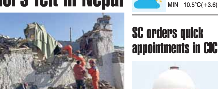
Rescue workers search for survivors in the aftermath of an earthquake in Changsuo Township of Dingri in Xigaze, southwestern China's Tibet Autonomous Region

Administration launched a level-II emergency service response and sent a work team to the site to assist with disaster relief