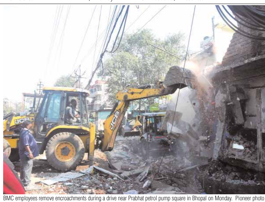
BMC employees remove encroachments during a drive near Prabhat petrol pump square in Bhopal on Monday.