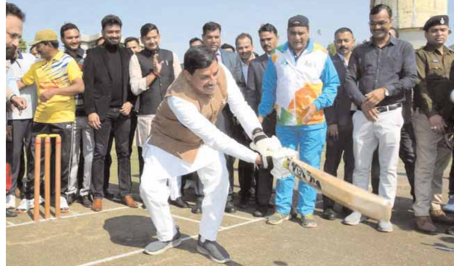
Madhya Pradesh Chief Minister Mohan Yadav plays a shot during the inauguration of 30th inter-press cricket tournament, at old campion ground in Bhopal on Monday.