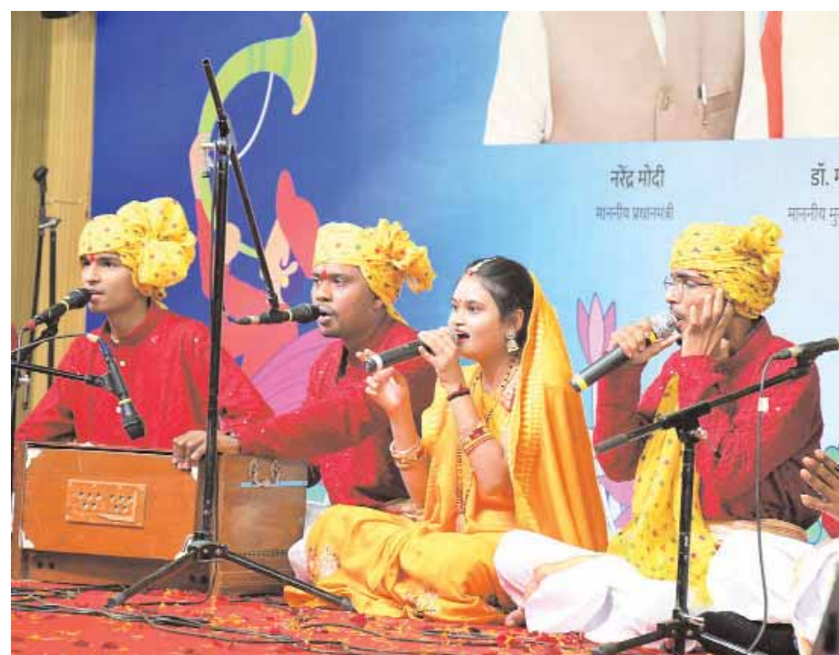
Artists perform during 28th State level Yuva Utsav at TT Nagar Stadium in Bhopal on Monday.