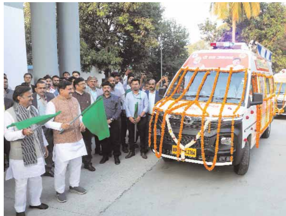
Madhya Pradesh Chief Minister Mohan Yadav flags off 66 mobile medical units in 21 districts under PM Janman Yojana, at his residence in Bhopal on Monday.