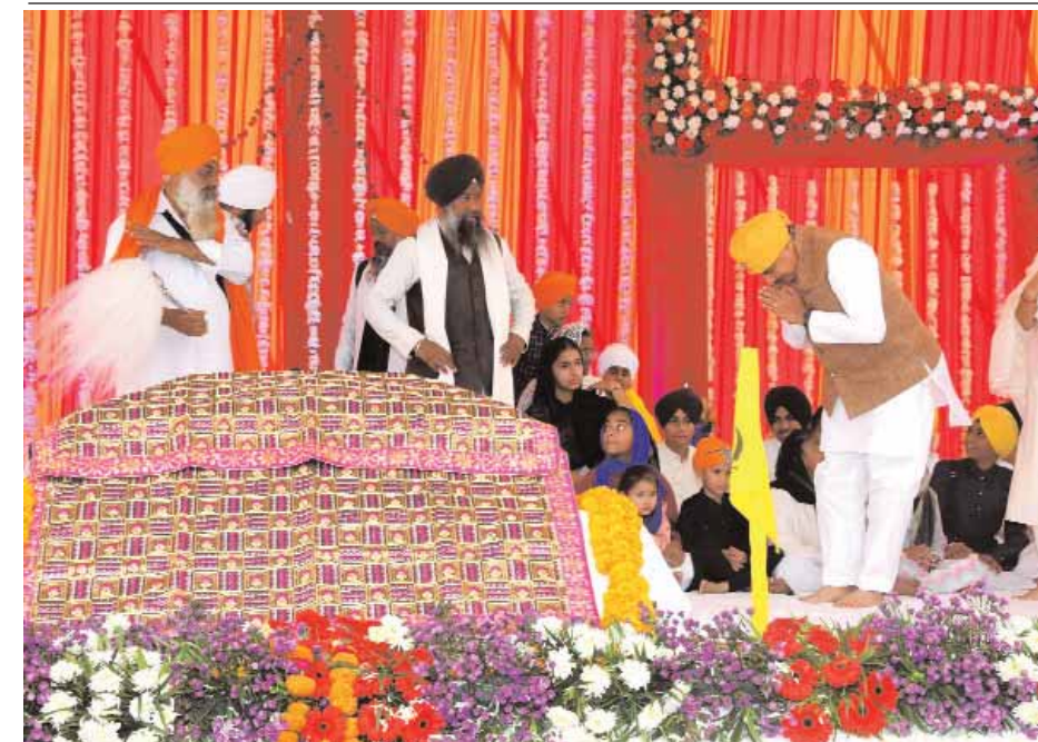
Madhya Pradesh Chief Minister Mohan Yadav offers prayers on the occasion of the 358th birth anniversary of Guru Gobind Singh, the tenth Sikh Guru, at Gurdwara Nanaksar in Bhopal on Monday.