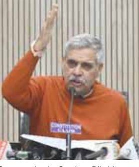
Congress leader Sandeep Dikshit.

Former MP and senior Congress leader Sandeep Dikshit on Tuesday lashed out at Aam Aadmi Party (AAP) supremo Arvind Kejriwal, calling him a "pathological liar" and said he will file defamation cases against Delhi chief minister Atishi and AAP Rajiya Sabha MP Sanjay Singh over their allegation against him of taking money from the BJP. "A few days ago, the Delhi CM said that we took money from the BJP. After this Press conference, I will file a criminal and civil defamation case against (CM) Atishi and Sanjay Singh. I will ask for Rs 10 crore and out of that money, I will donate Rs five crore to Yamuna cleaning and the remaining half will be donated to clean the polluted air in Delhi," he said. They used to say that they have increased sewage treatment by 1.5 times in Delhi. "When the Congress lost the elections, the sewage treatment capacity was at 604 MGD and it remains the same today. The former chief minister lies that he has increased sewage treatment work," Dikshit alleged. The Lieutenant Governor took a review in 2023 and it was found that the pollution effluent going into Yamuna has doubled in the last seven