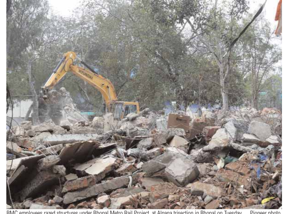
BMC employees razed structures under Bhopal Metro Rail Project, at Alpana trisection in Bhopal on Tuesday.