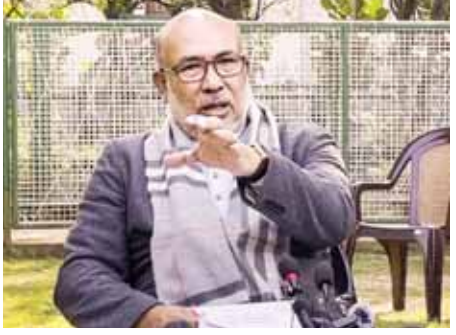
Manipur Chief Minister N. Biren Singh addresses a press conference

state over the last 20 months since the ethnic conflict began in May 2023. "From May to October, 2023, 408 firing incidents were reported. From November 2023 to April 2024, there were 345 firing incidents, whereas from May this year till now, 112 firing incidents were reported," he said. He said that of all the looted weapons, 3,112 have been recovered and 2,511 explosives have been seized during the period. The chief minister further said that 625 people have been arrested and 12,047 FIRs registered so far. More than 250 people have been killed and thousands rendered homeless in ethnic violence between Imphal Valley-based Meiteis and adjoining hills-based Kuki-Zo groups since May last year. Meanwhile, Manipur, which has been witnessing prolonged ethnic violence between majority Meitei and tribal Kuki communities, accounted for about 77 per cent of the total violence in the entire northeastern region in 2023, according to the latest annual report of the Ministry of Home Affairs. In 2023, Manipur witnessed an increase in violent incidents owing to the prevailing ethnic strife and the resultant increase in the casualties of civilians and security forces personnel as compared to 2022. The state accounted for about 77 per cent of the total violent incidents in Northeastern region in 2023, according to the MHA annual report. Among the total 243 violent incidents occurred in the Northeast, 187 took place in Manipur.