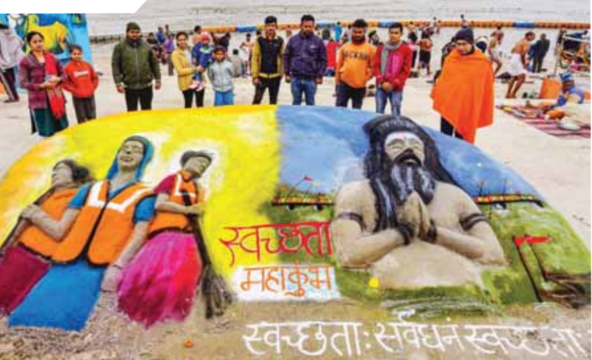
Devotees look at a sand sculpture themed on 'clean Mahakumbh' ahead of Mahakumbh 2025, in Prayagraj