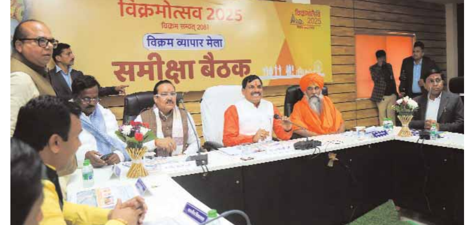
Madhya Pradesh Chief Minister Mohan Yadav reviews the preparations of Vikramotsav-2025 during saint Balinath Bairwa jayanti celebration programme in Ujjain, Madhya Pradesh on Tuesday.