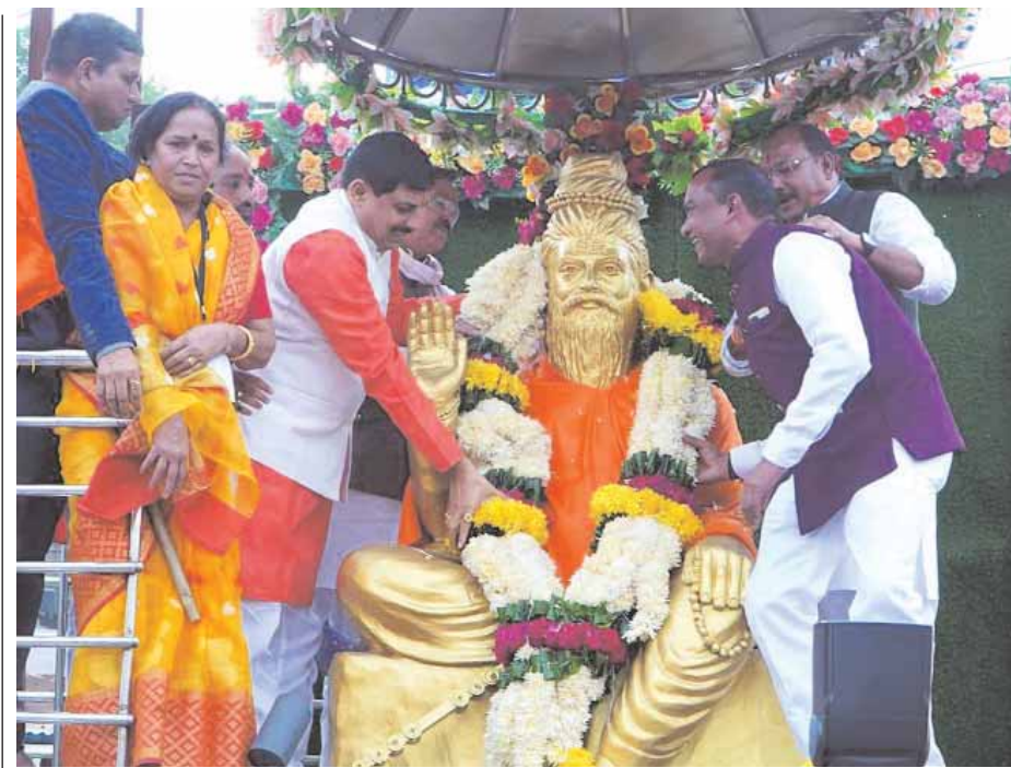
Madhya Pradesh Chief Minister Mohan Yadav pays tribute to saint Balinath Bairwa during his birth anniversary celebration programme in Ujjain, Madhya Pradesh on Tuesday.

of men, fostering an inclusive society in the state. Under the mission, vocational training will be offered to women for education and skill development. This will enhance their employability, improve their career prospects, and lead to financial independence. The mission also aims to promote women's entrepreneurship by providing resources, guidance, and financial support to help them establish and efficiently run their businesses. To address gender-specific issues such as domestic violence and dowry harassment, the mission includes programs for social empowerment. It will raise awareness about women's rights and create a supportive environment. Additionally, one-stop centers will be established to offer women legal aid, counseling, and medical assistance.