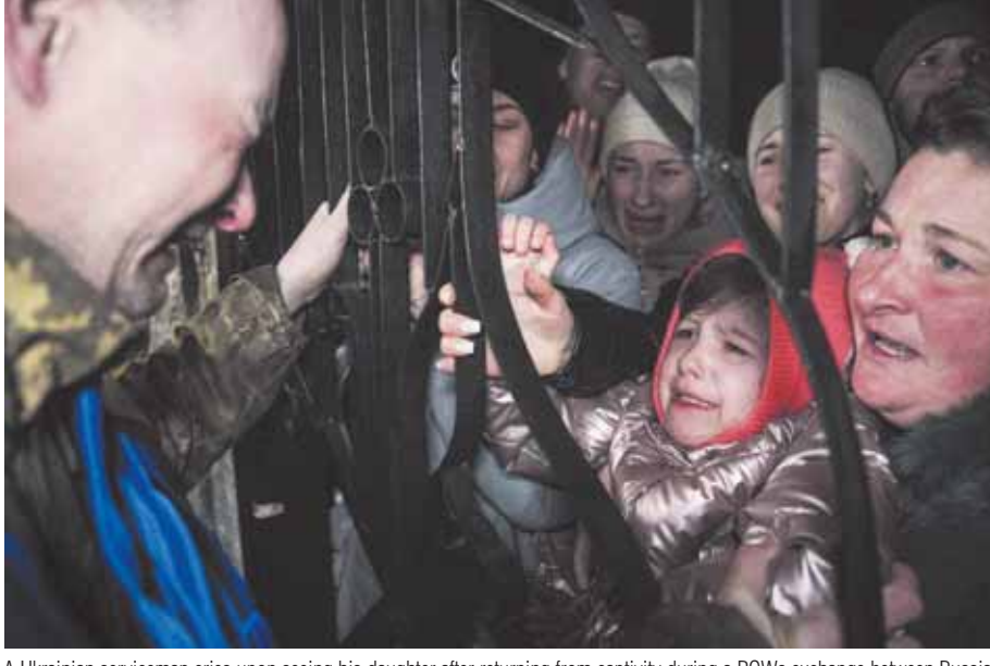
A Ukrainian serviceman cries upon seeing his daughter after returning from captivity during a POWs exchange between Russia and Ukraine, in Ukraine.

Russia launched an aerial attack on Ukraine on Tuesday, striking the capital and other regions with multiple missiles and drones. Ukraine's air force reported a ballistic missile threat at 3:00 a.m. (0100 GMT), with at least two explosions heard in Kyiv minutes later.