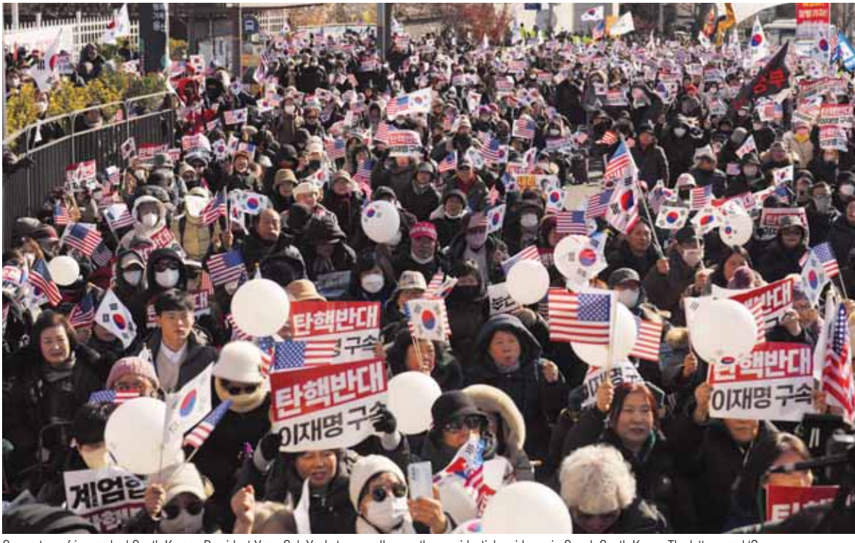
Supporters of impeached South Korean President Yoon Suk Yeol stage a rally near the presidential residence in Seoul, South Korea. The letters read 'Oppose Impeachment', and 'Arrest Lee Jae-myung'.