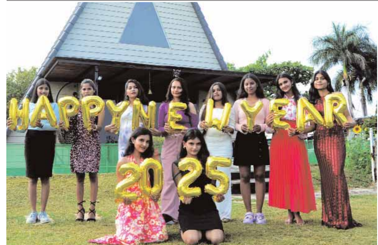
Young women celebrate on the eve of new year 2025, in Bhopal on Tuesday.