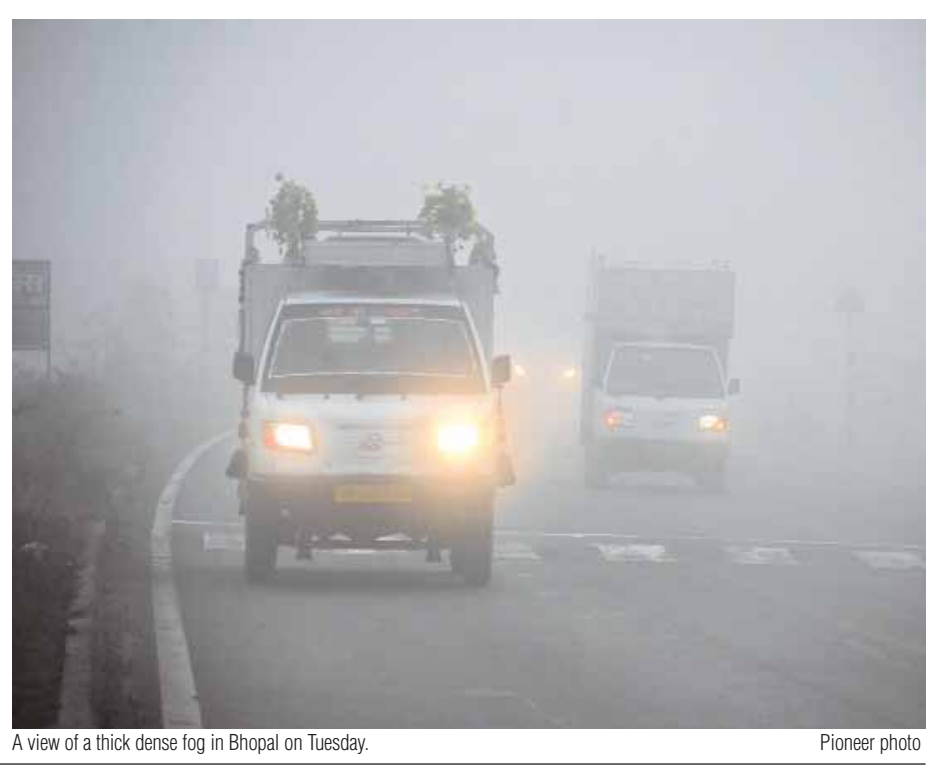
A view of a thick dense fog in Bhopal on Tuesday.

of 500 to one thousand meters was recorded in Bhopal, Damoh, Jabalpur, Sagar, Rajgarh. Visibility was up to 1 to 2 km in the remaining cities. Here, the effect of cold has also increased at night. The mercury came down to 9.6 degrees in Bhopal. 9.5 degrees were recorded in Jabalpur. Indore had 14.3 degrees, Gwalior had 11.4 degrees and Ujjain had 13 degrees. Rajgarh was the coldest at night. The mercury here was recorded at 5.6 degrees. Mandla had 6.7 degrees, Tikamgarh had 8.2 degrees, Pachmarhi had 8.5 degrees, Narsinghpur had 8.8 degrees, Nowgong had 9 degrees, Raisen had 9.1 degrees, Guna had 9.3 degrees, Umaria had 9.6 degrees, Malajkhanda had 9.7 degrees.