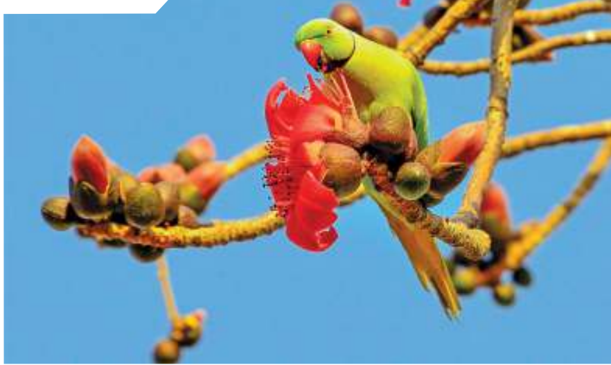
A parrot perches on a 'Palas' flower, in Bastar