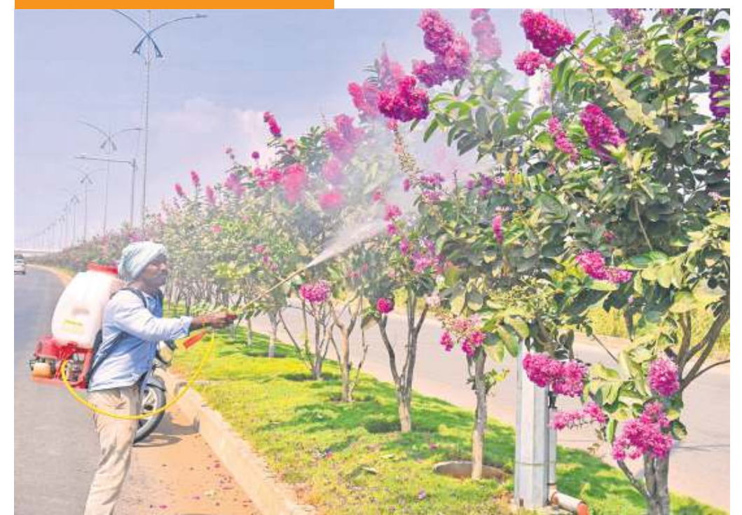
A worker sprays flower blooming hormones to boost the flower growth of the trees on the Seed Access Road at Venkatayapalem in Amaravati on Monday.