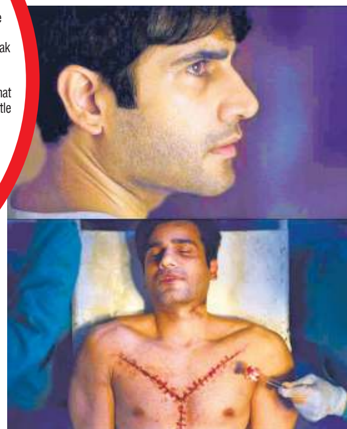
Get ready for chills and thrills! Karan Tacker shares a spine-tingling glimpse from the teaser of Bhay , where he steps into the shoes of Gaurav Tiwari, India's top paranormal investigator. Brace yourself for the ultimate supernatural experience!