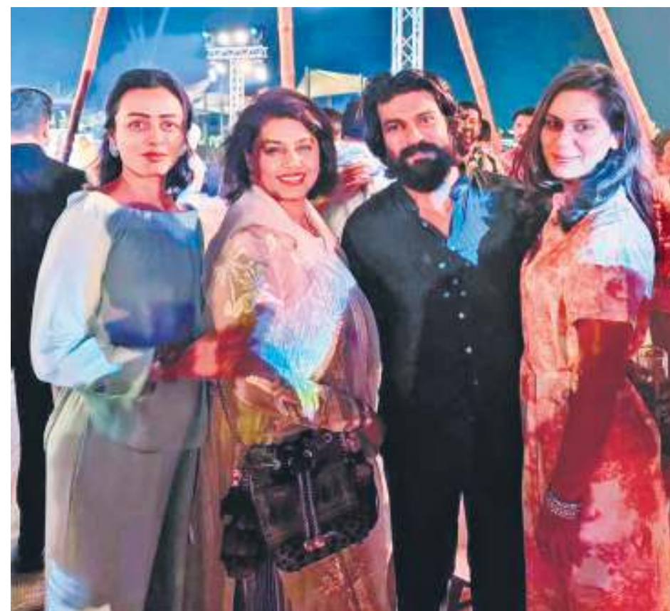
Namrata Shirodkar attended a star-studded wedding in Abu Dhabi, UAE, alongside Jr NTR, Ram Charan and others. She shared photos with the attendees on Instagram. Notably, Mahesh Babu's absence from the event sparked speculation about the actor working on his upcoming project with SS Rajamouli and Priyanka Chopra.