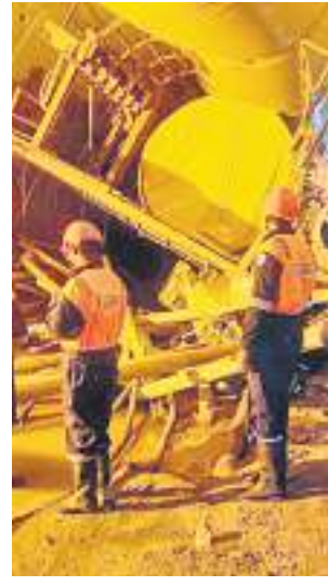
HYDERABAD

on public issues, he called for honest and sincere efforts to champion the people's cause. "Victory is assured if we stand with the people and remain among them," he said, cautioning against any retreat in the fight for public welfare. He dismissed fears of the current government, assuring unwavering support to every member and framing this as an opportunity to prove the party's strength as the opposition.