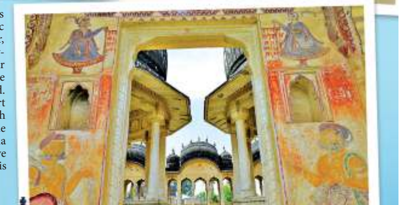
THE TOWN OF RAMGARH SHEKHAWATI IS DOTTED WITH CHATTRIS AND HAVELIS THAT ARE EXQUISITELY CARVED