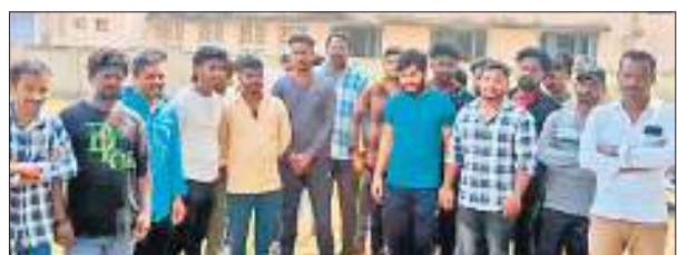
Defrauded youths who spent lakhs seeking high-paid jobs in Italy

The scammers targeted vulnerable job seekers in Parvathipuram Manyam district and Telukunchi village of Ichchapuram mandal, promising monthly salaries ranging from Rs. 1.20 lakh to Rs. 1.60 lakh. They offered a month-long training program in welding and fire safety, providing fake certificates