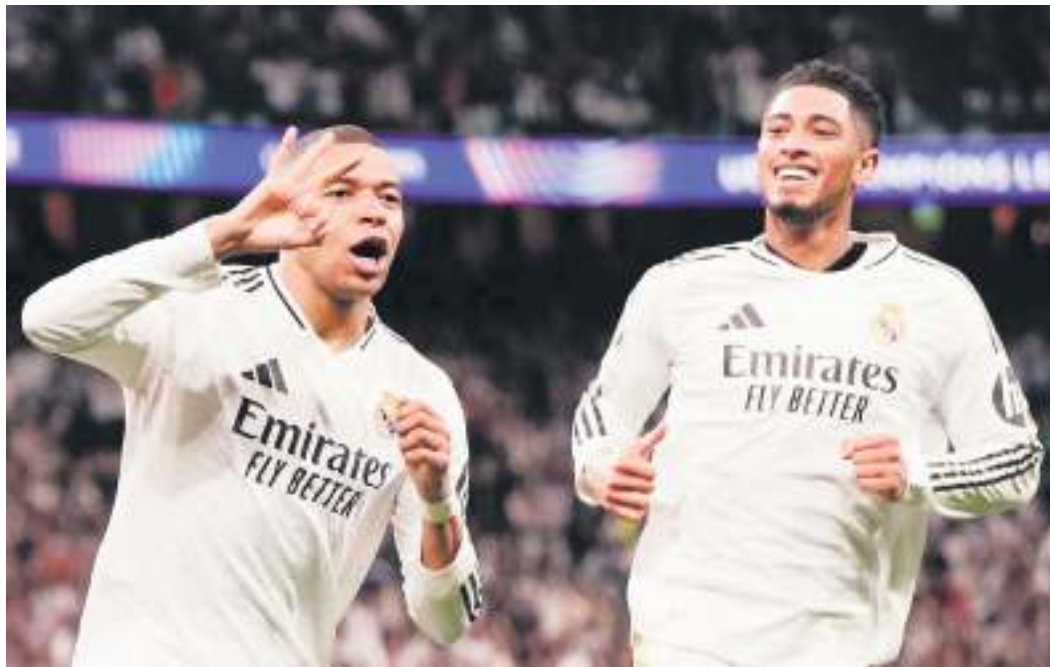
City players toward encircling him. "I have always said I didn't come here simply to complete a dream," said Mbappé, a boyhood Madrid fan who never won a Champions League at Monaco and PSG. "I want to play well, I want to mark an era." Coach Pep Guardiola's injury-hit side — with Ballon d'Or winner Rodri out since September and Kevin De Bruyne now rarely starting — has looked like a shadow of the heavyweight rival that met Madrid in each of the past three seasons, when each time the winner went on to lift the trophy. Paris Saint-Germain hits 10 PSG has not lost anywhere since a Champions League defeat at

Defender Ryan Flamingo scored in the 98th minute for a 3-1 win on the night and 4-3 on aggregate. United States international Timothy Weah scored for Juventus. "Honestly, we slipped up," Weah said. "I felt like they were more aggressive on the night and we lacked a bit of aggression and hunger." In the early game Wednesday, Borussia Dortmund started with a 3-0 lead at home to Sporting Lisbon and was barely stretched in a 0-0 draw. Sporting's Champions League campaign imploded after coach Ruben Amorim left for Manchester United in November. Mbappé mastery Mbappé's first goal of the two-leg playoff in Manchester was a lucky miscue, a looping effort off his shin to level at 1-1 in what ended a 3-2 win. His three goals in Madrid were classy and decisive. A first-time lob over City goalkeeper Ederson — who perhaps advanced too far, too soon — was followed by a low shot after leaving defender Joško Gvardiol on the turf. The third was a powerful left-footer from the edge of the penalty area when he had lured six Man