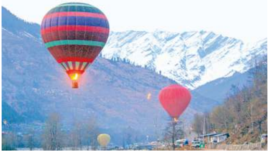
Tourists ride a hot air balloon in Kullu