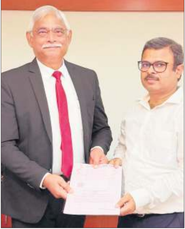
women and the elderly in the poor fishermen community of Konaseema and West Godavari (Bhimavaram) districts. This is the largest CSR project undertaken by AP Red Cross since the state's bifurcation in June 2014. The project, with a total cost of Rs 8.40 crore, will be implemented over three years from April 2025, fully funded by the REC Foundation.

The project aims to provide healthcare services to the poor and tribal communities in inaccessible areas of Parvathipuram Manyam, Alluri Sitharama Raju (ASR), Paderu, Palnadu, Tirupati, and Nandyal districts, which lie along the Eastern Ghats and Nallamala Range. Additionally, it will cater to