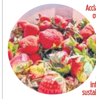
Acclaimed as the 'Kashmir of Andhra Pradesh,' Lambasingi is emerging as a major strawberry farming hub, blending agriculture with tourism while overcoming challenges in infrastructure and sustainability

The journey to Lambasingi is an experience in itself, with winding ghat roads flanked by lush greenery offering a picturesque view. As travellers approach, they are greeted by crisp mountain air and the soothing sound of cascading streams. A short detour from Lothugedda Junction