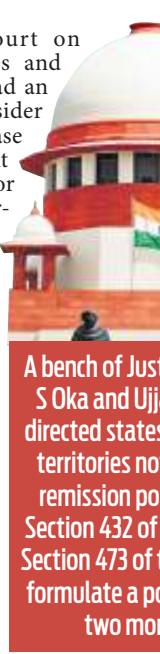
A bench of Justices Abhay S Oka and Ujjal Bhuyan directed states and union territories not having a remission policy under Section 432 of the CrPC or Section 473 of the BNSS to formulate a policy within two months.

vict or his relatives to make a specific application for grant of permanent remission. When the jail manual or any other departmental instruction issued by the appropriate government contains such policy guidelines, the aforesaid direction will apply." The judgement came in a suo motu case over the grant of bail. The top court said the government concerned had the power to incorporate suitable conditions in an order granting permanent remission and consideration of various factors was necessary before finalising the riders. "The conditions must aim at ensuring that the criminal tendencies, if any, of the convict remain in check and that the convict rehabilitates himself in the society. The conditions should not be so oppressive or stringent that the convict is not able to take advantage of the order granting permanent remission. The conditions cannot be vague and should be capable of being performed," it said.