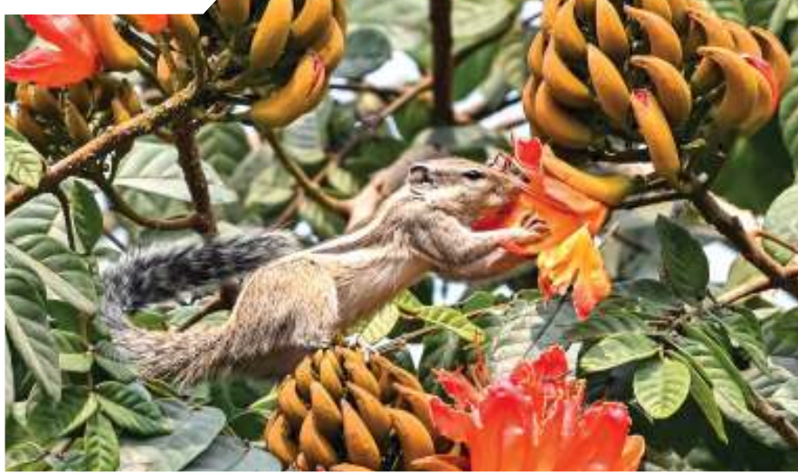
A squirrel enjoys palash flowers, in Nadia