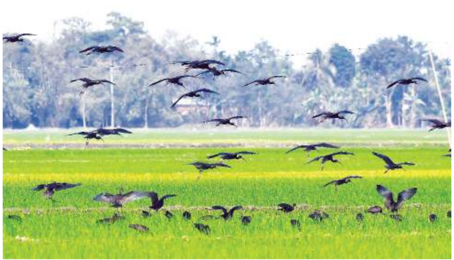
A flock of ibis flying over a paddy field, in Nagaon