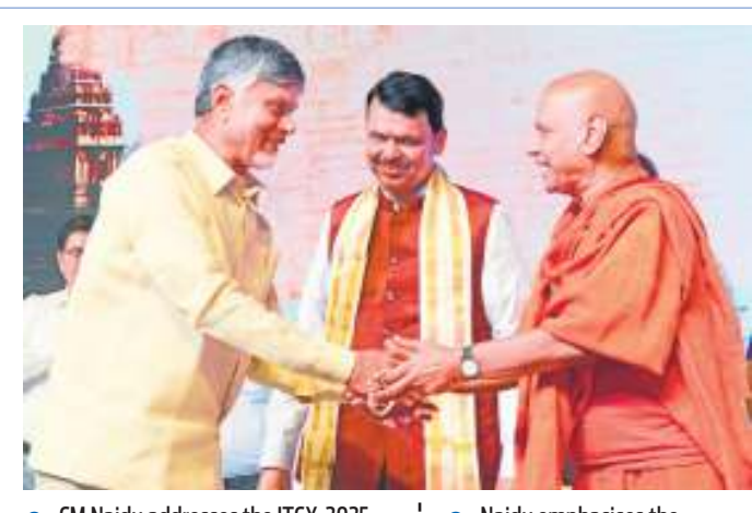
CM Naidu addresses the ITCX-2025 in Tirupati The event sees participation from several prominent leaders, including Maharashtra CM Devendra Fadnis and Goa CM Pramod Sawant Naidu emphasises the evolving role of temples as economic and cultural hubs, with temple-related activities in India valued at Rs 6 lakh crore

PNS ■ TIRUPATI Addressing the second edition of the International Temples Convention & Expo (ITCX) 2025 in Tirupati, Chief Minister N Chandrababu Naidu unveiled his vision for a self-sustaining, technology-driven temple ecosystem, blending spirituality with modern governance. He emphasised the importance of preserving temple heritage while integrating technology and fostering economic growth within temple ecosystems. The event saw the participation of Maharashtra Chief Minister Devendra Fadnis, Goa Chief Minister Pramod Sawant, Union Minister of State for Power and Renewable Energy Sripathi Yesso Naik, TTD Chairman BR Naidu, and ITCX Founder Gireesh Vasudev Kulkarni. Referring to ITCX as the 'Maha Kumbh of temples', CM Naidu highlighted the significance of temple conventions in shaping discussions on temple administration, economic impact, and cultural preservation. He noted that the inaugural ITCX was held in Varanasi, making Tirupati a fitting venue for its second edition. With over 1,500 temples from multiple countries, 685 virtual attendees, 111 speakers, 15 workshops, and 60 stalls, the event marked a milestone in global temple collaboration. Continued on Page 2