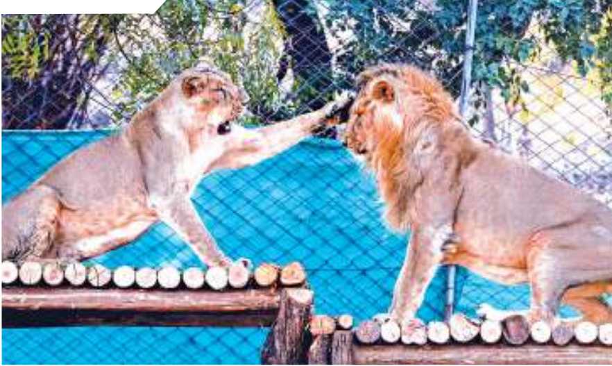
A pair of Asiatic lions inside their enclosure at Van Vihar National Park in Bhopal