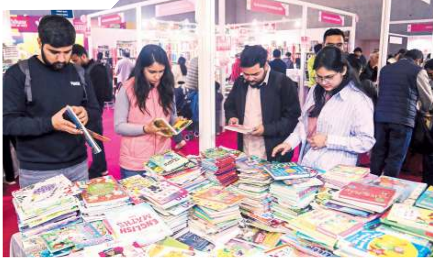
Visitors at the 'World Book Fair' at Pragati Maidan, in New Delhi