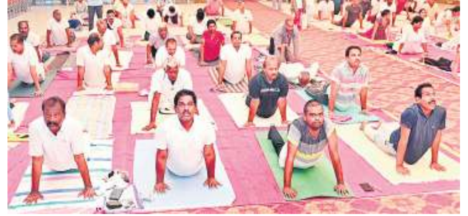
The 100 Yoga Gurus successfully performed Surya Namaskar 108 times as well as 12 types of yoga asanas, leading to the event being recognised in the International Book of World Records