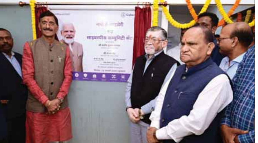
Governor Santosh Gangwar, Union Minister for State Sanjay Seth, Ranchi MLA CP Singh during the inaugural ceremony of 'NaMo E-Library cum CyberPeace Community Centre' at Argora in Ranchi on Wednesday.

pensatory measures. This directive by the Jharkhand High Court is being closely watched by the Sikh community and human rights advocates alike. It underscores the enduring quest for justice for the victims of one of the most traumatic events in India's recent history and serves as a reminder of the state's responsibility to address historical injustices through effective policy implementation and diligent oversight.