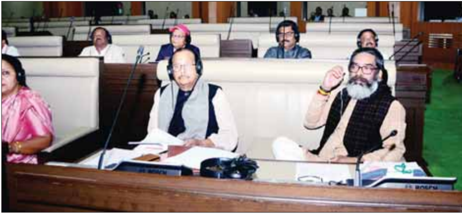
BJP MLAs stage a protest against the state government during ongoing Budget Session at Assembly in Ranchi on Tuesday.

As soon as the proceedings of the Assembly began,