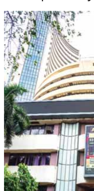
Stock Exchange building, Mumbai

PIONEER NEWS SERVICE ■ MUMBAI Benchmark BSE Sensex recovered 147 points in a range-bound trade on Tuesday, ending its five-day slide on the back of buying in financial and FMCG shares. The 30-share BSE benchmark Sensex climbed 147.71 points or 0.20 per cent to settle at 74,602.12 with 17 of its constituents ending higher and 13 lower. During the day, it rallied 330.67 points or 0.44 per cent to 74,785.08.