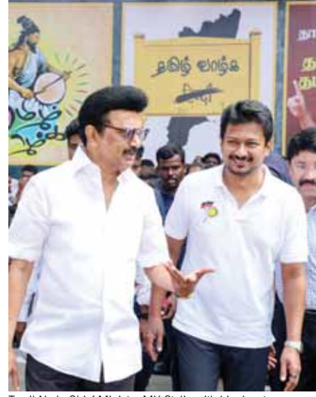
Tamil Nadu Chief Minister MK Stalin with his deputy Udayanithi Stalin and others at the opening of 'Kalaingar Centenary Boxing Academy' in Chennai.