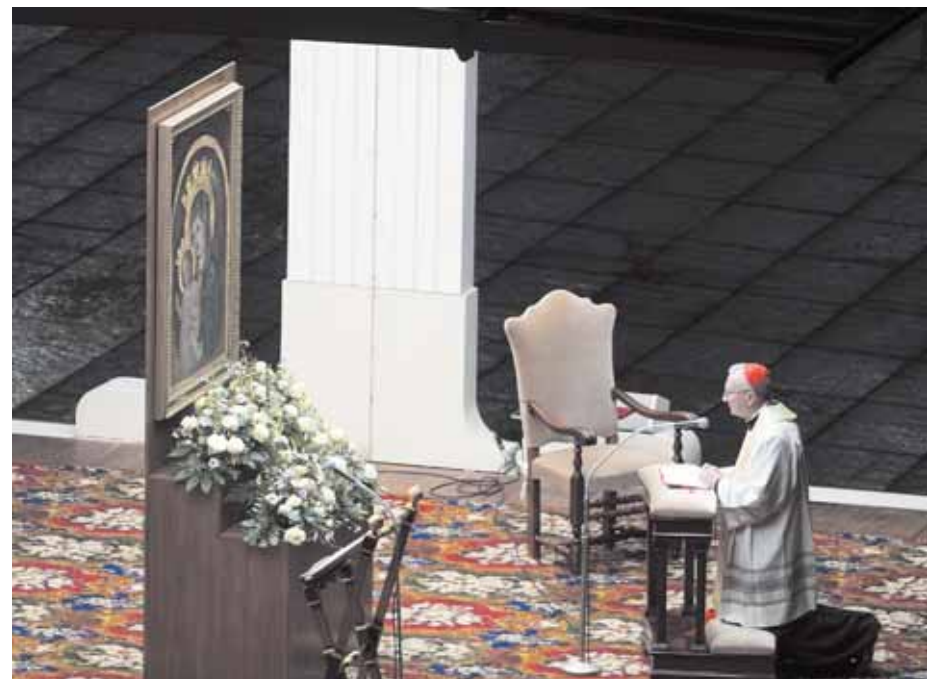
Cardinal Pietro Parolin, Vatican Secretary of State during a rosary prayer service held for the health of Pope Francis in St Peter's Square at The Vatican, on Monday

Pope slept well: On Tuesday morning, the Vatican's typically brief morning update said: "The pope slept well, all night." The previous evening, doctors had said he remained in critical condition with double pneumonia but reported a "slight improvement" in some laboratory results. In the most upbeat bulletin in days, the Vatican said Francis had resumed work from his hospital room, calling a parish in Gaza City that he has kept in touch with since the war there began. The Argentine pope, who had part of one lung removed as a young man, has been hospitalised since February 14 at Rome's Gemelli hospital and doctors have said his condition is touch-and-go, given his age, fragility and pre-existing lung disease before the pneumonia set in. But in Monday's update, they said he hadn't had any more respiratory crises since Saturday, and the flow and concentration of supplemental oxygen has been slightly