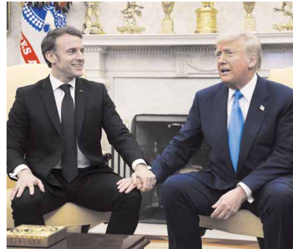
US President Donald Trump speaks during a meeting with France's President Emmanuel Macron in the Oval Office of the White House in Washington, on Monday