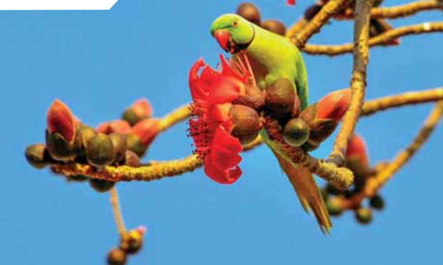
A parrot perches on a 'Palas' flower, in Bastar