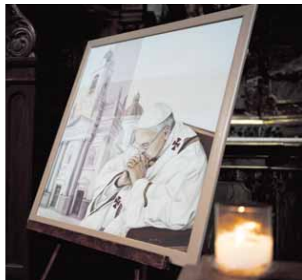
A candle glimmers alongside a painting of Pope Francis at San José de Flores basilica, Buenos Aires, Argentina, where he worshipped as a youth.

PTI ■ ROME Pope Francis woke up and was continuing his therapies on Monday after a quiet night, on the 10th day of his hospitalisation for a complex lung infection that has provoked the early stages of kidney insufficiency, the Vatican said. "The night passed well, the pope slept and is resting," it said. A medical bulletin was expected later Monday. He is continuing to feed himself and is not receiving artificial or liquid nutrition, the Vatican said. Late Sunday, doctors reported that blood tests showed "early, slight kidney insufficiency" that was nevertheless under control. They said Francis, 88, remained in critical condition but that he hadn't experienced any further respiratory crises since Saturday. He was receiving high flows of supplemental oxygen and, on Sunday, was alert, responsive and attended Mass. They said his prognosis was guarded.