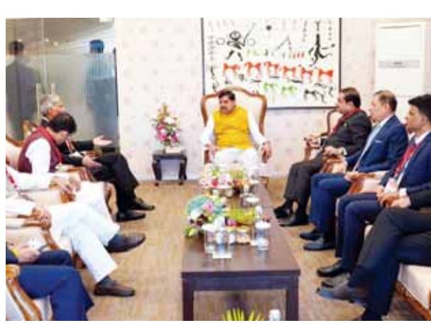
Madhya Pradesh Chief Minister Mohan Yadav in a meeting with Gautam Adani and other industrialists during Global Investors Summit 2025 in Bhopal.

the state government. "Today, I am proud to announce new investments of over ₹1,10,000 Crore in the areas of pumped storage, cement, mining, smart-meters and thermal energy. These multi-sectoral investments will create more than 1,20,000 jobs in Madhya Pradesh by 2030," he said. Adani said the plans are not just about investments, but they are milestones in a shared journey - one that would make the state a national leader in industrial and economic growth. The inaugural MP Global Investors Summit began with big-ticket announcements - with the state going all out to woo global investors and large business houses to invest in the MP's limitless potential. NTPC-NGEL (NTPC Green Energy Ltd) and MPPGCL (Madhya Pradesh Power Generation Company Ltd) signed a Memorandum of