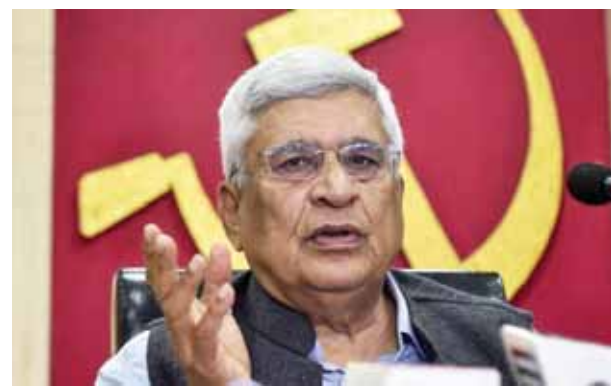
Leader Prakash Karat CPI (M)

Changing its stand, the CPI(M) has issued a note to its State units on the draft political resolution for the upcoming Party Congress. The note says the party does not consider the Narendra Modi Government or the Indian State as "neo-fascist", even as there are manifestations of "neo-fascist characteristics". The note sent to the State units of the Communist Party of India (Marxist) also stresses that the position is different from that of other Left parties, such as the Communist Party of India (CPI) and the Communist Party of India (Marxist-Leninist) Liberation. The CPI has characterised the BJP-led Centre as a fascist government, while the CPI(M) has said an "Indian fascism" has been put in place. The CPI(M)'s note says the political resolution talks about the danger of the Hindutva-corporate authoritarianism going towards neo-fascism, if the BJP-RSS is