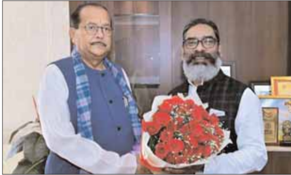
Minister of Parliamentary Affairs Department Radha Krishna Kishore welcoming Chief Minister Hemant Soren during the first day of the Budget session of the State Assembly in Ranchi on Monday. PNS

Education remained a key focus, with the government approving the establishment of three residential schools in Dumka and Bokaro. The Jaipal Singh Munda Scholarship Scheme has been introduced to support Scheduled Tribe and Scheduled Caste students, along with the development of learning materials in tribal languages. The Governor also announced the launch of the Valmiki Scholarship for orphaned and differently-abled students.