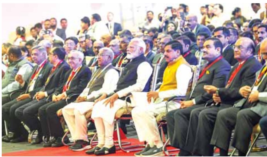
PM Narendra Modi with Madhya Pradesh CM Mohan attends the Global Investors Summit 2025 in Bhopal

Prime Minister Narendra Modi on Monday said with a strong talent pool and thriving industries, Madhya Pradesh is becoming a preferred business destination and that this is the time, and right time, to invest in the state. He was speaking after inaugurating the mega 'Invest Madhya Pradesh - Global Investors Summit 2025' at the Indira Gandhi Rashtriya Manav Sangrahalaya, located near the picturesque Upper Lake in Bhopal, to showcase the state's infinite possibilities for investors and industrialists. Modi said the World Bank has expressed confidence that India will continue to be the world's fastest growing economy in the coming years. The World Bank recently said in its Global Economic Prospects report that India will remain the fastest-growing major economy for next two years. Modi also said the Deregulation Commission will help create investment-friendly regulatory