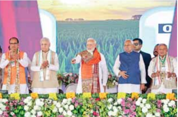
Prime Minister Narendra Modi with Bihar Governor Arif Mohammed Khan, Union Minister Shivraj Singh Chouhan and Chief Minister Nitish Kumar during the release of the 19th installment of the PM Kisan Samman Nidhi (PM-KISAN) scheme and launch of various development projects in Bhagalpur

PUBLISHED FROM: DELHI | LUCKNOW | BHOPAL | BHUBANESWAR | RANCHI | RAIPUR | CHANDIGARH | DEHRADUN | HYDERABAD | VIJAYWADA