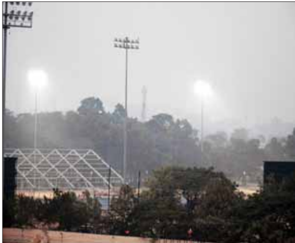
weather will remain dry with light clouds. At the

Meanwhile, the weather in Jharkhand has cleared. The sky is clear in most of the districts of the state and the sun has been shining since morning. Along with this, the weather is also cold in the early morning. The Meteorological Department has informed that there is no major change in the weather till March 1. The