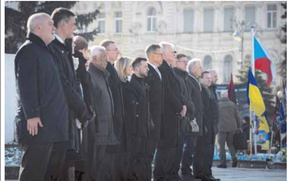
European leaders attending the ceremony at the memorial to the fallen Ukrainian soldiers on Independence Square in Kyiv, Ukraine, on Monday.

the Russian and American sides. Leaders across the EU, fearing both that Trump's approach to Ukraine would lead to an unfavorable settlement for Kyiv and that they — among Ukraine's most important supporters — would be sidelined in negotiation for peace, have rushed to assert their own response to the rapidly shifting environment. The EU's top diplomat, Kaja Kallas, insisted on Monday that the US cannot seal any peace deal to end the war without Ukraine or Europe being involved. She highlighted what she claimed were pro-Russian positions being taken up by the Trump administration. "You can discuss whatever you want with Putin. But if it comes to Europe or Ukraine, then Ukraine and Europe also have to agree to this deal," Kallas told reporters in Brussels, where she is chairing a meeting of EU foreign ministers. Kallas travels to Washington on Tuesday for talks with US Secretary of State Marco Rubio. Asked whether the US administration is acting in the interests of Russia or Ukraine's Western backers, she said: "If you look at the messages that come from the United States, then it's clear that the Russian narrative is there very strongly represented."