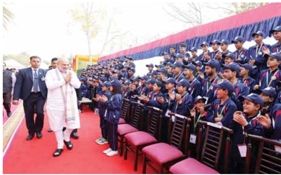
Home Minister Amit Shah interacts with 250 children from weaker sections of Jammu and Kashmir under 'Watan Ko Jano' programme in New Delhi

end, there is no need for the deployment of police and that day is not far, he added. "When there is peace, no police will be required. This message has to be carried by you to your friends, family and villagers... when you go home, tell your friends, neighbours that the entire country is living in peace and the people of Jammu and Kashmir should also live in peace," Shah said. There is peace in Jammu and Kashmir and this peace has to be permanent and "our aim is to make a Jammu and Kashmir where no life is lost due to terrorism", he added. "Violence brings nothing. Due to the decades of terrorism in Jammu and Kashmir, 36,000 people lost their lives," the home minister said. Shah said Prime Minister Narendra Modi had made the