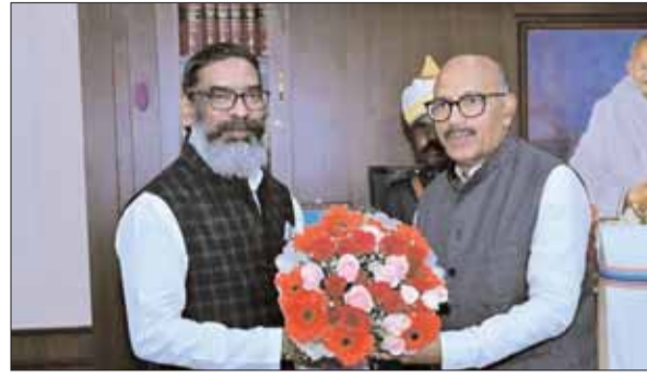
Chief Minister Hemant Soren greets the Speaker of the Legislative Assembly Rabinranath Mahato in the Speaker's room of the Legislative Assembly before the commencement of the second (budget) session of the sixth Jharkhand Legislative Assembly, in Ranchi on Monday.

During the speech, MLAs of the party in opposition, BJP, raised slogans against the government's achievements.