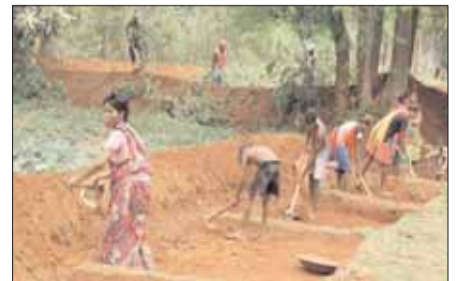
245 per day as wages under MNREGA. In which the Jharkhand government adds an additional Rs 27. Due to which the total wage is Rs 272.

Due to low wages in the state, a large number of workers migrate to other states. Currently, the central government pays Rs