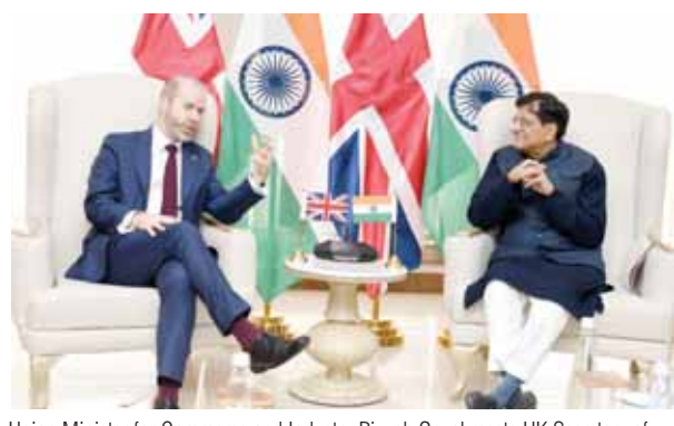
Union Minister for Commerce and Industry Piyush Goyal meets UK Secretary of State for Business and Trade Jonathan Reynolds in New Delhi.

India and the UK on Monday announced the resumption of negotiations for the proposed free trade agreement (FTA), which is expected to double or even triple bilateral trade from the current $20 Billion in the next 10 years. The announcement was made by Commerce and Industry Minister Piyush Goyal and UK Secretary of State for Business and Trade Jonathan Reynolds here. "Today, the Republic of India and the United Kingdom (UK) have resumed negotiations towards a trade deal between our two countries," a joint statement issued after the meeting said. Both sides have agreed to resume talks towards a balanced, mutually beneficial and a forward-looking deal that delivers mutual growth and builds on the strengths of the two complementary economies. The strengthening of the trading relationship has the potential to unlock