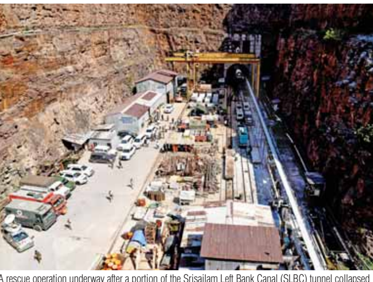
A rescue operation underway after a portion of the Srisailem Left Bank Canal (SLBC) tunnel collapsed in Nagarkurnool district

PIONEER NEWS SERVICE ■ HYDERABAD Even as multiple agencies are at war footing in Telangana reminding their efforts in 17days Silkyara Bend rescue operation in Uttarakhand, chances of survival of the eight persons who remain trapped in the SLBC tunnel seems to be "very remote". The latest to join are a team of rat miners, who had rescued the construction workers trapped in the Silkyara Bend-Barkot tunnel in Uttarakhand in 2023, to extricate the men. Indian Army, Navy, NDRF, SDRF and other agencies are also involved in rescue operations in close coordination with each other. Despite relentless efforts by the Indian Army, NDRF and other agencies, no breakthrough has been achieved so far in the rescue operations to extricate the eight persons who have remained trapped for over 48 hours inside the tunnel after a section of it collapsed in the Srisailem Left Bank Canal (SLBC) project in Telangana's Nagarkurnool district on Saturday. The persons who have been trapped in the collapsed tunnel for the past over 48 hours have been identified as Manoj Kumar and Sri Niwas from Uttar Pradesh, Sunny Singh (Jammu and Kashmir), Gurpreet Singh (Punjab) and Sandeep Sahu, Jegta