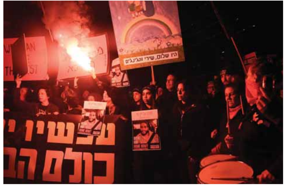
Demonstrators light a flare during a protest demanding the immediate release of hostages held by Hamas in the Gaza Strip, in Tel Aviv, Israel, on Saturday

Israel's defence minister said on Sunday troops would remain "for the coming year" in parts of the occupied West Bank where they have launched a weeklong offensive and would prevent tens of thousands of displaced Palestinians from returning, as Israel deepens its crackdown on the Palestinian territory. Israel launched a broad offensive on the northern West Bank on January 21 — two days after the ceasefire that paused the war in Gaza took hold — and then expanded it to include other nearby areas. Israel says it is determined to stamp out militancy amid a rise in attacks. Palestinians view such raids as part of an effort to cement Israeli control over the territory, where 3 million Palestinians live under military rule. The raids have been deadly, caused destruction to urban areas and displaced tens of thousands.