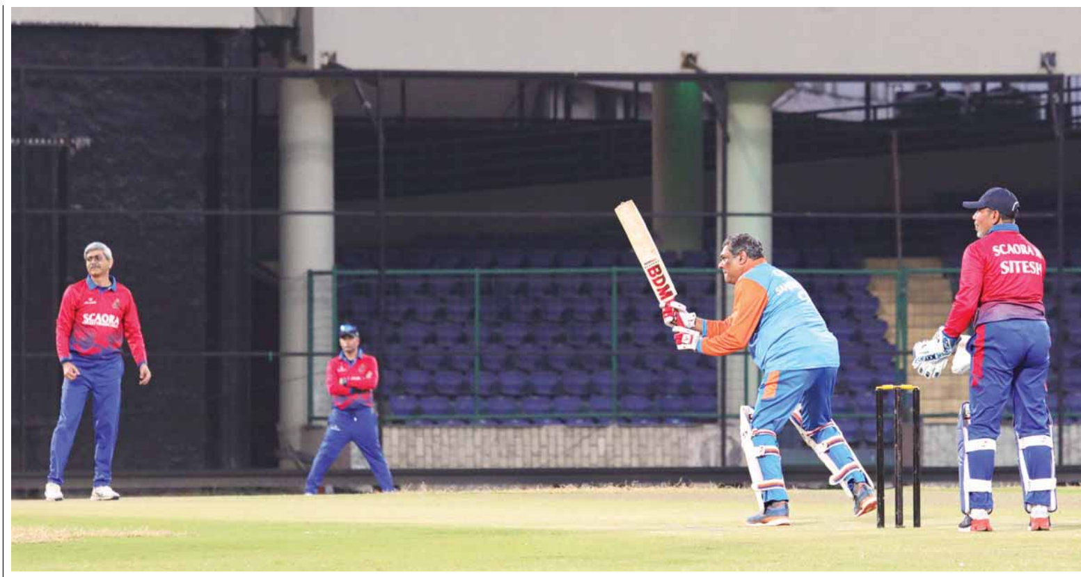
Chief Justice of India Justice Sanjiv Khanna plays a shot during a cricket match of the first SC Advocate On Records Association Vs CJI XI in New Delhi.