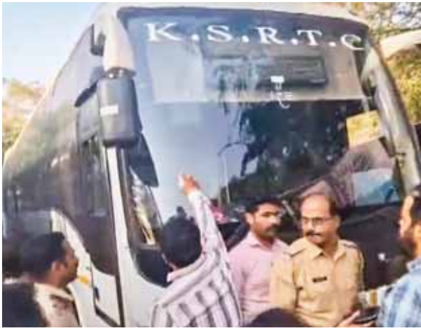
UBT workers stage protest by blackening buses bearing Karnataka number plates after Marathi bus drivers were allegedly assaulted in Karnataka's Belagavi.

Bus services between Karnataka and Maharashtra have been affected due to attack on bus drivers from both sides amid the sudden flare-up of border row in Belagavi in the last two days. The decades-old dispute resurfaced on Friday when a bus driver and a conductor were beaten up for allegedly not speaking in Marathi at Marihal in Belagavi. The bus conductor stated in his police complaint that a girl asked for a ticket in Marathi. When he said he did not know Marathi and asked her to speak in Kannada, she and her male friend attacked him. At Marihal, a group of youths intercepted the bus and beat up the conductor. While police arrested four people for the attack, the conductor has also been booked for 'indecent behaviour' with the minor girl on a