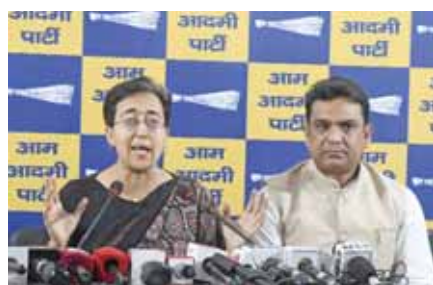
Senior AAP Leader and Former Delhi CM Atishi with MCD Mayor Mahesh Khinchi during a press conference at party headquarters

Gupta attended a meeting along with other BJP MLAs at the state party office ahead of the first session of the newly constituted 8th Delhi Assembly scheduled on Monday. Addressing her first press conference after the BJP legislature party meeting along with Delhi state president Virendra Sachdeva, the newly appointed chief minister said, "the most important thing is going to come. The government will put the 14 pending CAG reports on the House table in the first session."