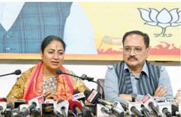
Delhi CM Rekha Gupta and Delhi BJP President Virendra Sachdeva address a press conference