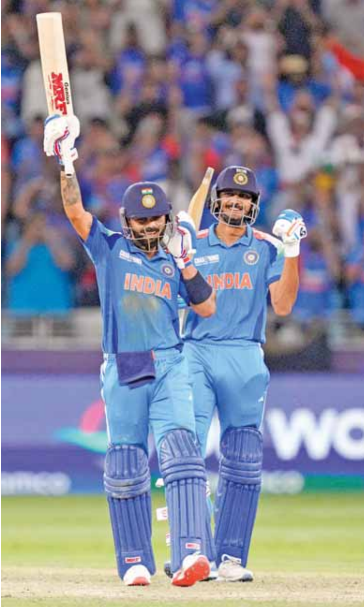
Virat Kohli celebrates his century with Axar Patel after scoring the winning runs during the ICC Champions Trophy between India and Pakistan, at Dubai International Cricket Stadium