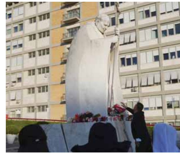
Nuns pray for Pope Francis in front of the Agostino Gemelli Polyclinic, in Rome, on Saturday

platelets, which are needed for clotting, the Vatican said in a late update. The Saturday statement also said that the pontiff "continues to be alert and spent the day in an armchair although in more discomfort than yesterday." Doctors said the prognosis was "reserved." Doctors have said Francis' condition is touch-and-go, given his age, fragility and pre-existing lung disease. His condition has revived speculation about what might happen if he becomes unconscious or otherwise incapacitated, and whether he might resign. Prayers for pope at Vatican: Francis was supposed to have celebrated Mass on Sunday morning in St. Peter's Basilica and ordained deacons as part of the Vatican's yearlong Holy Year commemoration. The organiser of the Holy Year, Archbishop Rino Fisichella, celebrated the Mass in his place and offered a special prayer for Francis from the altar before delivering the homily the pope had prepared. "Even though he is in a hospital bed, we feel Pope Francis close to us, we feel him present among us," Fisichella told the hundreds of white-robed dea-