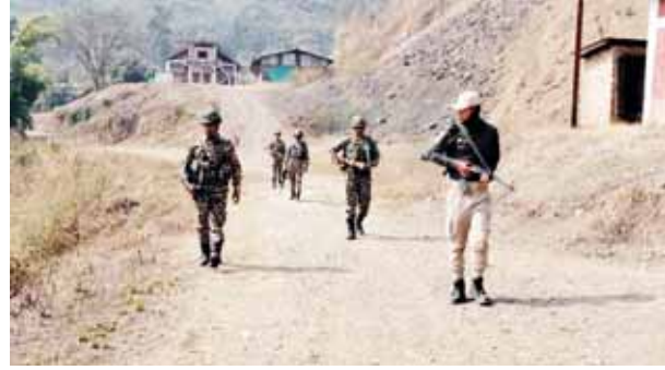
Security personnel during search operations and area domination in Manipur.