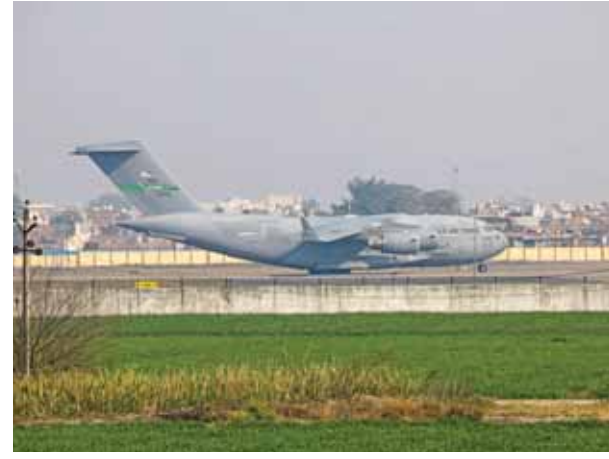
US military aircraft carrying Indian deportees upon its landing at the Shri Guru Ramdas Ji International Airport in Amritsar, on February 5