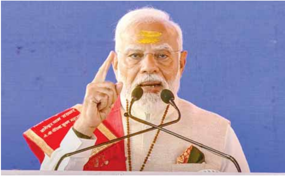
Prime Minister Narendra Modi addresses during the foundation stone laying of Bageshwar Dham Medical and Science Research Institute in Madhya Pradesh.

Prime Minister Narendra Modi on Sunday slammed the Opposition for allegedly mocking religious traditions and attempting to divide society and said they have a "slave mentality." His remarks came amid the ongoing criticism from several opposition leaders regarding the Maha Kumbh, currently taking place in Prayagraj. Addressing a gathering in Madhya Pradesh's Chhattarpur, the Prime Minister criticised politicians who, he claimed, ridicule faith and cultural practices, describing them as people with a "slave mentality" who undermine India's religious heritage. "Nowadays, we see that there is a group of leaders who mock religion, ridicule it, are engaged in dividing people and many times foreign powers also try to weaken the country and religion by supporting these people. People who have the Hindu faith have been living in some phase or the other for centuries," Modi said without taking any names. Furthermore, the Prime Minister also slammed those targeting temples, traditions and festivals, emphasising that