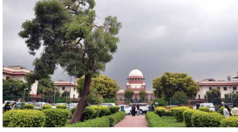
Supreme Court of India File photo