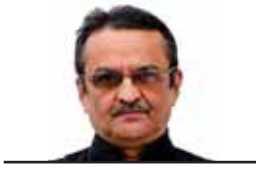
B K JHA

(The writer is a senior journalist; views are personal)