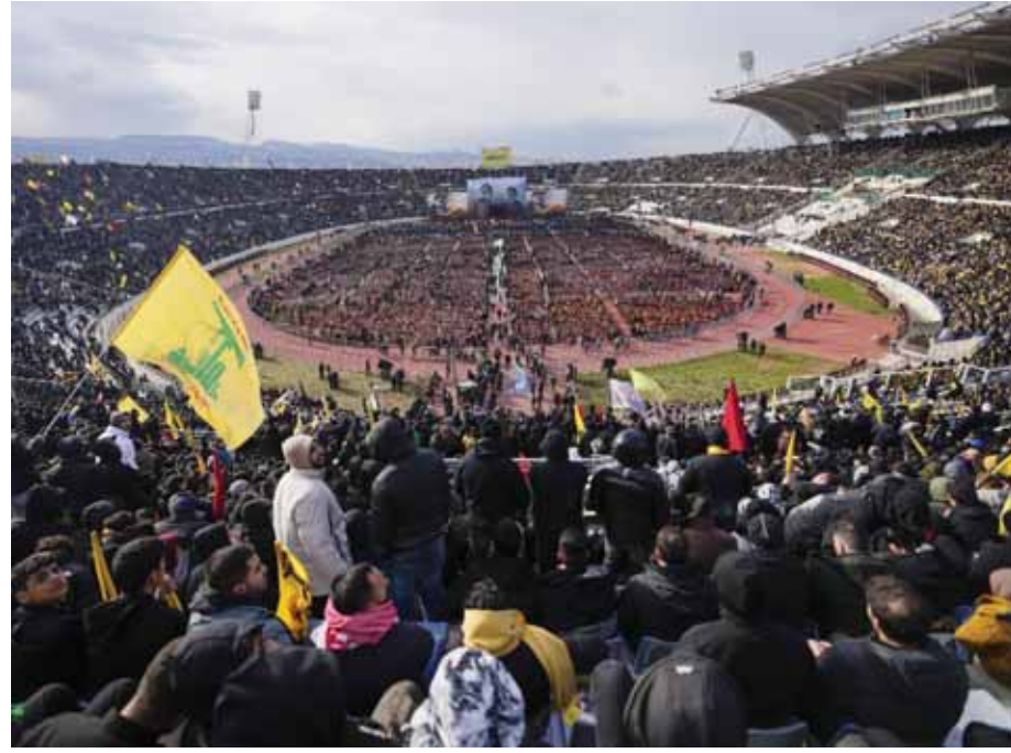
People gather for the funeral ceremony of the Lebanon's late Hezbollah leaders Hassan Nasrallah and Hashem Safieddine at the Sports City Stadium in Beirut, Lebanon, on Sunday