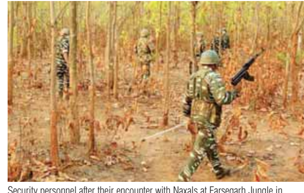
Security personnel after their encounter with Naxals at Farsagarh Jungle in Bijapur, Chhattisgarh

The CRPF has opened a new operations base in the heart of a strong Maoist corridor in Chhattisgarh's south Bastar region as part of its expanding footprint into core Left Wing Extremism-affected areas of the state. The forward operating base at 'Pujari Kanker' in the Bijapur district was established on February 13 by the 196th and 205th CoBRA battalion of the force along with assistance from various other units of the paramilitary force deployed in and around the area, officials said. The remote area where the forward operating base (FOB) has been established is surrounded by hills and houses training camps, weapons and ammunition dump and rations units of the Maoists from the south and west Bastar divisions, the officials said.