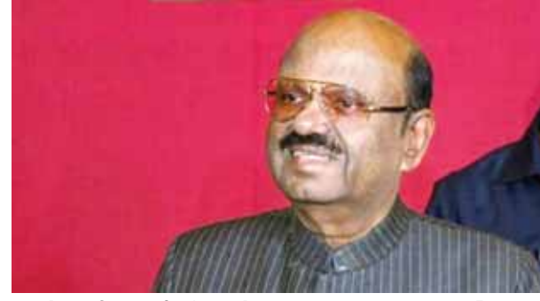
West Bengal Governor C V Ananda Bose

West Bengal Governor C V Ananda Bose on Sunday dismissed criticism over his speech in the assembly on the first day of the budget session, asserting that his address was a reflection of the state's government's policies and not a Raj Bhavan policy statement. Soon after Bose's address on February 10, Leader of Opposition in the assembly Suvendu Adhikari had said the speech was a revised version of what the state government had initially provided to him. "The governor's address is not the governor's policy statement, but that of the state government. As such the government's policy statement is to be delivered based on the advice of the council of