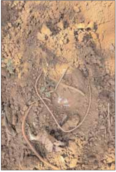
Singhbhum, including Goikera, Sonua, and adjacent regions, have been under strict surveillance as part of the ongoing anti-Naxal operations.

The coordinated efforts are aimed at dismantling Naxal networks, curbing their movements, and securing vulnerable zones.