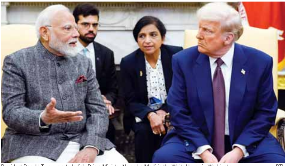
President Donald Trump meets India's Prime Minister Narendra Modi in the White House in Washington

India-United States (US) Transforming Relationship Utilising Strategic Technology (TRUST) will pave the way for economic and technological cooperation between the two countries, while focus on the IMEC framework will deepen collaboration in infrastructure and economic corridors, according to industry experts. Prime Minister Narendra Modi and US President Donald Trump have agreed on the TRUST initiative, to emphasise on creating strong supply chains of critical minerals, advanced materials, and pharmaceuticals.