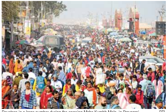
Devotees in a large number during the ongoing Maha Kumbh Mela, in Prayagraj

the chaos subsided, 18 people including 11 women and five children, had lost their lives. More than a dozen people were also injured in the stampede on Saturday night at the railway station which witnessed a surge of passengers waiting to board trains for Prayagraj - where the Maha Kumbh is underway - on platform number 14 and 15 of the station.