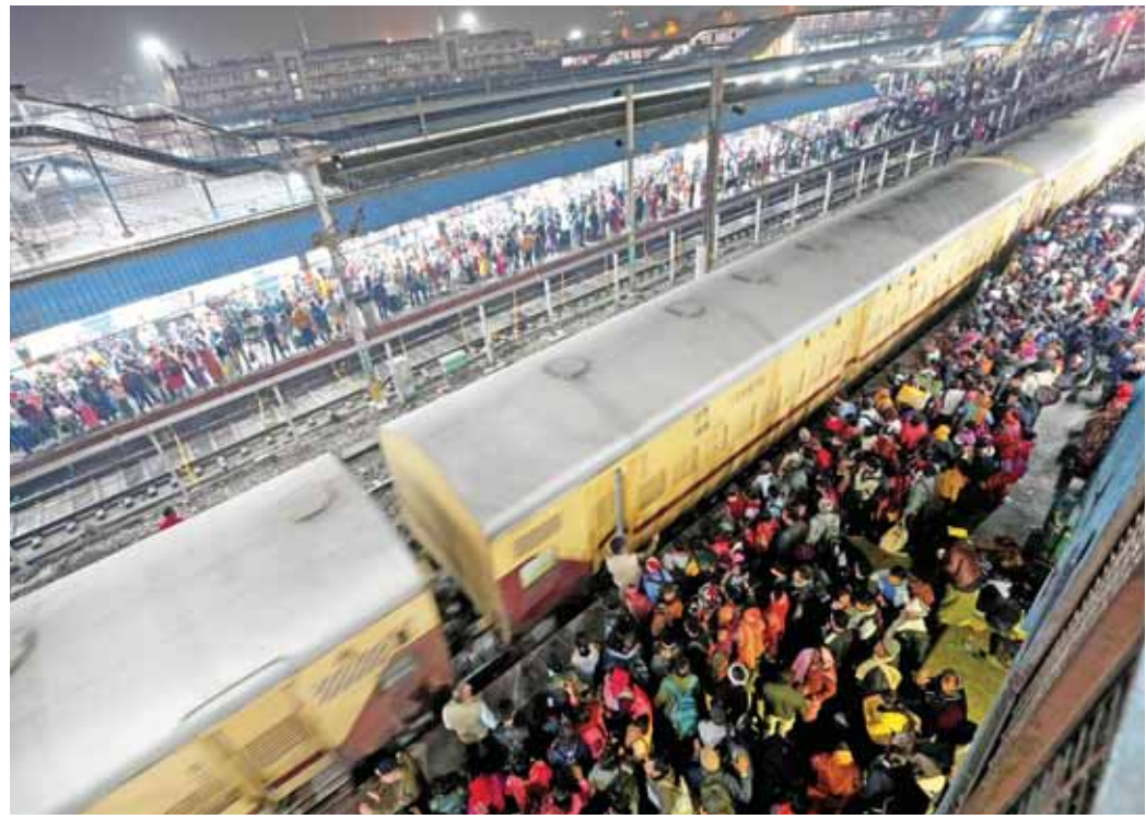
Heavy rush of passengers to catch a train for Mahakumbh, at the New Delhi railway station on Saturday, February 15. A stampede occurred at the station killing 18 and injuring many others

As the mega congregation at Maha Kumbh is on its last leg, yet another tragedy on Saturday night stuck the pilgrims at New Delhi Railway Station, where 18 people bound for the holy dip at Triveni Sangam lost their lives in a horrific manner. Amidst the religious fervour lasting almost two months, the loss of lives has touched almost 100 including 39 dead (official toll) during stampede at Maha Kumbh Nagar and about 40 lives fatality on the roads bound to Prayagraj. President Droupadi Murmu, Prime Minister Narendra Modi and Union ministers condoled the loss of lives in the stampede. "Deeply anguished to know about the loss of lives in a stampede at New Delhi railway station. I extend my heartfelt condolences to the bereaved families and pray for speedy recovery of those injured," President Murmu said in a social media post. The prime minister said he was distressed by the stampede at New Delhi Railway Station.