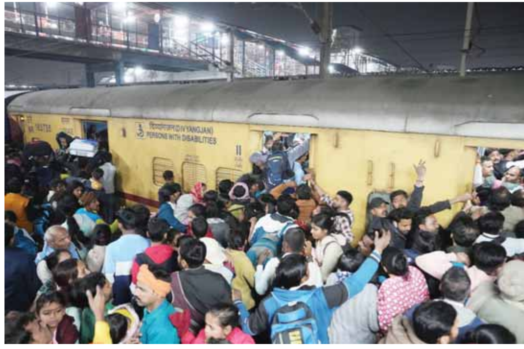
Heavy rush of passengers to catch a train for Mahakumbh, at the New Delhi railway station

Meanwhile, the Uttar Pradesh Congress slammed the government over the stampede incident, saying it raises serious questions on the role of the government. "It is very sad to hear about many people being killed and injured in a stampede at the New Delhi Railway Station due to the huge crowd of devotees going to the Maha Kumbh. We pray for the peace of the souls of the deceased and speedy recovery of the injured," the UP Congress said in a social media post. "Such incidents happening from Prayagraj to Delhi are raising serious questions on the role of the government and administration. Despite so many accidents, neither are their eyes opening, nor is accountability being fixed," it said. The Samajwadi Party too condole the loss of lives in the tragedy. In a social media post, the SP said, "Very sad! Heartbreaking news of people getting injured in the stampede at New Delhi Railway Station during the rush to catch a train going to Prayagraj." "May the souls of the deceased rest in peace. Wishing the injured a speedy recovery. Deep condolences to the bereaved families," it said. Assam Chief Minister Himanta Biswa Sarma on Sunday condole the loss of lives in the stampede at New Delhi railway station, and prayed for the speedy recovery of the injured. "I am extremely anguished by the terrible news coming in from New Delhi Railway Station. On behalf of the people of Assam, we offer our