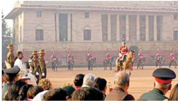
President Droupadi Murmu witnesses the inaugural show of the Change of Guard Ceremony in a new format at the Forecourt of Rashtrapati Bhavan, in New Delhi

The change of guard ceremony at Rashtrapati Bhavan will now be held in a new format, featuring an elaborate visual and musical performance against the backdrop of the presidential palace, an official statement said on Sunday. The new format includes military drills by troops and horses of the President's Bodyguard, along with personnel from the Ceremonial Guard Battalion and the Ceremonial Military Brass Band. The display will be spread over a larger area, the statement added. President Droupadi Murmu witnessed the inaugural ceremony in its new format on Sunday at the forecourt of Rashtrapati Bhavan, according to the statement issued by her office.