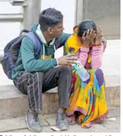
Relatives of victims wait outside the mortuary at the LNJP Hospital in New Delhi