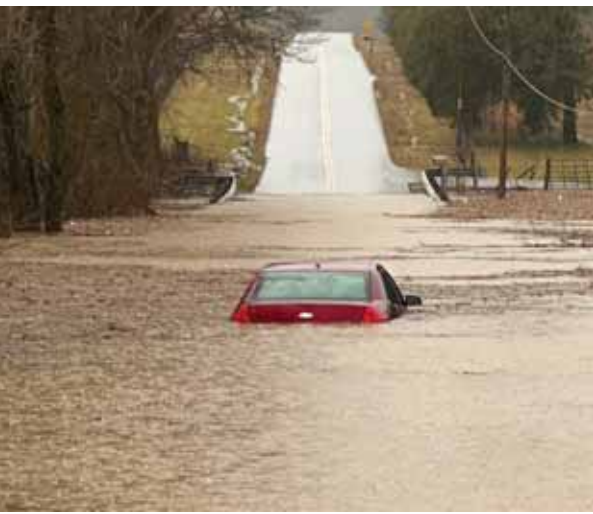
shows a partially submerged car outside of Bowling Green, Kentucky, on Saturday

Beshear said in a post late Saturday that he had written to the White House requesting an emergency disaster declaration and federal funds for impacted areas. The Kentucky River Medical Center in the city of Jackson said closed its emergency department and was transferring all patients to two other hospitals in the region. The hospital said it would re-evaluate conditions Sunday morning to determine when it can safely reopen. The north fork of the Kentucky River was forecast to crest nearly 14 feet (4.3 meters) above flood stage that afternoon, the weather service said. Photos posted by authorities and residents on social media showed cars and buildings underwater in south-central and eastern Kentucky. In Buchanan County, Virginia, the sheriff's office said multiple roads were blocked by mudslides. The Simpson County Office of Emergency Management in Kentucky said authorities performed several rescues from stalled-out vehicles in floodwaters. "Stay home if you can," the office said on Facebook. Flash flooding was possible in the Mississippi, Tennessee and Ohio valleys, the weather service said. In Tennessee, flash flood warnings were issued for much of the middle of the