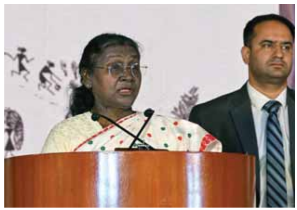
President Droupadi Murmu addresses during the inauguration of the National Tribal Festival 'Aadi Mahotsav', in New Delhi

Bangladesh", as well as USD 20 million for "fiscal federalism" in Nepal and USD 19 million for "biodiversity conversation" in the Himalayan nation. It also announced cutting a USD 10 million grant for "Mozambique voluntary medical male circumcision", USD 2.3 million for "strengthening independent voices in Cambodia", USD 32 million to the Prague Civil Society Centre, USD 40 million for "gender equality and women empowerment hub" and USD 14 million for "improving public procurement" in Serbia, among other expenditure cuts. It also included USD 47 million for "improving learning outcomes in Asia". The DOGE has been put in charge of overseeing workforce reduction across the government, and as part of that, Musk announced that he would shut down USAID, which is responsible for humanitarian efforts around the globe.