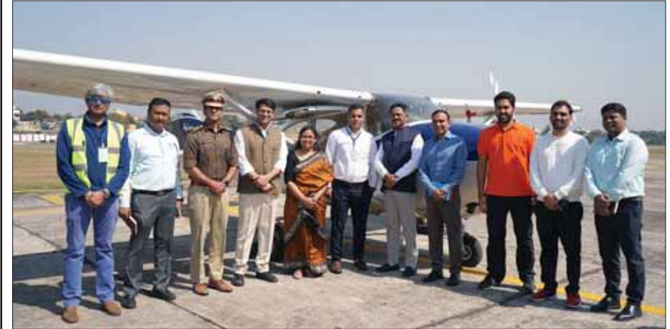
PNS : JAMSHEDPUR:

The much-awaited Skydiving Festival 2025 was inaugurated with great enthusiasm at Sonari Airport, under the aegis of Jharkhand Tourism. The event was flagged off by Sudiya Kumar, Minister of Art, Culture, Tourism, Sports, and Youth Affairs, marking a significant leap towards promoting adventure sports and tourism in the state.