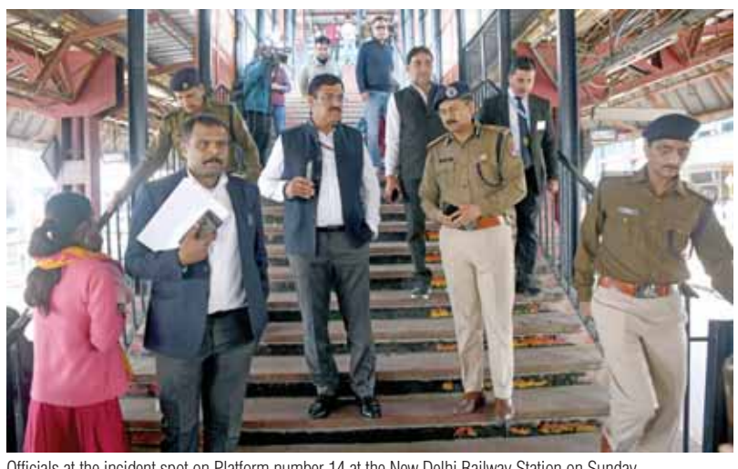
Officials at the incident spot on Platform number 14 at the New Delhi Railway Station on Sunday