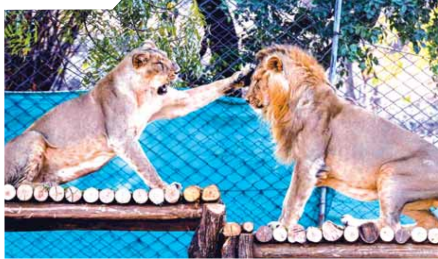
A pair of Asiatic lions inside their enclosure at Van Vihar National Park in Bhopal