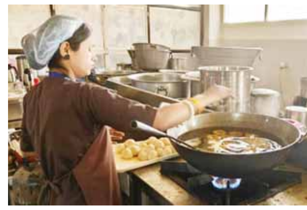
A member of the Didi Ki Rasoi self help group takes care of the canteen at the Patna Medical College and Hospital in Patna