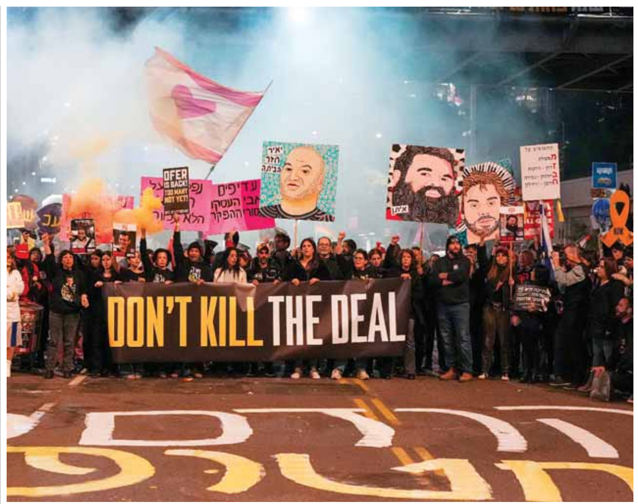
Protesters demanding the immediate release of hostages held by Hamas in the Gaza Strip, in Tel Aviv, Israel, on Saturday