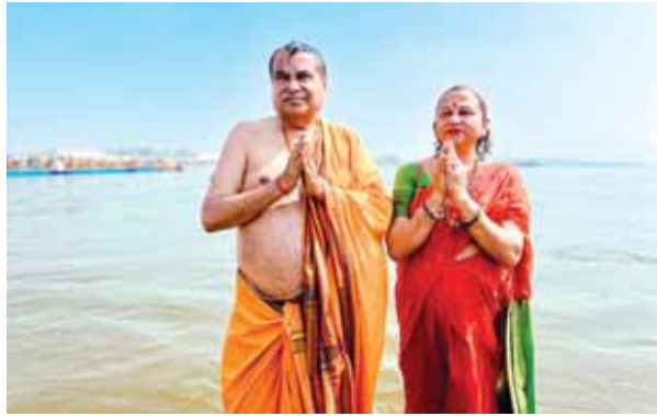
Union minister Nitin Gadkari takes a holy dip at Sangam

The spiritual grandeur of Mahakumbh 2025 in Teerthraj Prayagraj continues to draw dignitaries from across the nation, with many considering it a divine blessing to bathe in the sacred waters of the Triveni Sangam. On Sunday, Union Minister for Road Transport and Highways, Nitin Gadkari, joined the revered tradition, expressing his deep sense of fulfillment after taking a ritual dip alongside his wife and family. Upon his arrival at Prayagraj Airport, Uttar Pradesh Chief Minister Yogi Adityanath extended a warm welcome, presenting him with a shawl as a mark of respect. Gadkari then proceeded to the Sangam, where he performed the holy bath and offered prayers. His joy was evident, as he described the experience as spiritually uplifting. Impressed by the