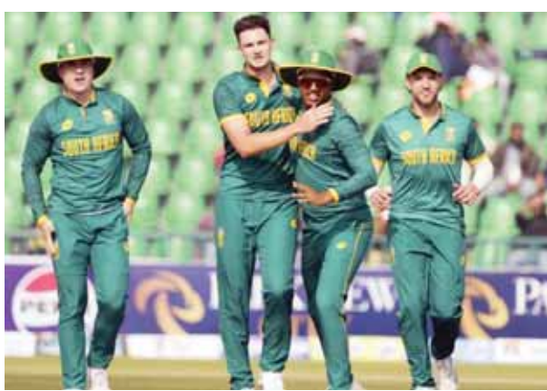
to do what you got to do. Right in the beginning, everyone knew who they were playing and who they were not playing. "South Africa has won 7 test matches in a row to qualify. Everyone should look into the Test ecosystem, how it works as you play what you have been told to play in that cycle." On the ongoing "country vs club" debate, Smith acknowledged the rise of T20

that by the time we host the 2027 WC, we are the favourites." South Africa finished as runners-up at both the men's and women's T20 World Cups in 2024. Earlier this year, they were also defeated by India in the ICC Women's Under-19 World Cup final. However, the Proteas have a chance to lift spirits in the country as they prepare to face Australia in the WTC final this June. This will be their first appearance in the summit clash, having secured their spot after a crucial win over Pakistan in the Boxing Day Test in Centurion. Many believe South Africa had an easier run to the finals, having beaten teams such as India, West Indies, Bangladesh, Sri Lanka and Pakistan. However, Smith, who boasts 9,265 runs in 117 Tests and 6,986 runs in 197 ODIs, dismissed the claims. "There is no smooth journey in cricket today. You have got