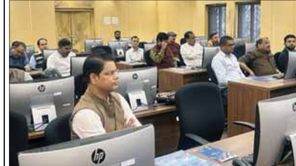
PNS : RANCHI