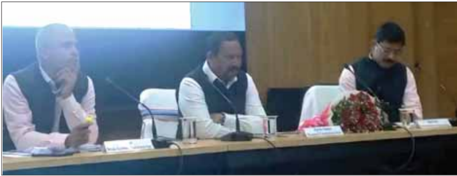
Land Reforms Department Minister Deepak Birua along with senior officials during a meeting at Project building in Ranchi on Tuesday.

PNS : RANCHI Revenue and Land Reforms Minister Deepak Birua today said that if the applications of the peasants are rejected unnecessarily citing technical reasons in the zones, action will now be taken against the identified CO. Also, it is mandatory for the CO to give clear reasons in 50 words for the rejection of the applications or objec-