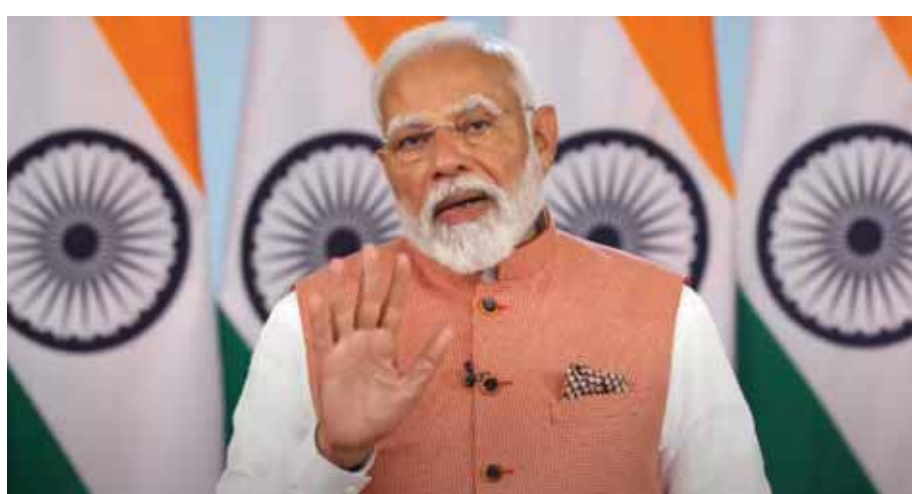
Prime Minister Narendra Modi delivers his remarks via video conferencing during inauguration of India Energy Week

important part of India's energy ambitions," Modi told investors. He further said, "All experts are saying that 21st century is India's century. Bharat is not only driving it its own growth but driving global growth." India's energy ambitions, he said, are based on five pillars. "We have resources, which we are harnessing. We are encouraging our brilliant minds to innovate. Thirdly, we have economic strength and political stability," he said. Also, he said, India has strategic geography, which makes energy trade easier and more attractive. Besides, India is committed towards global sustainability and this is aiding new possibilities in the country's energy sector, the prime minister said. For Viksit Bharat, the next two decades are very crucial, he said, adding that in the next five years we will cross many