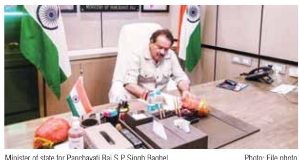
Minister of state for Panchayati Raj S P Singh Baghel

Minister of State for Panchayati Raj S P Singh Baghel will release the comprehensive Devolution Index Report on panchayats in the country on Thursday. It will provide insights into the progress of decentralisation across states and Union Territories, the ministry said on Tuesday. The Panchayati Raj Ministry in a statement issued here said the report titled "Status of Devolution to Panchayats in States - An Indicative Evidence Based Ranking 2024", will be released by the Minister on February 13. The ministry said it marks a milestone in India's journey towards empowering Panchayati Raj Institutions (PRIs) and realizing the vision of "Local Self Government" of the 73rd