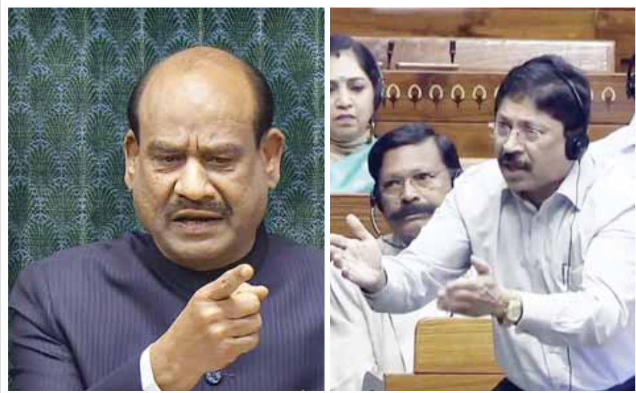
Lok Sabha Speaker Om Birla and DMK MP Dayanidhi Maran during the Budget session of Parliament, in New Delhi