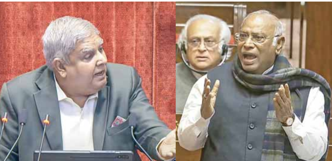
Leader of Opposition Mallikarjun Kharge speaks in the Rajya Sabha as Chairman Jagdeep Dhankhar looks on during Budget session of Parliament, in New Delhi, Tuesday

categorical, the Constitution signed by the founding fathers of the Constitution, carrying 22 miniatures, is the only authentic one and it can include amendments by the Parliament. If there is any change effected by judiciary or any institution, it is not acceptable to this House. "I will appeal to the Leader of the House to ensure that in the country only the authentic version of the Indian Constitution be promulgated. Any violation of this should be taken quite seriously by the government and severe action taken," the Chairman said in the House. Kharge was first given the floor to speak on the issue, who alleged that the BJP was unnecessarily raising the issue to create a controversy. "They are unnecessarily raising the issue and want to create a controversy on Ambedkar's Constitution. They never raised this issue when Ambedkar, Patel, others were alive...Now they are bringing new