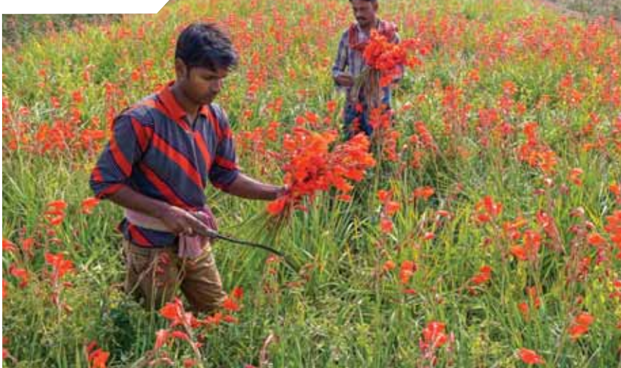
Farmers pluck Gladiolus flowers at an orchard, in Nadia