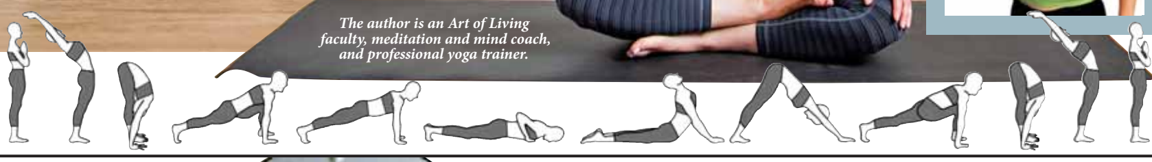
The author is an Art of Living faculty, meditation and mind coach, and professional yoga trainer.