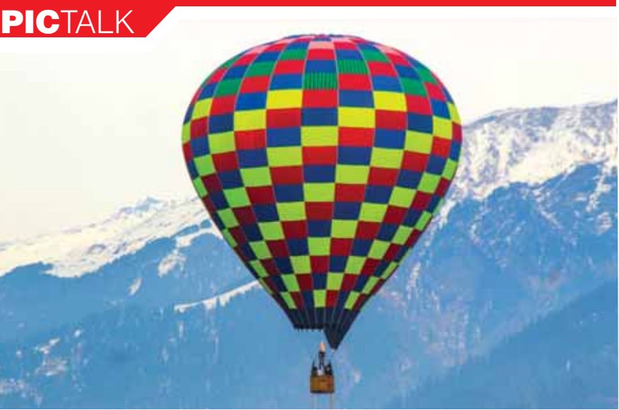
Tourists take a ride on a hot air balloon, in Manali