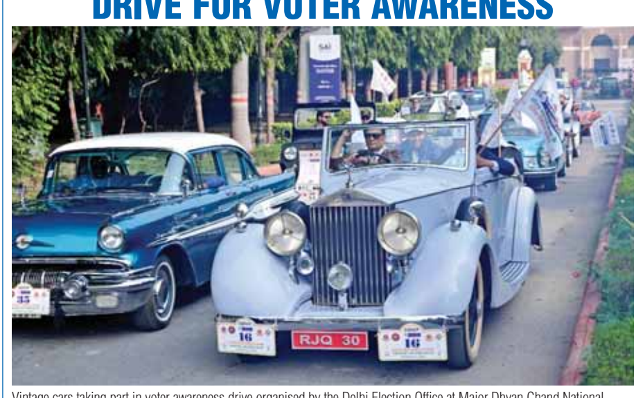
Vintage cars taking part in voter awareness drive organised by the Delhi Election Office at Major Dhyan Chand National

- are closed for the The portals reopen in April-May the following year. During the six-month-long pilgrimage Lakhs of devotees from across the country and abroad visit the Char Dhams.