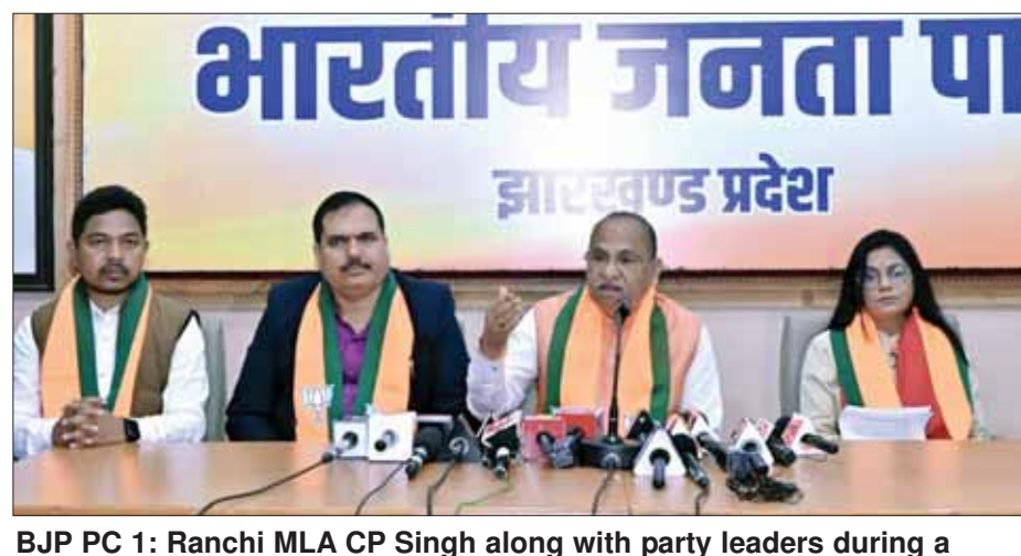
press conference at the party office in Ranchi on Sunday.

districts will collect Atal Ji's memories related to their districts at the district level.