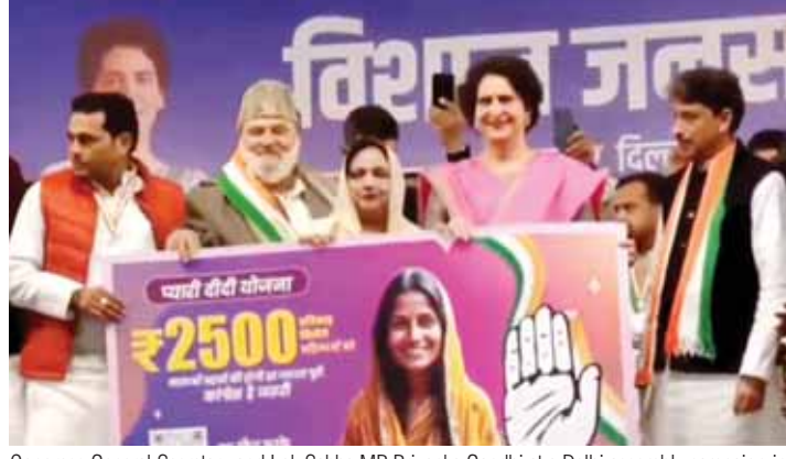
Congress General Secretary and Lok Sabha MP Priyanka Gandhi at a Delhi assembly campaign in national Capital on Sunday. Delhi goes to polls on Wednesday

routed completely. Members of Opposition parties under the INDIA bloc has claim that about 63 election petitions have been filed across various benches of the Bombay High Court