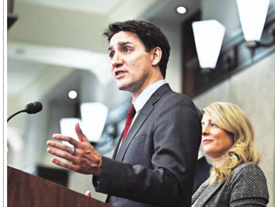
Canada's Prime Minister Justin Trudeau addresses media following the imposition of a raft of tariffs by US President Donald Trump against Canada, Mexico and China, in Ottawa on Saturday.

'You're worried about grocery prices. Don's raising prices with his tariffs," Senate Democratic Leader Chuck Schumer of New York posted on X. "You're worried about tomato prices. Wait till Trump's Mexico tariffs raise your tomato prices. ... You're worried about car prices. Wait till Trump's Canada tariffs raise your car prices," he wrote in a series of posts.