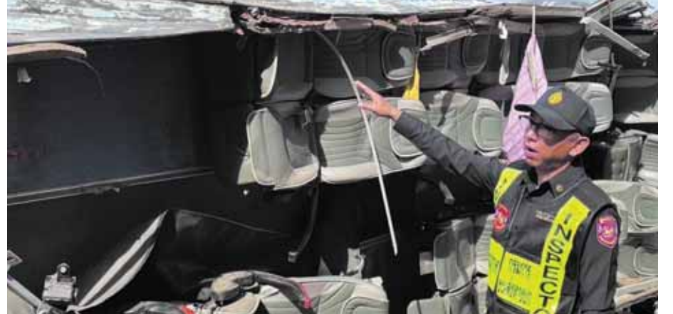
An investigator inspects the accident site where a bus travelling from northern Thailand overturned in eastern Prachinbur province, killing multiple people on Wednesday.