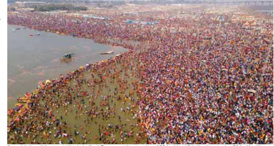
An aerial view of devotees taking holy dip at Sangam on the occasion of 'Mahashivratri' during the ongoing 'Maha Kumbh Mela in Prayagraj in Uttar Pradesh on Wednesday

Minister Mamata Banerjee slamming the Yogi Adityanathled government to say it was an