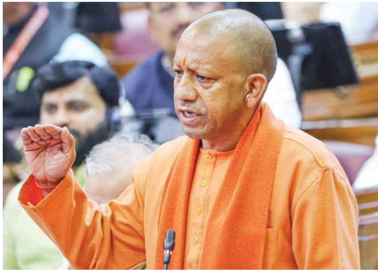
Uttar Pradesh Chief Minister Yogi Adityanath speaks during the Budget session of the state Legislative Assembly, in Lucknow

during the festival had resulted in thousands of deaths. "If following Sanatan traditions is a crime, then I will commit this crime a thousand times," Yogi asserted. Taking a dig at SP, he said, "A sick person can be treated, but not a sick mentality." He further mocked SP chief Akhilesh Yadav, claiming that despite his party's criticism, he secretly took a dip in the holy waters. Opposition demands halt to power privatisation, Government stresses reforms The opposition also raised concerns over privatisation of electricity, warning that it would increase tariffs and adversely impact consumers. They argued that the state electricity board has more experience than private firms, and called for an immediate rollback of privatization plans. Energy Minister A.K. Sharma defended the move, stating that privatisation is necessary for improving the power sector. "When BJP came to power in 2017, UP's electricity board was running a deficit of ₹1.42 Lakh Crore. Despite reforms, issues persist, and further improvements are needed," he explained. He