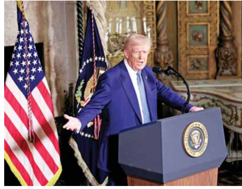
President Donald Trump speaks at Mar-a-Lago in Palm Beach, Fla.

■ WASHINGTON US President Donald Trump has said that he made it clear to Prime Minister Narendra Modi that India will not be spared from Washington's reciprocal tariffs, emphasising that "nobody can argue with me" on tariff structure. Trump made these remarks during an interview with Fox News' Sean Hannity recently. Fox News aired a joint television interview with President Trump and billionaire Elon Musk on Tuesday night. On February 13, hours before Prime Minister Modi's bilateral meeting with Trump in the White House, the US President announced reciprocal tariffs. Under the plan, the Trump administration "will work strenuously to counter non-reciprocal trading arrangements with trading partners by determining the equivalent of a reciprocal tariff with respect to each foreign trading partner." During the interview with Hannity