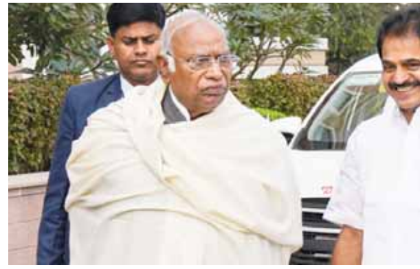
Congress President Mallikarjun Kharge in the Lok Sabha arrives for a meeting of party's general secretaries and state in-charges, in New Delhi

Days after a major organisational rejig in the party, Congress President Mallikarjun Kharge on Wednesday stressed that the top workers will be held accountable for future election results in States under their charge and asking them to be wary of ideologically weak turncoats. Addressing general secretaries and in-charges, including those appointed last week, at a meeting held at the party's new headquarters at Indira Bhawan, Kharge emphasised the importance of promoting those people who are committed to the ideology of the Congress and stand with us like a rock even in adverse circumstances. Kharge also hinted at some more changes in the organisation, saying some changes have already taken place and some more are in the offing. "I want to talk to you about the most important thing of accountability. You all will be held accountable for revamping the organisations in states and for all future election results," he told the office-bearers. The party recently brought in new office bearers in the revamped organisation. Among those who attended the meeting