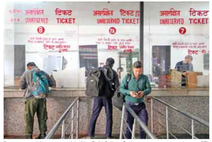
Passengers at ticket counters of the New Delhi Railway Station.