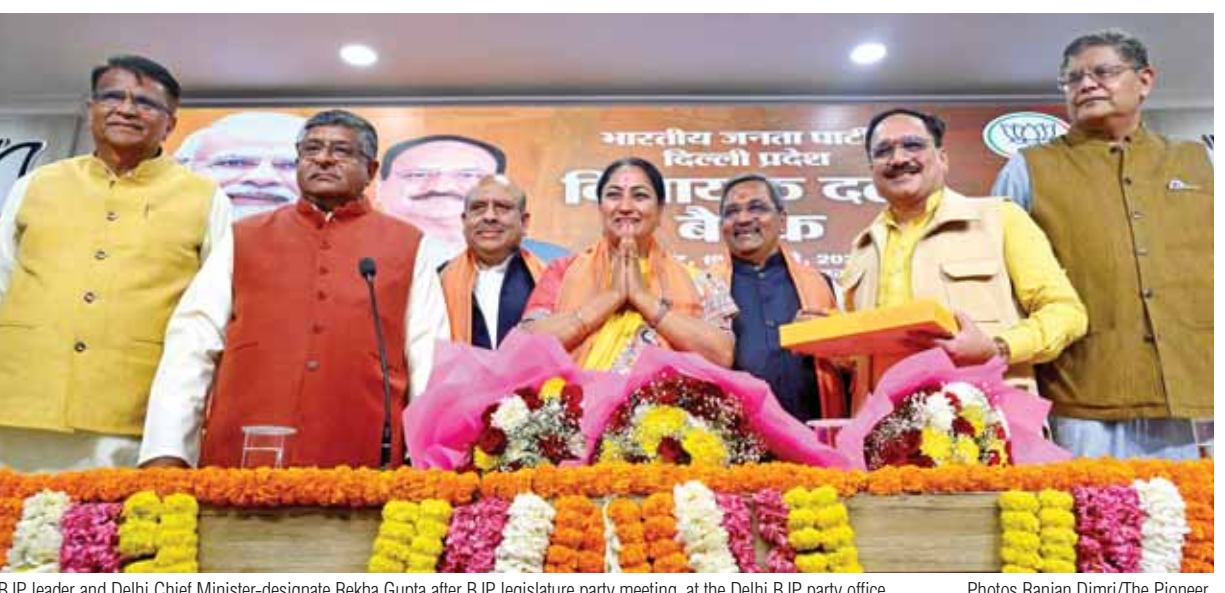
BJP leader and Delhi Chief Minister-designate Rekha Gupta after BJP legislature party meeting, at the Delhi BJP party office.

PUBLISHED FROM: DELHI | LUCKNOW | BHOPAL | BHUBANESWAR | RANCHI | RAIPUR | CHANDIGARH | DEHRADUN | HYDERABAD | VIJAYWADA