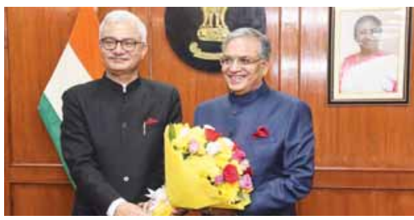
New Chief Election Commissioner Gyanesh Kumar is greeted by Election Commissioner Vivek Joshi

Gyanesh Kumar on Wednesday took over as the 26th Chief Election Commissioner (CEC) while Vivek Joshi assumed charge as an Election Commissioner. An Election Commissioner since March 2024, Kumar was elevated as the CEC on Monday. Gyanesh Kumar replaced Rajiv Kumar, who demitted office on Tuesday, as head of the poll panel. Sukhbir Singh Sandhu is the other election commissioner. Joshi, a former Haryana cadre IAS officer, was appointed as an Election Commissioner on Monday. In his message to voters after assuming charge, Kumar said,