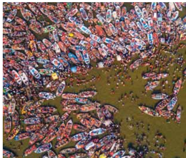
An aerial view of devotees on boats at the Sangam during the ongoing Maha Kumbh Mela, in Prayagraj