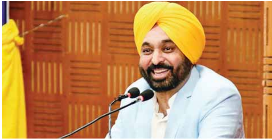
Punjab Chief Minister Bhagwant Mann

With Punjab Chief Minister Bhagwant Mann taking exception to US flights carrying Indian deportees landing in Amritsar, government sources Wednesday defended the move, saying the state makes up for the biggest share of these illegal immigrants. Sharing figures of the three flights that have arrived in India since February five, they said Punjab residents total 126 of the 333 people deported in US military aircraft, followed by 110 from neighbouring Haryana and 74 from Gujarat. Eight of them were from Uttar Pradesh, five from Maharashtra, two each from Himachal Pradesh, Chandigarh, Rajasthan and Goa, and one each from Jammu and Kashmir, and Uttarakhand. Each of the three flights on February 5, 15 and 16 carried over 100 Indians and 333 of them have been deported so far, they added. The total includes 262 men, 42 women and 29 minors, the sources added. As many as 23 flights carrying Indian deportees have arrived in the country since May 2020 and all of them landed in Amritsar, they said. Since Donald Trump's inauguration as US President, whose