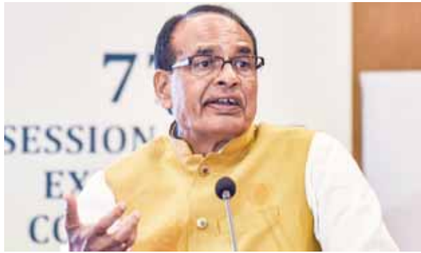
Shivraj Singh Chouhan addresses inaugural Session of 77th Session of Executive Committee of African Asian Rural Development, in New Delhi

India is committed to rural transformation in member nations of the African-Asian Rural Development Organisation (AARDO) and will increase its technical contribution to the forum, Rural Development Minister Shivraj Singh Chouhan said here on Wednesday. He was speaking at the inauguration of the 77th session of the executive committee of the African-Asian Rural Development Organisation (AARDO). "India gives the highest yearly membership contribution to AARDO, which is around USD 1,55,300, and the Indian government has been providing organisation, technical, and financial support to AARDO from time to time," he said. "India will keep playing its role in rural transformation in