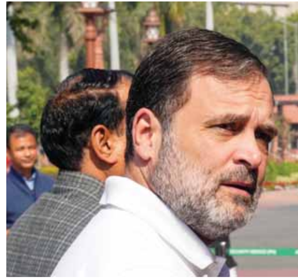
Rahul Gandhi in the Lok Sabha arrives for a meeting of party's general secretaries and state in-charges, in New Delhi