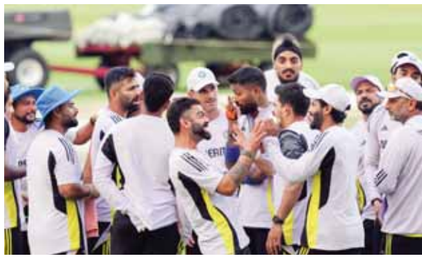
Virat Kohli, Ravindra Jadeja, Hardik Pandya and others during a practice session ahead of the ICC Champions Trophy match between India and Bangladesh

because ODI is the comfort zone of those icons and young tyros in this Indian line-up, and they will be genuinely eyeing a strong outing here. It's imperative that they do so -- from a team and individual perspective. It would not be an exaggeration to say that Kohli, Rohit and even head coach Gautam Gambhir, although only six months into his tenure, are living on borrowed time because the shockwaves created by the setbacks against New Zealand and Australia have not subsided yet. Some bright signs are there though. Skipper Rohit made a century a few days back against England and Kohli a fifty, while Gambhir masterminded the dominant 4-1 and 3-0 victories in T20s and ODIs respectively. Gill was exceptional while emerging as the player of the series, cracking two fifties and a hundred in three ODIs against England. But the challenge India face in the Champions Trophy is vastly different from a rather cosy home series. Bangladesh, Pakistan and New Zealand, their opponents in Group A, are far more motivated than the seemingly disinterested England whom they faced recently, and even one defeat can change the whole league stage equation quite dramatically.