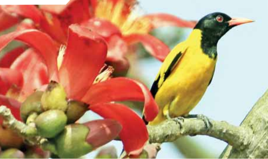
A black-naped oriole bird perches on a bloomed cotton tree, in Birbhum