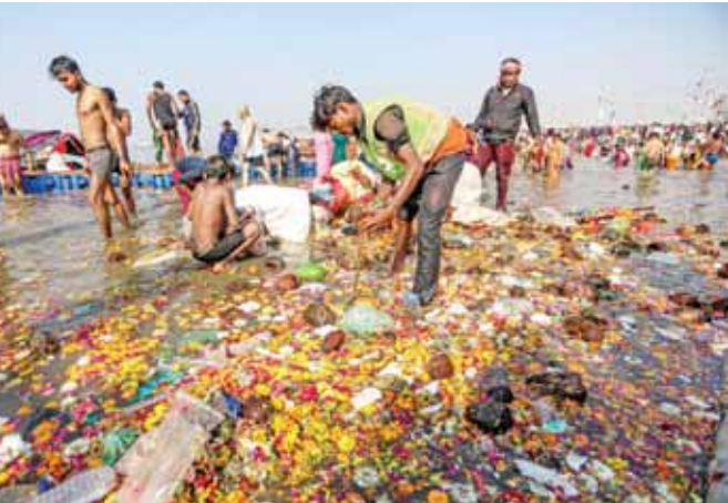
Puja material and other waste being collected at the Sangam for their disposal, during the ongoing Maha Kumbh Mela 2025, in Prayagraj.

BISWAJEET BANERJEE/PNS ■ LUCKNOW/NEW DELHI Amid claims by Central Government pollution body that the present condition of Ganga water in ensuing Maha Kumbh may contain high levels of faecal bacteria, Uttar Pradesh Chief Minister Yogi Adityanath on Wednesday countered by assuring the Sangam water in Prayagraj is safe for bathing and other rituals. A sort of controversy erupted over the claims by Central government pollution body which reported the Ganga water at Triveni Sangam, where lakhs of people are taking a holy dip every day during the ongoing Maha Kumbh, is currently unsafe for bathing. Central Pollution Control Board (CPCB) data informed the National Green Tribunal that Sangam water at Maha Kumbh exceeds the prescribed limit for biological oxygen demand (BOD), a key parameter to determine water quality. BOD refers to the amount of oxygen required by aerobic microorganisms to break down organic material in a water body. A higher BOD level indicates more organic content in the water. River water is considered fit for bathing if the BOD level is less than 3 milligrams per litre. In a report submitted to the NGT the CPCB said the river water quality did not meet bathing standards during monitoring on January 12-13 at most locations in Prayagraj. According to Uttar Pradesh government officials, 10,000 to 11,000 cuces of water is being released into the Ganga to