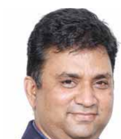
BINOD ANAND ■ NEW DELHI

As India embraces sustainability and innovation, a cooperative economic framework becomes essential to address G-local challenges through responsible Business. This ensures shared growth by fostering collaboration between multinational corporations, small and medium enterprises (SMEs), and government bodies.