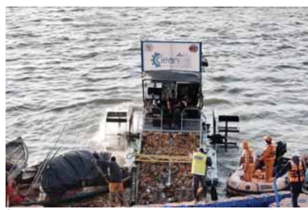
Cleanliness drive at Mahakumbh mela in Prayagraj

With over 55 Crore devotees already taken a dip during two months long congregation of extraordinary proportions at Mahakumbh, the Uttar Pradesh government has taken care of all efforts to ensure the cleanliness of the Sangam in Mahakumbh Nagar. Each day, an average of 10-15 Tonnes of floating waste is collected from the river and sent for recycling, demonstrating a strong commitment to maintaining environmental sustainability during this sacred event. But since this poses a complex array of logistical challenges, especially in managing the immense waste generated by such a gathering, deployment of trash skimmers at Prayagraj by the Urban Development Department as part of Swachh Bharat Mission is being executed by Cleantec Infra, and