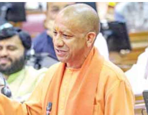
Uttar Pradesh Chief Minister Yogi Adityanath speaks during the Budget session of the state Legislative Assembly, in Lucknow.

exceeding Rs 3 Lakh Crore. Sales are reported to have increased due to meticulous branding. It also proves that India's sanatana economy has deep-rooted strength, playing a significant role in the country's overall economic framework," Khandelwal added. This has provided a significant boost to Uttar Pradesh's economy and created new business opportunities. Before the commencement of the Maha Kumbh, initial estimates was projected the arrival of 40 Crore people and business transactions worth around Rs 2 Lakh Crore. According to the Uttar Pradesh government, over 53 Crore