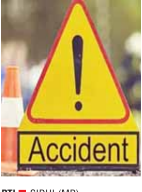
PTI ■ SIDHI (MP)

Four persons were killed, and as many others sustained injuries after an SUV heading for the Maha Kumbh in Prayagraj overturned in Madhya