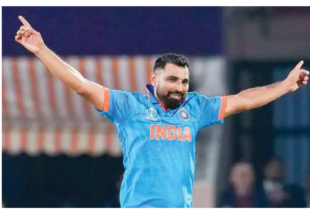
But can he find his optimal and ideal running speed, because Shami's effectiveness totally depends on his rhythm. Balaji thought it was not a task beyond Shami. "Since that (ankle) injury has happened, there was a little bit of slowness, maybe. It's natural. But there is nothing you can do about it. It's part of any sportsperson's career. "He has the experience to get over it and he will do it as he bowls more. It's just about accepting the (physical) condition and continuing his best practices," he said.

is all set to partner Arshdeep Singh. But for all his skills and promise, Arshdeep is not yet at Bumrah's level. So, can Shami drag the train forward all by himself? Former India pacer Laxmipathy Balaji found no reason to believe otherwise. "Actually, he had out-bowled Bumrah in the 2019 (50-over World Cup) and in the last World Cup (2023). Bumrah is the champion bowler across formats. But Shami has experience and, before Bumrah's arrival, it was Shami who carried India's attack all through," Balaji, now a reputed pace bowling coach, said. Bumrah's unavailability makes it imperative for Shami to strike upfront consistently. Balaji underlined that factor. "I think it's very important. If India has to do well, then Shami has to come good with the new ball. The kind of impact he can make in his first six overs with the new ball, it will play a crucial role for India. "Old ball is anyway... It is a defensive game now. If he can make early inroads regularly that will give a huge booster to India," he added.