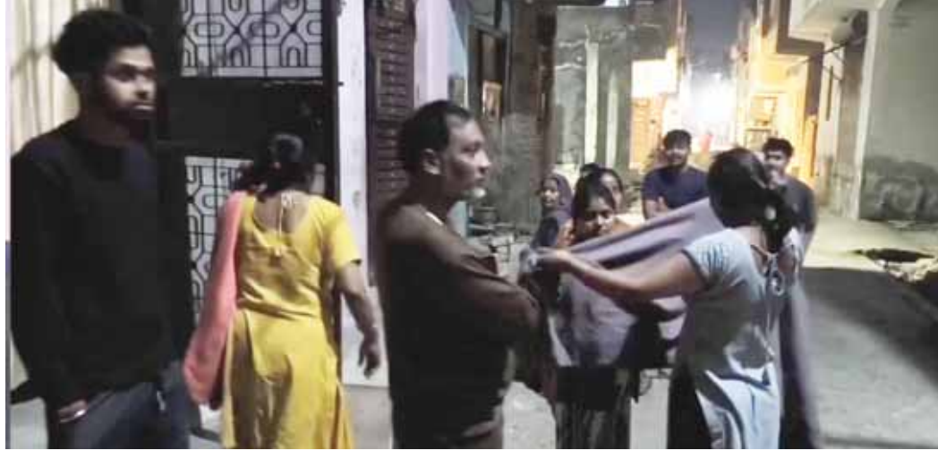
Residents rush out of their houses as earthquake tremors hit Delhi-NCR, in New Delhi