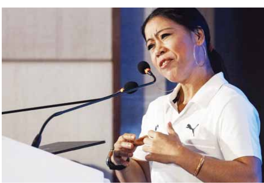
opposition of her father early on and physical challenge of continuing a high-risk contact sport after embracing motherhood. "Boxing is not a women's game. I took up that challenge because I wanted to prove to myself and to all the women in the country that we can do it, and I went on to become a world

from waist down after suffering a car accident as a child. In a shift from the traditional town hall format, this time the Prime Minister opted for a more informal setting, taking the students to Delhi's picturesque Sunder Nursery for his annual interaction ahead of board exams. He also brought on board eminent personalities from different walks of life to answer questions from students in an episodic format starting with himself on February 10. Mary Kom, a six-time world champion and a London Olympics bronze-medallist, spoke about the challenges she faced while pursuing boxing, underlining the importance of resilience. The 42-year-old struggled to keep her composure while recalling the many challenges she overcame to become a boxing great, which included