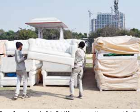
Preparations underway for Delhi Chief Minister's oath-taking ceremony at Ramlila Maidan

"The layout of the tents, including a VIP block for dignitaries, is being finalised. Around one lakh people are expected to be inside and outside the venue to celebrate the BJP's victory in Delhi after 26 years," a source said. Whenever the Prime Minister Narendra Modi's meeting, and that of the legislative party, are held, and whomever is chosen, what is certain is the BJP is planning on a mega swearing-in ceremony for its new Delhi government at Ramlila Maidan. To manage the preparations for the ceremony, BJP General Secretaries Vinod Tawde and Tarun Chugh have been designated as the in-charge officials. The ceremony is anticipated to be a grand occasion, with an expected audience of between 12,000 and 16,000 residents from Delhi, alongside diplomats from multiple nations and various religious figures. Delhi BJP president Virendra