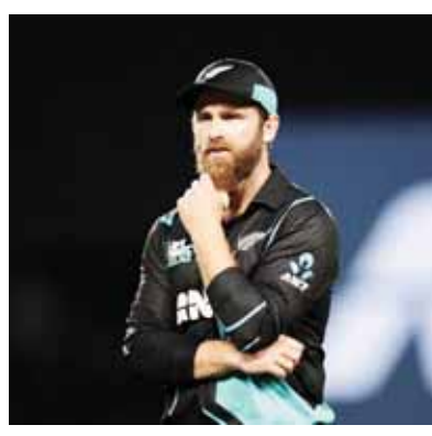
one of my favourite grounds in the world for so many different reasons - is something I'm especially looking forward to also. "There's a good balance of youth and experience in the Middlesex squad, which is great, and I'm really excited to join up with the team, meet the players in the squad and helping out wherever I can." Williamson, who will make Lord's his home in 2025 from May through to the end of September, has become one of the

PTI ■ LONDON F ormer New Zealand captain Kane Williamson has signed a two-year contract with Middlesex Cricket to play in the T20 Blast and County Championship, while also captaining London Spirit in this year's edition of The Hundred. Regarded as one of the greatest modern-day batters, Williamson, who previously played for Gloucestershire (2011-2012) and Yorkshire (2013-2018), will be available for at least 10 of Middlesex's 14 T20 Blast group fixtures and a minimum of five County Championship matches in the second half of the season. "I've played a bit of county cricket in the past, but not for a number of years now, so when this opportunity arose with Middlesex it was a really exciting prospect," Williamson, the all-time leading Test run-scorer for New Zealand, said in a release. "To be able to play for Middlesex - a fine club with a rich heritage - is really exciting and something that I'm really looking forward to being a part of. To play at Lord's, the Home of Cricket - which is