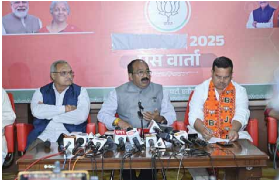
Chhattisgarh Deputy Chief Minister Arun Sao (center) addressed the media during a press conference in Raipur.

He said that the support base of BJP is continuously growing as the party has