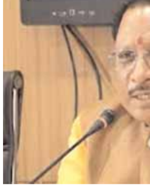
Chhattisgarh Chief Minister Vishnu Deo Sai during a press conference in Raipur.

Chhattisgarh Chief Minister Vishnu Deo Sai on Monday expressed satisfaction that the Panchayat polls in restive Bastar were held peacefully.