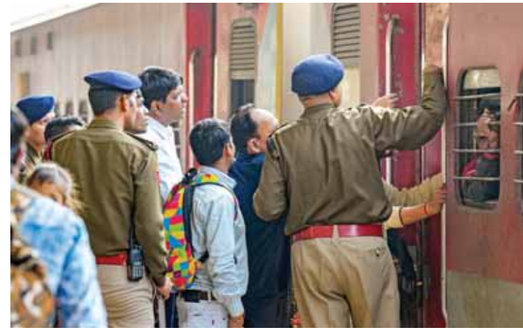
Security personnel manage passengers boarding a train at the New Delhi Railway Station

The views reportedly expressed by Mr Sam Pitroda