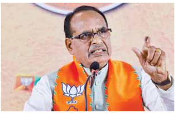
Union Rural Development Minister Shivraj Singh Chauhan

Union Rural Development Minister Shivraj Singh Chauhan on Tuesday will inaugurate the National Geospatial Knowledge-based Land Survey of Urban Habitations (NAKSHA) to create and update land records in urban areas in 152 Urban Local Bodies (ULBs) across 26 states and three Union Territories (UTs). The event will take place in Raisen, Madhya Pradesh, the ministry said in a statement. The Department of Land Resources, Ministry of Rural Development, Government of India, has initiated this pilot program. The NAKSHA program aims to create and update land records in the urban areas to ensure accurate and reliable docu-