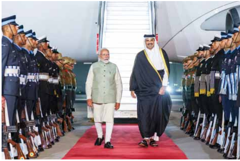
Prime Minister Narendra Modi receives the Amir of the State of Qatar Sheikh Tamim Bin Hamad Al-Thani upon his arrival in India, in New Delhi.

Amir of Qatar Sheikh Tamim Bin Hamad Al-Thani, who is scheduled to pay a state visit to India on February 17-18, will meet President Droupadi Murmu and hold talks with Prime Minister Narendra Modi on Tuesday. According to a media advisory issued by Ministry of External Affairs (MEA) on Monday, he is expected to arrive in New Delhi later this evening. His visit will provide "further momentum to our growing multifaceted partnership", the MEA had said in a statement on Saturday. He will be accompanied by a high-level delegation, including ministers, senior officials and a business delegation, it said. According to the media advisory, External Affairs Minister S Jaishankar will call on him on Monday evening after his arrival.