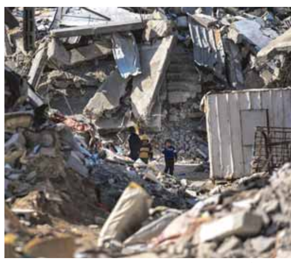
Palestinian children walk amid the rubble of homes, destroyed by the Israeli army's air and ground offensive against Hamas in in Bureij refugee camp, central Gaza Strip on Monday.