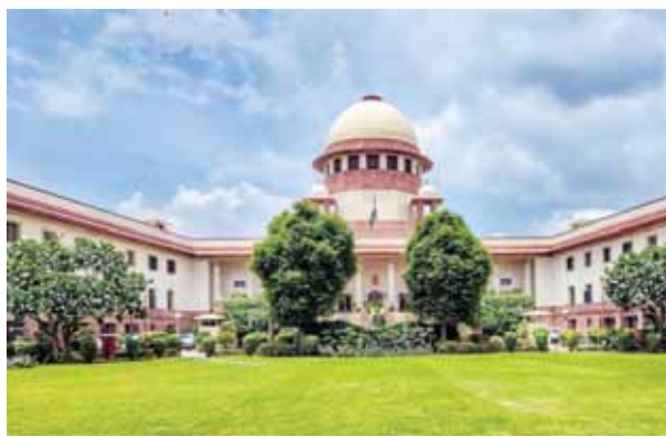
Supreme court of India

The Supreme Court on Friday slammed the Tamil Nadu Pollution Control Board for moving after two years against an order that quashed a showcause notice issued against Jaggi Vasudev's Isha Foundation for allegedly flouting environmental norms. A bench of Justice Surya Kant and Justice N Kotiswar Singh termed the petition filed by the Tamil Nadu Pollution Control Board (TNPCB) as a "friendly match" played by bureaucrats wanting the apex court's stamp on the petition's dismissal.