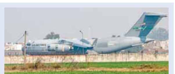
A US military aircraft carrying 104 deported Indian immigrants upon its landing in Amritsar on February 5, 2025