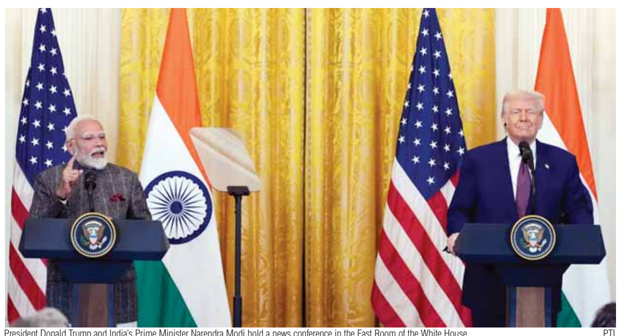
President Donald Trump and India's Prime Minister Narendra Modi hold a news conference in the East Room of the White House

relationship fully reflects the aspirations of the Catalysing Opportunities for Military Partnership, Accelerated Commerce and Technology (COMPACT). "To advance this innovative, wide-ranging BTA, the US and India will take an integrated approach to strengthen and deepen bilateral trade across the goods and services sector, and will work towards increasing market access, reducing tariff and non-tariff barriers, and deepening supply chain integration," it added. Normally in a free trade agreement, two trading partners either eliminate or significantly reduce customs duties on maximum number of goods traded between them. Besides, they also ease norms to promote trade in services and boost investments. During the first term of President Donald Trump, India and the US had discussed a mini-trade deal, but was shelved by the Joe Biden administration as they were not in favour of a free trade agreement. The leaders also welcomed early steps to demonstrate mutual commitment to address bilateral trade barriers. In 2023, the US and India