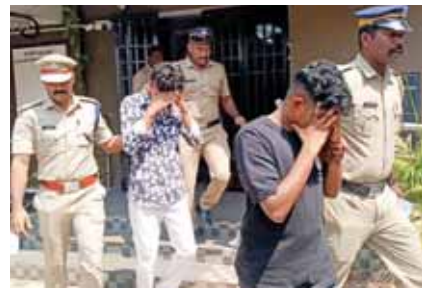
Kerala police personnel escort students who were arrested for allegedly ragging first-year students at the Government Nursing College, in Kottayam on February 12, 2025