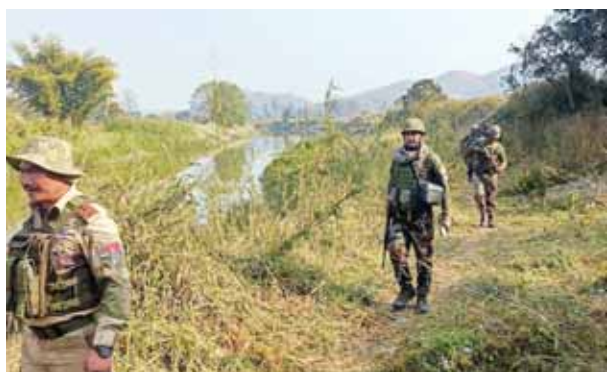
Security personnel conduct a search operation in the fringe and vulnerable areas of hill and valley districts of Manipur

All eyes are now on the BJP central leadership over its next step in strife-torn Manipur, a day after President's rule was imposed in the northeastern state and the assembly put under suspended animation. Security has been beefed up across the state following the Centre's announcement of President's rule, officials said. President's rule was imposed in Manipur and the assembly put under suspended animation on Thursday evening, days after Chief Minister N Biren Singh resigned from his post that led