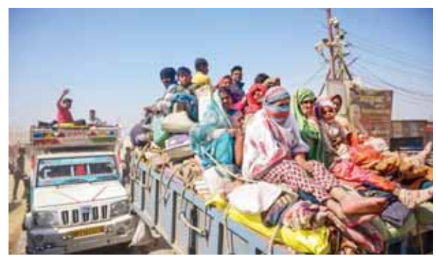
Devotees return from the ongoing Maha Kumbh

Despite expectations that the crowd would ease after Maghi Purnima, the influx of visitors has continued to rise, pushing the city's roads into a state of paralysis. The Civil Lines route leading to the fairground witnessed multiple choke points, while major congestion was also reported in Jhansi, Naini, and Phaphama. Parking spaces were running out, leaving vehicles stranded for hours and devotees exhausted. "I reached Naini station at 6 AM, but even after six hours, I have not been able to reach Sangam. The time taken from Rewa to Prayagraj was less than the time it is taking to get from Naini to the fairground,"