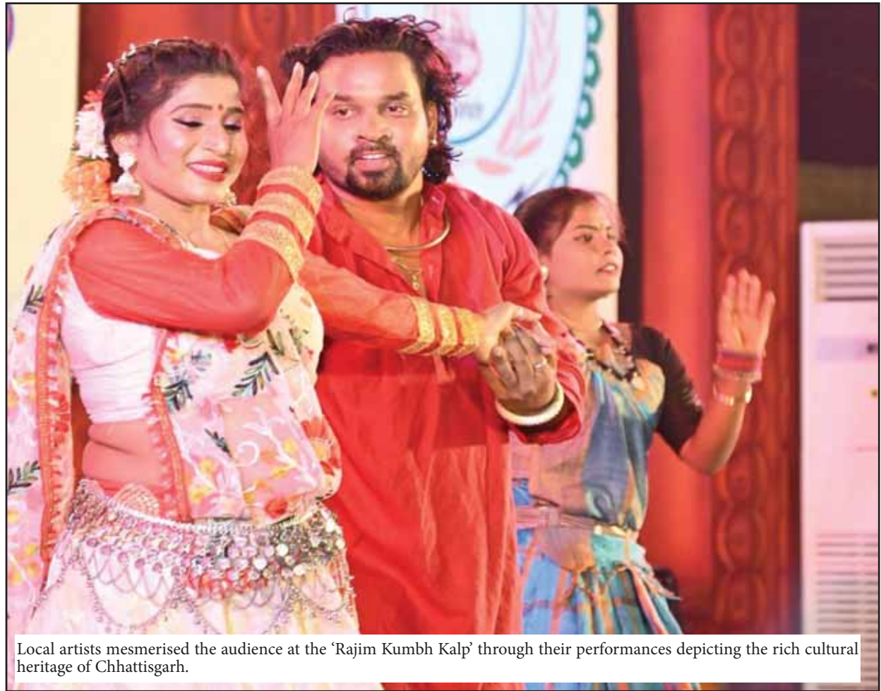
Local artists mesmerised the audience at the 'Rajim Kumbh Kalp' through their performances depicting the rich cultural heritage of Chhattisgarh.