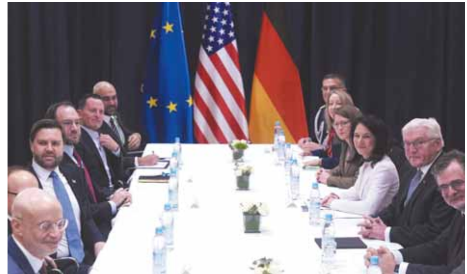
United States Vice-President JD Vance, third left, meets with Germany's President Frank-Walter Steinmeier, second right, and Germany's Foreign Minister Annalena Baerbock, center right, on the sidelines of the Munich Security Conference in Munich, Germany, Friday.

Zelenskyy in Munich told reporters that he thinks the