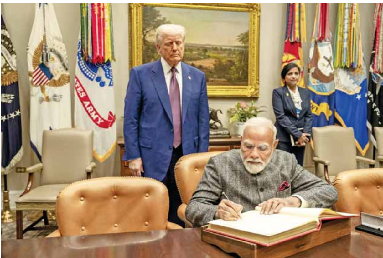
Prime Minister Narendra Modi during a meeting with US President Donald Trump at the White House, in Washington, DC, USA