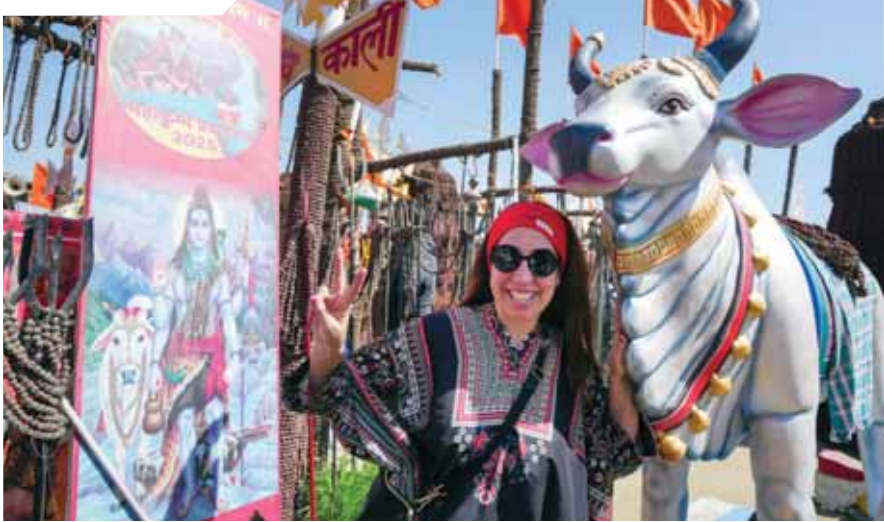
A foreign devotee during the Mahakumbh Mela 2025, in Prayagraj