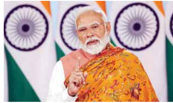
Prime Minister Narendra Modi addresses 'SAMVAD' programme in Thailand via video conferencing.

In a video address to the fourth edition of Samvad, a global Hindu-Buddhist initiative for conflict avoidance, organised in Thailand, Modi said the shared traditions of Asia rooted in the principles of Dhamma provide answers to the environmental crisis plaguing the world. Hinduism, Buddhism, Shintoism, and other Asian traditions teach people to live in harmony with nature, he said, adding they do not see themselves as separate from nature but as a part of it. According to a statement, Modi highlighted the concept of