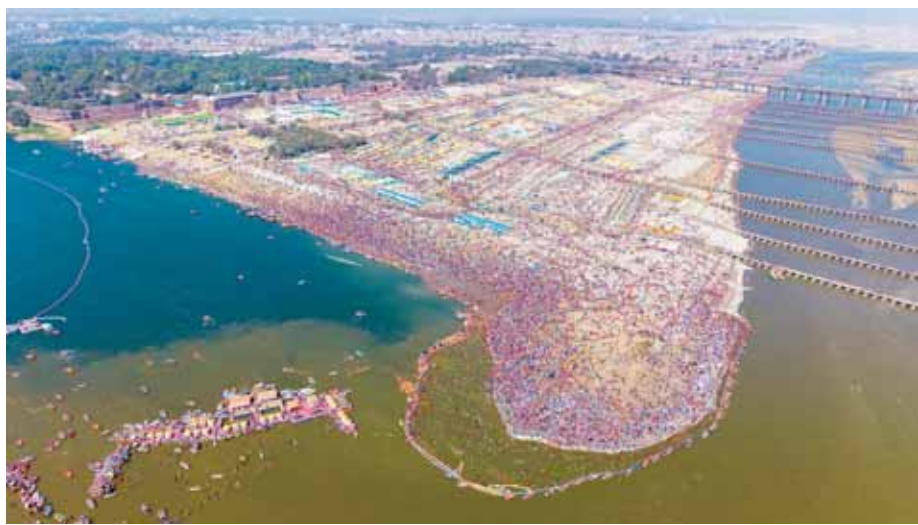
An aerial view of devotees gathered to take a holy dip at Sangam, the confluence of the Ganga, Yamuna, and mythical Saraswati rivers, during Maha Kumbh festival in Prayagraj.

Addressing a gathering, CM Yogi highlighted that so far, nearly 50 crore devotees have participated in the sacred dip at the Maha Kumbh, showcasing Uttar Pradesh's efficient management and infrastructural capabilities. He asserted that the event has provided a long-awaited recognition to religious sentiments that had been suppressed for centuries. CM Yogi responded to concerns about government expenditure on the event, stating that ₹1,500 crore had been invested in infrastructure and logistical arrangements, ensuring a seamless experience for pilgrims. He underscored that