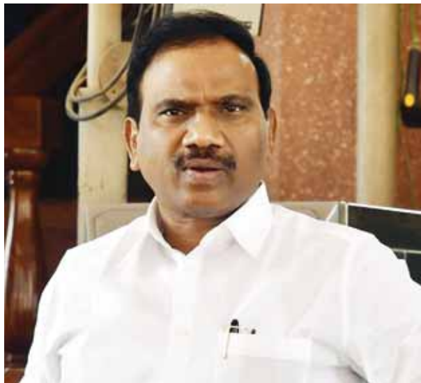
Former telicomm minister A Raja