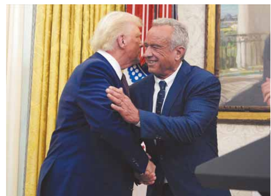
President Donald Trump congratulates Robert F. Kennedy Jr., after he was sworn in as Health and Human Services Secretary in the Oval Office at the White House, Thursday in Washington.