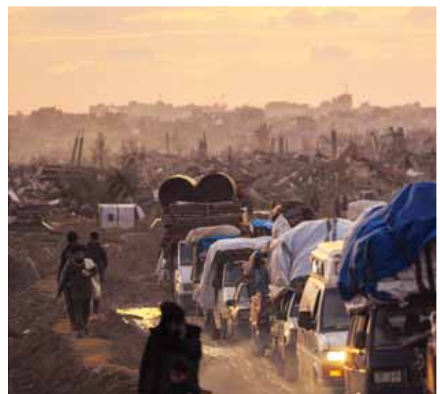
Displaced Palestinians, travelling in vehicles, wait in line to pass through a security checkpoint at the Netzarim corridor as they make their way from central Gaza to their homes in the northern Gaza Strip, on Monday