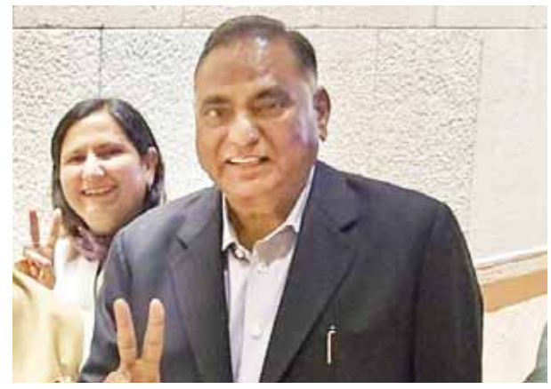
BJP MP from South Delhi Ramvir Singh Bidhuri

BJP MP from South Delhi Ramvir Singh Bidhuri on Tuesday raised the demand in the Lok Sabha to regularize 69 colonies like Sainik Farm and provide all civic amenities in them. He also said just as a decision has been taken to regularize 1,700 unauthorized colonies, in the same way these colonies should also be regularized. The matter of these colonies is stuck for a long time. Bidhuri said in the House that Prime Minister Narendra Modi's government has regularized more than 1,700 colonies of the capital. The work of giving ownership rights and providing civic amenities in these colonies is going on at a fast pace, but a decision has not been taken about 69 colonies like Sainik Farm. He said the announcement of giving ownership rights and providing civic amenities to these colonies should also be made soon. Permission should also be given to make layout plans of these colonies and to build houses in them as per building bylaws. Bidhuri said he has also raised this matter before Union Housing and Urban