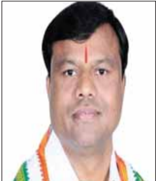
STAFF REPORTER ■ RAIPUR

Citing people's anger existing on the ground against the BJP government,