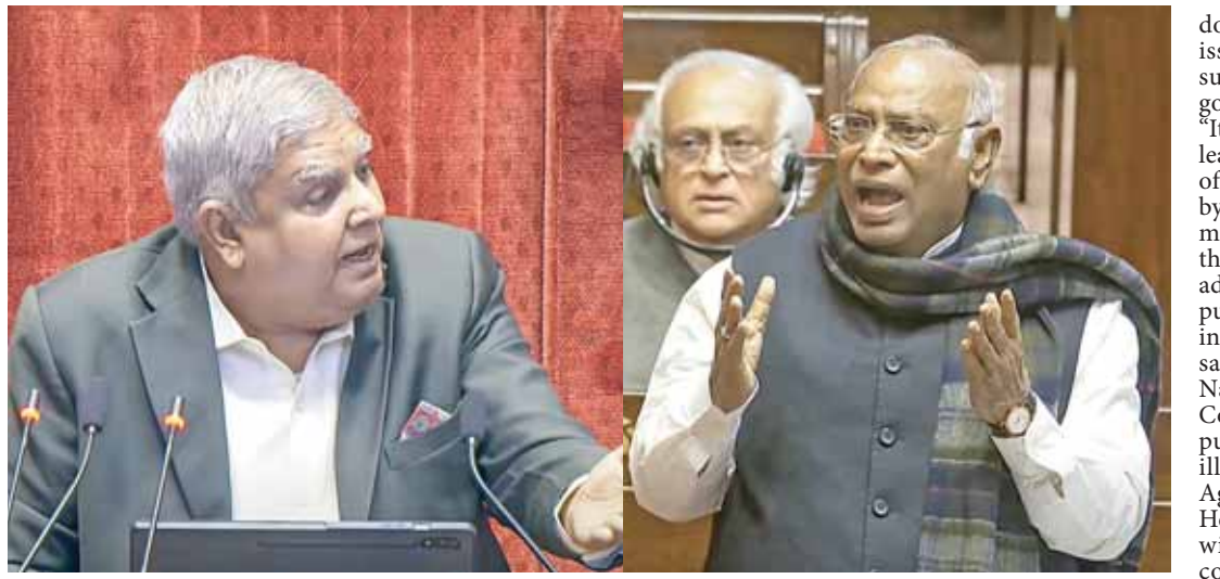
Leader of Opposition Mallikarjun Kharge speaks in the Rajya Sabha as Chairman Jagdeep Dhankhar looks on during Budget session of Parliament, in New Delhi, Tuesday

categorical, the Constitution signed by the founding fathers of the Constitution, carrying 22 miniatures, is the only authentic one and it can include amendments by the Parliament. If there is any change effected by judiciary or any institution, it is not acceptable to this House. "I will appeal to the Leader of the House to ensure that in the country only the authentic version of the Indian Constitution be promulgated. Any violation of this should be taken quite seriously by the government and severe action taken," the Chairman said in the House. Kharge was first given the floor to speak on the issue, who alleged that the BJP was unnecessarily raising the issue to create a controversy. "They are unnecessarily raising the issue and want to create a controversy on Ambedkar's Constitution. They never raised this issue when Ambedkar, Patel, others were alive...Now they are bringing new