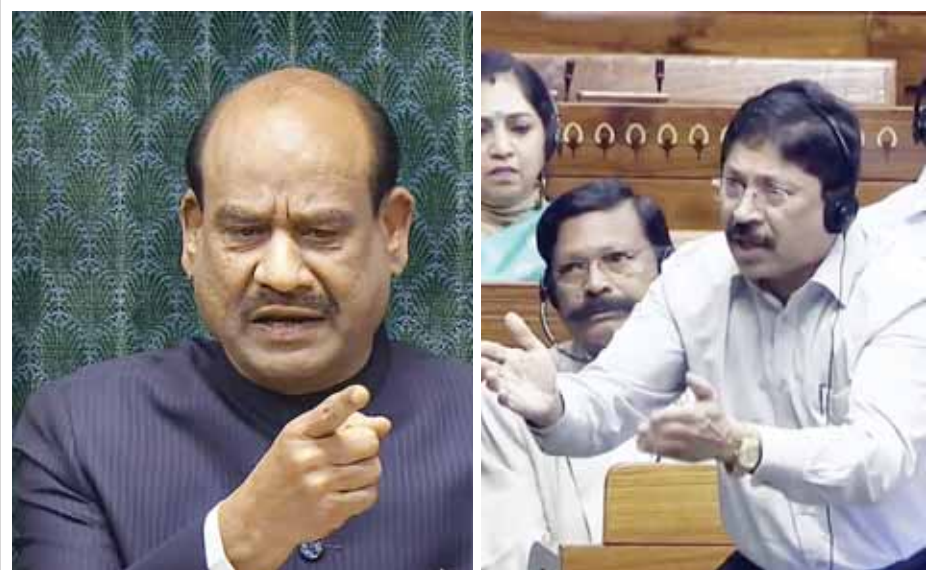
Lok Sabha Speaker Om Birla and DMK MP Dayanidhi Maran during the Budget session of Parliament, in New Delhi