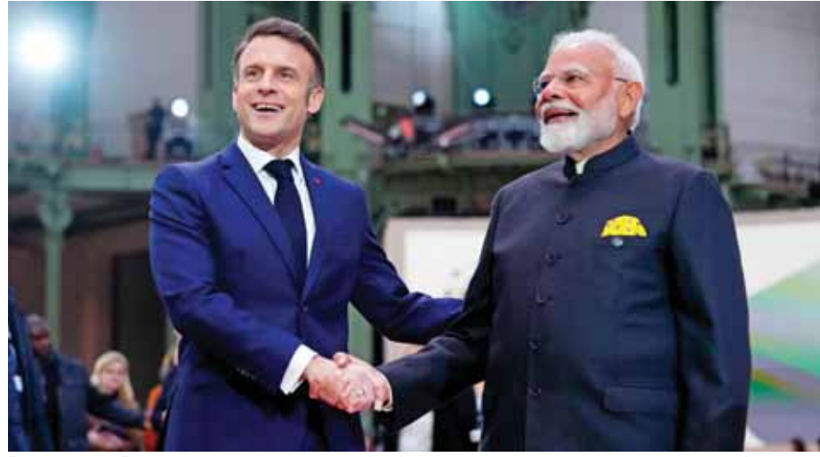
French President Emmanuel Macron shakes hands with India's Prime Minister Narendra Modi as they arrive to the Artificial Intelligence Action Summit at the Grand Palais in Paris, France

Prime Minister Narendra Modi on Tuesday made a strong case for collective efforts to establish a global framework for artificial intelligence (AI) based on open source which enhances trust, transparency and is free from biases. Co-chairing the AI Action Summit along with French President Emmanuel Macron here, Modi said that AI is changing the polity, economy, security and society, and is writing the code for humanity in this century. Modi also offered to host the next AI Action Summit in India, supporting the decision taken at the first summit hosted by France to set up the 'AI Foundation' and the 'Council for Sustainable AI'. "There is a need for collective global efforts to establish governance and standards that uphold our shared values, address risks and build trust," Modi said, adding that governance is not just about managing risks and rivalries but is also about promoting innovations and deploying them for global good. "We must democratise technology and create people-centric applications. We must address concerns related to cyber security, disinformation and deep fakes," the Prime Minister said. Stressing on the need to develop quality data sets free from biases, the Prime Minister said there is a need to develop open-source AI ecosystems that enhance trust and transparency. He said the technology should be rooted in the local ecosystem for it to be effective and useful. Modi started his address with