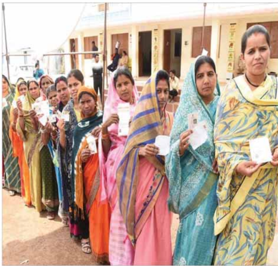
Women voters are in a queue on Tuesday at a polling booth in Durg town to exercise their franchise.

STAFF REPORTER ■ RAIPUR Chhattisgarh's ruling BJP claimed victory on Tuesday hours after the polling for 10 Municipal Corporations, 49 Municipal Councils and 114 Nagar Panchayats concluded in the