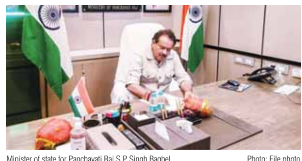
Minister of state for Panchayati Raj S P Singh Baghel

Minister of State for Panchayati Raj S P Singh Baghel will release the comprehensive Devolution Index Report on panchayats in the country on Thursday. It will provide insights into the progress of decentralisation across states and Union Territories, the ministry said on Tuesday. The Panchayati Raj Ministry in a statement issued here said the report titled "Status of Devolution to Panchayats in States - An Indicative Evidence Based Ranking 2024", will be released by the Minister on February 13. The ministry said it marks a milestone in India's journey towards empowering Panchayati Raj Institutions (PRIs) and realizing the vision of "Local Self Government" of the 73rd