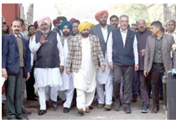
Punjab CM Bhagwant Mann with AAP MLAs talks to the media after a meeting at the Kapurthala House

Amidst reports of exodus of MLAs, Aam Aadmi Party (AAP) convener Arvind Kejriwal met Punjab chief minister Bhagwant Mann and 91 state MLAs in Delhi on Tuesday and dismissed speculation of internal discord within the party stating that "all is well" in the party. After the meeting, which lasted for about an hour, Mann and other leaders outright rejected the possibility of Kejriwal becoming the Chief Minister of Punjab and about 35 MLAs in Punjab breaking away and joining the Congress. "Our MLAs arrived here for a meeting with party national convener Arvind Kejriwal, who expressed his gratitude for their efforts in campaigning during the Delhi Assembly elections," the chief minister said. He said the party accepts the verdict of the people in the Delhi Assembly elections while praising the AAP's 'Delhi model' of governance. The meeting sent out a strong signal about there being no threat to the party's government in Punjab amid claims by the rival Congress about a brewing discontent