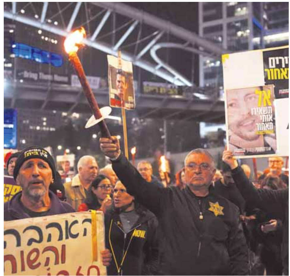
Relatives of hostages, held by Hamas in the Gaza Strip, protest outside of Israel's Ministry of Defense in Tel Aviv, Israel, on Monday after the militant group announced it would delay hostage releases in the Gaza Strip after accusing Israel of violating a fragile ceasefire