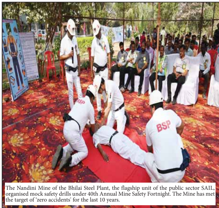
The Nandini Mine of the Bhilai Steel Plant, the flagship unit of the public sector SAIL, organised mock safety drills under 40th Annual Mine Safety Fortnight. The Mine has met the target of 'zero accidents' for the last 10 years.

Addressing these deficits demands innovative financing, inclusive policies, and sustainable housing models to create equitable urban and rural landscapes, the communique said.