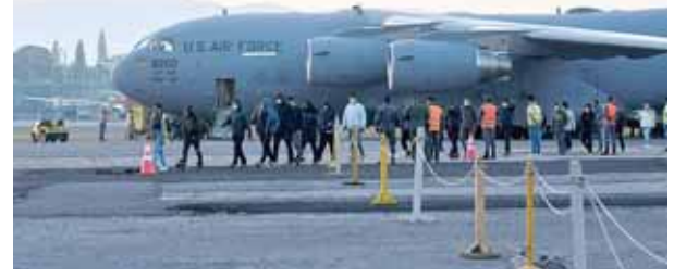
A C-17 aircraft carrying 205 Indian nationals departed from San Antonio, Texas around 3 am IST, sources said.