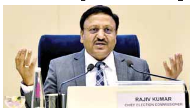
RAJIV KUMAR CHIEF ELECTION COMMISSIONER

A day before the Delhi Election Commission on Tuesday took cognizance of "repeated deliberate pressure tactics to malign ECI", saying it will not be swayed by "such insinuations". The Election Commission issued a statement on X platform, addressing the ongoing efforts to undermine its credibility. This comes after the Aam Aadmi Party (AAP) chief Arvind Kejriwal accused the Election Commission of biased and unprofessional behaviour in handling the election related issues. "The three-member Commission collectively noted repeated deliberate pressure tactics to malign ECI in the Delhi Elections, as if it is a single-member body and decided to have constitutional restraint, absorbing such outbursts with sagacity, stoically and not to be swayed by such insinuations," the Election Commission wrote on X, without naming AAP or Kejriwal. "Action on issues raised by political parties & candidates are taken in each instance by over 1.5 lakh officials in #DelhiAssemblyElection2025 who are functioning within an established legal framework, robust processes & SOPs ensuring fair play and non-partisan conduct," it added. The poll body also warned its poll machinery in Delhi that any partisan conduct disturbing a level playing field