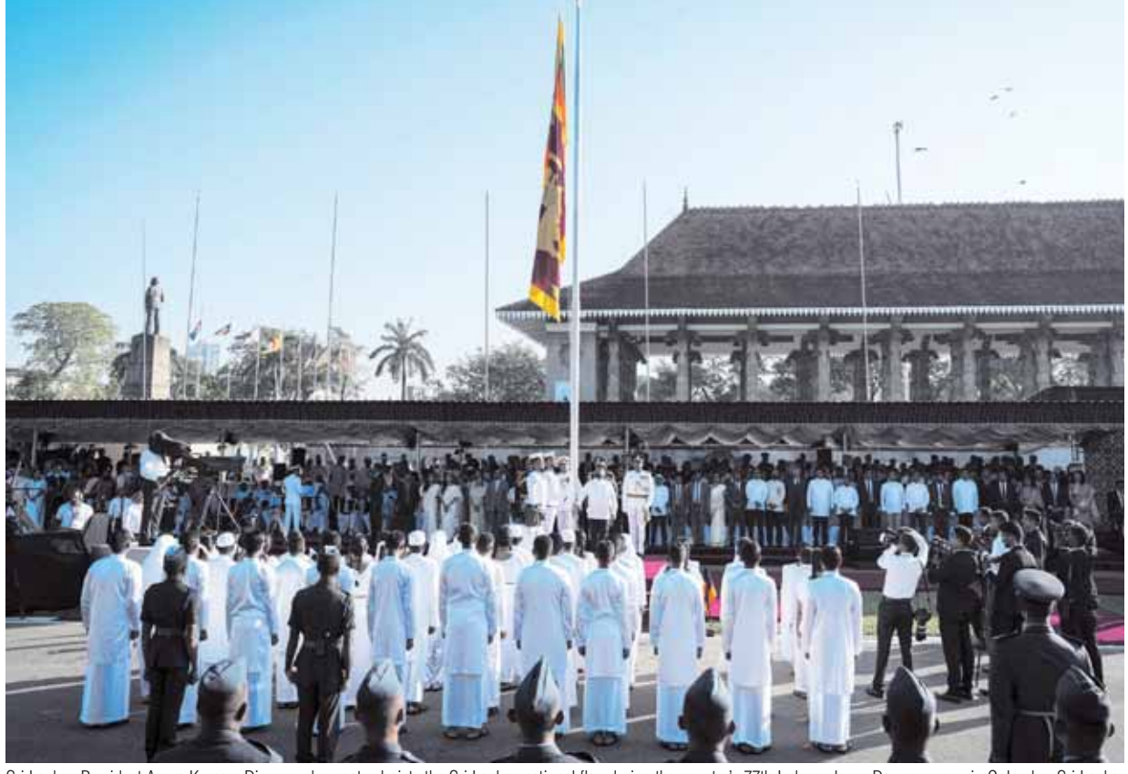
Sri Lankan President Anura Kumara Dissanayake, center, hoists the Sri Lankan national flag during the country's 77th Independence Day ceremony in Colombo, Sri Lanka, Tuesday.

President Anura Kumara Dissanayake on Tuesday said that Sri Lanka must work in unison to achieve economic freedom rather than yield to vulnerabilities within the global economic system.