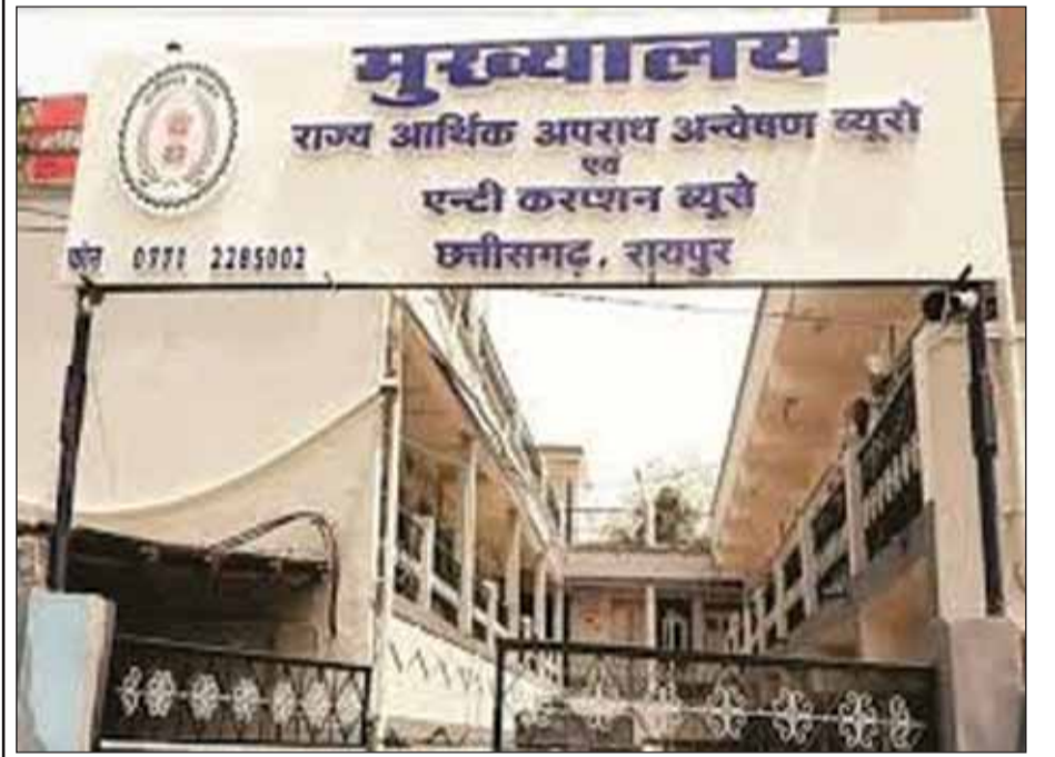
STAFF REPORTER ■ RAIPUR

A special Anti-Corruption Bureau/Economic Offences Wing (ACB/EOW) court in Raipur on Tuesday extended the custodial remand of director of medical firm in connection with the alleged irregularities in the