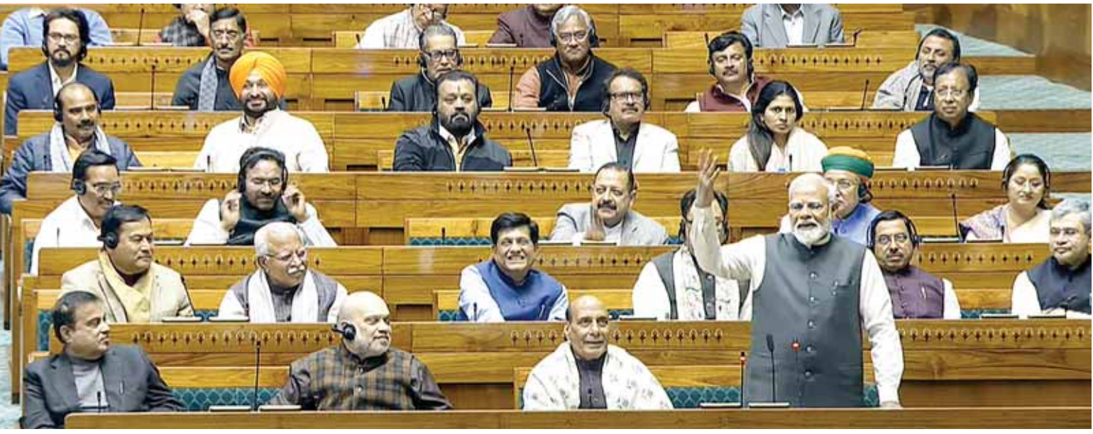
Prime Minister Narendra Modi replies to the Motion of Thanks to President's address in the Lok Sabha during the Budget session of Parliament, in New Delhi