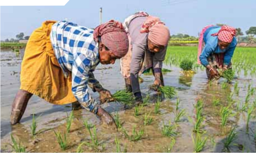
Labourers plant paddy saplings in a field, in Nadia