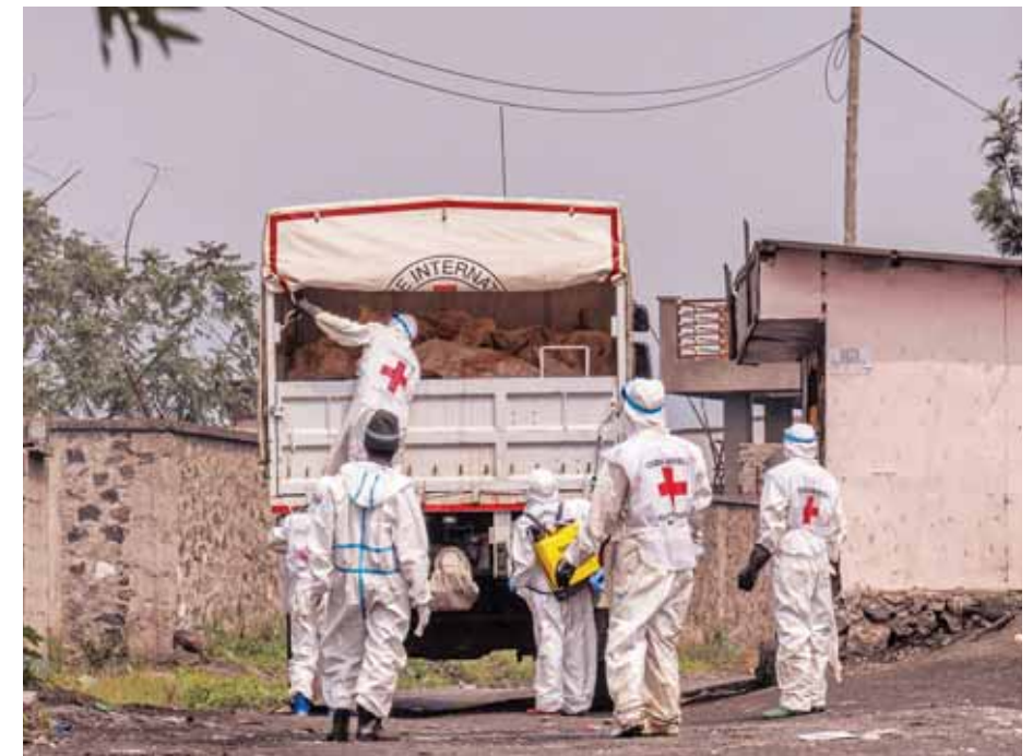
Red Cross personnel load bodies of victims of the fighting between Congolese government forces and M23 rebels in a truck in Goma, Democratic Republic of Congo, Monday as the U.N. health agency said 900 died in the fight.

stopping people from making the journey to the United States and has worked with regional countries to boost immigration enforcement on their borders as well as to accept deportees from the United States. One idea being floated is to negotiate a so-called "safe third country" agreement with El Salvador that would allow for non-Salvadorean migrants in the US to be deported to El Salvador.