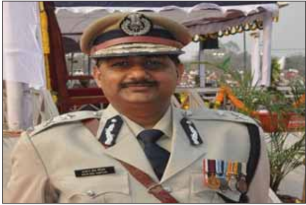
STAFF REPORTER ■ RAIPUR