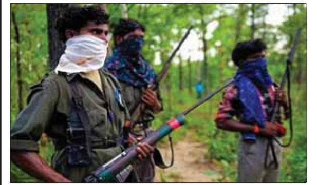
STAFF REPORTER ■ BIJAPUR