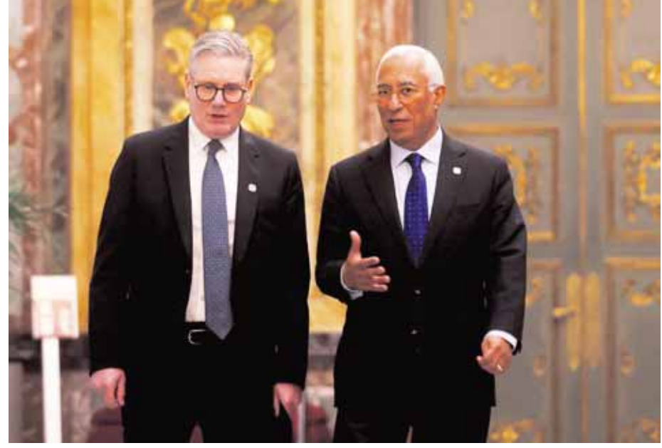
Britain's Prime Minister Keir Starmer, left, speaks with European Council President Antonio Costa as he arrives for an EU summit at the Egmont Palace in Brussels, Monday.

on the fact "that everybody has to respect the sovereignty of all national states in the world, and that Greenland is today a part of the Kingdom of Denmark. It's part of our territory and it's not for sale." European Council President Antonio Costa, noting that the EU has stood beside Ukraine in defense of its borders, said of Greenland: "Of course, we will stand also for these principles, all the more so if the territorial integrity of a member state of the European Union is questioned." Frederiksen acknowledged US concerns about security in the Arctic Region, where Russia and China have been increasingly active. "I totally agree with the Americans that the High North, that the Arctic region is becoming more and more important when we are talking about defense and security and deterrence," Frederiksen said.