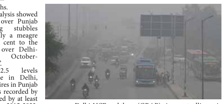
mass over Delhi-NCR and the (CRAP) in controlling air pollution in the region, the authors wrote. GRAP refers to the set of anti-pollution measures,

measures. The study, published in the journal npj Climate and Atmospheric Science, analysed fine particulate matter (PM2.5) data, recorded during the September-November months of 2022 and 2023. For the study, 30 sensors were installed across Punjab, Haryana and Delhi-NCR. Stubble burning, a common practice for clearing land following rice harvest, is often blamed for the sharp and sustained rise in PM2.5 levels, seen in the national capital region during the October-