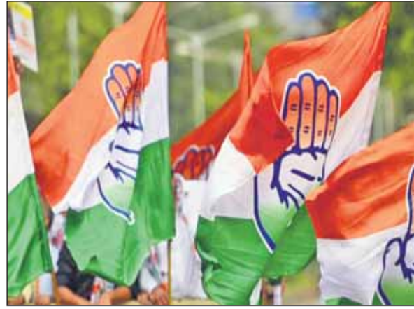
STAFF REPORTER ■ RAIPUR