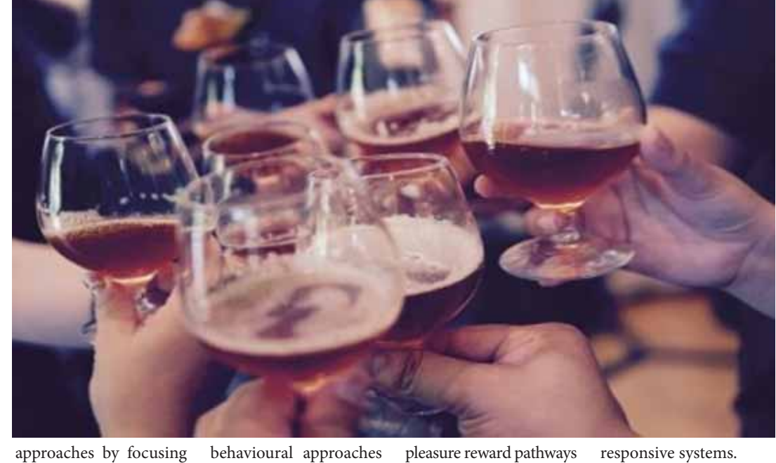
approaches by focusing

The study, published in the American Journal of Psychiatry, challenged conventional notions about alcohol's effects in depressed people who drink excessively and could improve treatment