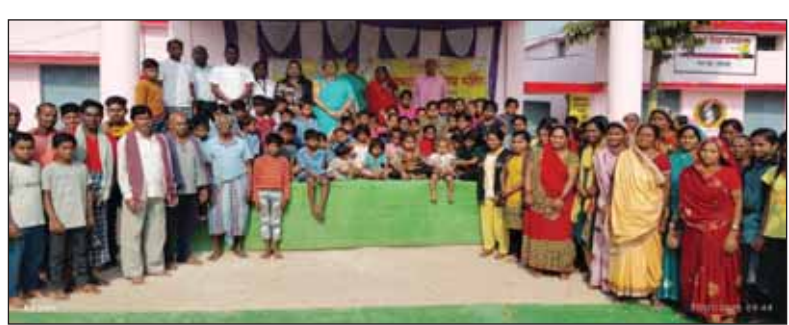
STAFF REPORTER BILASPUR

A^{ ext{s many as 700 people}}_{ ext{benefitted from a}} five-day yoga camp of the Ayush Department held in Sarwan Deori village of Chhattisgarh's Bilaspur district, an official communique