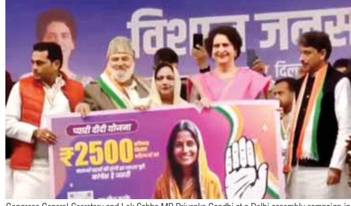
Congress General Secretary and Lok Sabha MP Priyanka Gandhi at a Delhi assembly campaign in national Capital on Sunday. Delhi goes to polls on Wednesday

routed completely. Members of Opposition parties under the INDIA bloc has claim that about 63 election petitions have been filed across various benches of the Bombay High Court