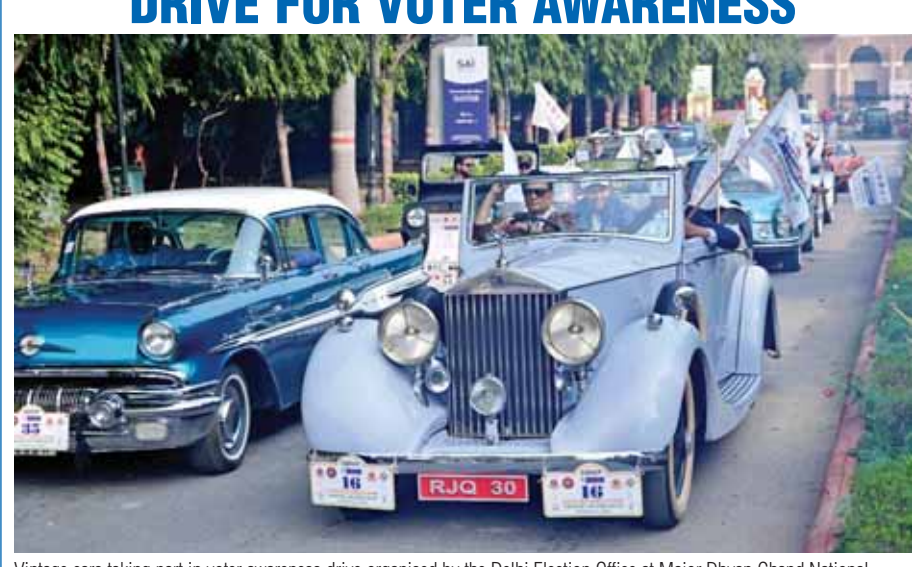
Vintage cars taking part in voter awareness drive organised by the Delhi Election Office at Major Dhyan Chand National

- are closed for the The portals reopen in April-May the following year. During the six-month-long pilgrimage Lakhs of devotees from across the country and abroad visit the Char Dhams.