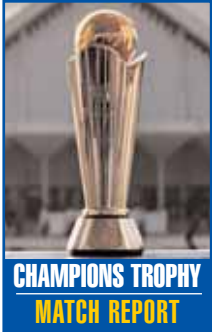
CHAMPIONS TROPHY MATCH REPORT

1x6) brought stability to England's innings through two alliances, adding 68 runs with Ben Duckett (38), who was dropped on 29, for the third wicket and then an 83-run stand with skipper Jos Buttler for the fifth wicket. They were not really blazing partnerships but kept England afloat, keeping them