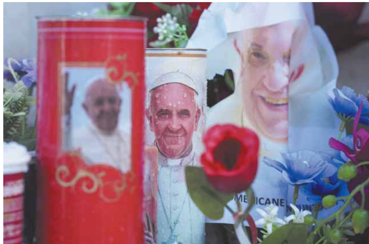
Candles and flowers for Pope Francis are seen at the Agostino Gemelli Polyclinic, in Rome, Wednesday, where the Pontiff is hospitalised since Friday.

Pope Francis was sitting upright and receiving therapy for double pneumonia Wednesday, the Vatican said, as Argentines and Romans alike gathered in the Eternal City to pray for his recovery. Francis remained in critical condition. The Vatican said that it hoped to have information later in the day about the results of a CT scan taken Tuesday evening to check on the status of the complex lung infection that has kept him hospitalised since Feb. 14. The Vatican said the pope had a peaceful night and was up, sitting in his armchair on Wednesday receiving therapy. Doctors have said he isn't out of danger, but hasn't had any further respiratory crises since Saturday.