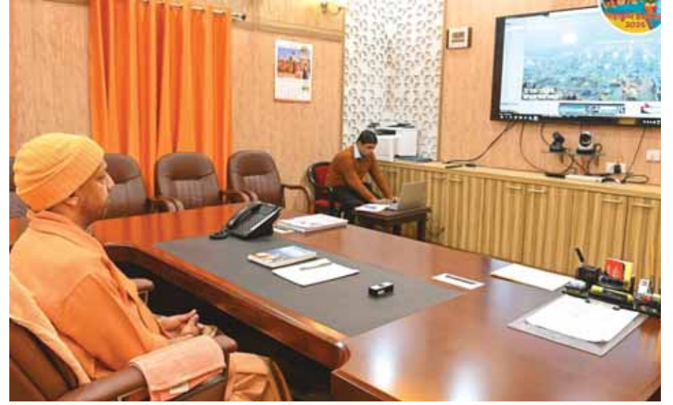
UP Chief Minister Yogi Adityanath monitors the holy bath of Maha Shivratri going on in Prayagraj from the control room located at Gorakhnath temple.

Chief Minister Yogi Adityanath remained highly active during the early hours of the auspicious occasion of Mahashivaratri, the final bathing day of the Maha Kumbh 2025. Like every previous amrit snans and bathing festivals, he began his day early at 4 am to oversee the arrangements. Due to his ongoing visit to Gorakhpur, a control room was set up at the Gorakhnath temple, where he closely monitored the event, watching live feeds of devotees bathing at the Sangam on TV. From the control room, he gave real-time instructions to senior officials. Under the guidance of Chief Minister Yogi, top officials were on high alert and promptly took charge of the situation. Earlier, on the occasions of Basant Panchami and Maghi Purnima amrit snans, the chief minister had also held meetings with officials at the war room from early morning, ensuring smooth operations through constant monitoring. On this significant day of Mahashivaratri amrit snan, which also marks the closure of