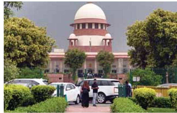
NEW DELHI