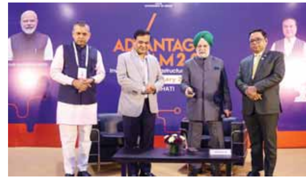
Union Minister Hardeep Singh Puri with Assam Chief Minister Himanta Biswa Sarma during Advantage Assam 2.0 Investment and Infrastructure Summit 2025 in Guwahati

India is looking at increasing its target to blend ethanol with petrol to more than 20 per cent and has formed a committee under the NITI Aayog for this, Petroleum Minister Hardeep S Puri said on Wednesday. Addressing the Advantage Assam 2.0 business summit in Guwahati, he said 19.6 per cent blending has already been achieved. "We will be looking at more than 20 per cent blending of biofuel. Already a NITI Aayog group has been set up and they are looking into it," he said. "We had set a target of 20 per cent blending by 2026, but already achieved 19.6 per cent. I am sure we will touch