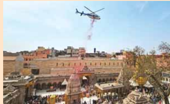
Flower petals being showered on devotees from a helicopter at the Kashi Vishwanath Temple on the occasion of Mahashivratri in Varanasi.

This Mahashivratri was indeed special in the sacred city of Lord Shiva, Kashi. On Wednesday, the Yogi government made the celebrations more special by orchestrating a grand flower shower from a helicopter, covering Shri Kashi Vishwanath Dham and the Ganga ghats. As rose petals rained from the sky, chants of 'Har Har Mahadev' echoed through the air, filling devotees with divine joy. Following the Maha Kumbh, Kashi witnessed a massive influx of devotees eager for Baba Vishwanath's darshan. Upholding its commitment to honouring religious faith, the state government ensured the continuation of