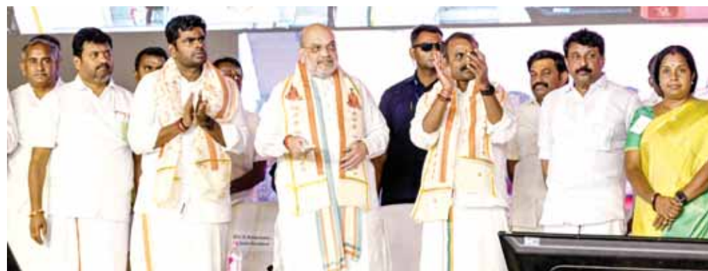
Union Home Minister Amit Shah, Union Minister of State L. Murugan, Tamil Nadu BJP President K Annamalai and others during the inauguration of a BJP office, in Coimbatore, Tamil Nadu

Under Section 8 (1) of the Representation of the People Act, 1951, the period of disqualification was six years from the date of conviction or in case of imprisonment, six years from the date of release, it added. "The disqualifications made under the impugned sections are limited by time as a matter of parliamentary policy and it would not be appropriate to substitute the petitioner's understanding of the issue and impose a lifetime ban," it said. The Centre said as a matter of judicial review, the court could declare the provisions to be unconstitutional, however, the relief sought by the petitioner effectively sought to read "life-long" instead of "six years" in all sub-sections of Section 8 of the Act. Continued on page 8