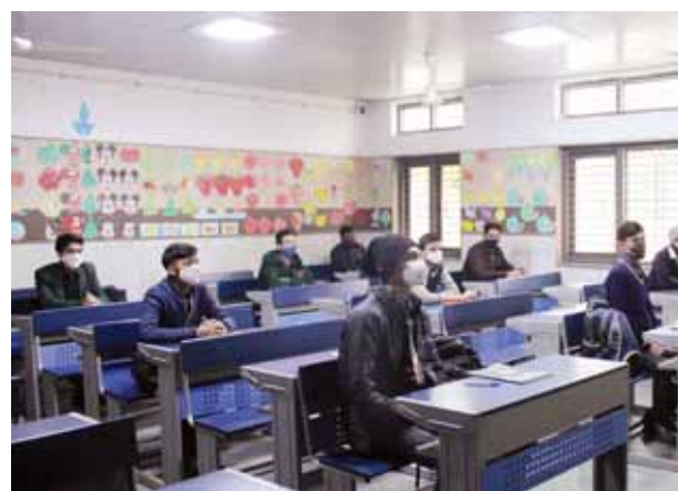
Representative photograph of a classroom