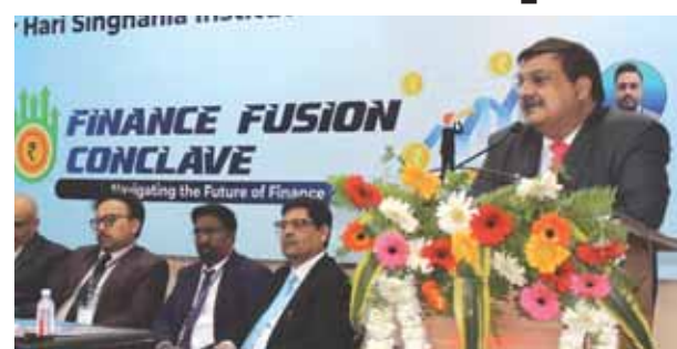
GHS-IMR organised a Finance Fusion Conclave 2025.