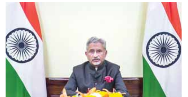
External Affairs Minister S Jaishankar addresses the Japan-India-Africa business forum on Wednesday

India's approach towards Africa has been guided by a deep-rooted commitment to build mutually-beneficial partnerships, unlike "extractive" models of engagement, External Affairs Minister S Jaishankar said on Wednesday, amid China's relentless attempts to expand influence in the continent.