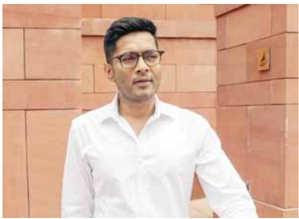
TMC leader Abhishek Banerjee