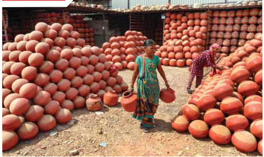
Vendors display earthen pots for sale, on the outskirts of Ahmedabad