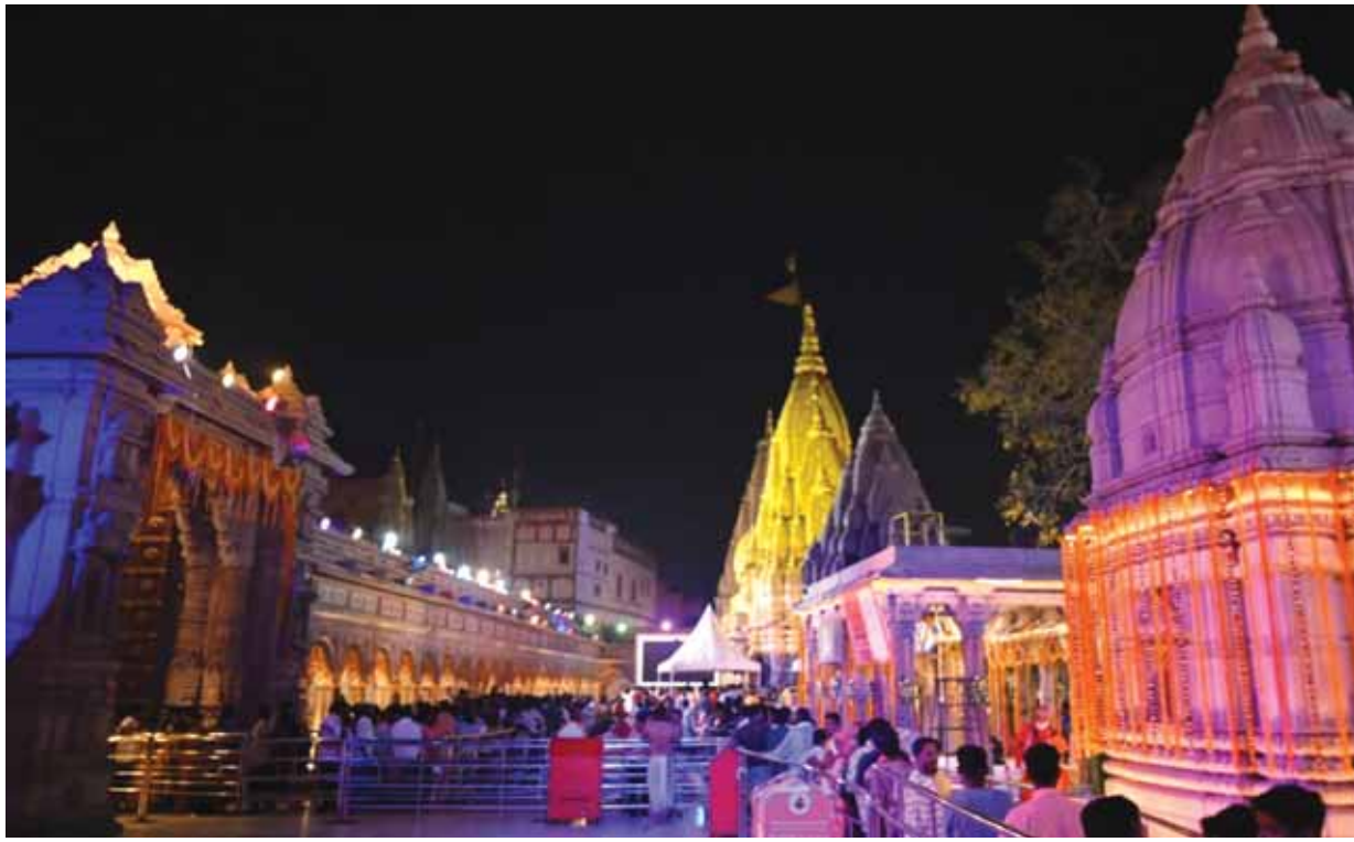
Crowd of devotees during the wee hours at Kashi Vishwanath Temple on the occasion of Mahashivratri in Varanasi on Wednesday.