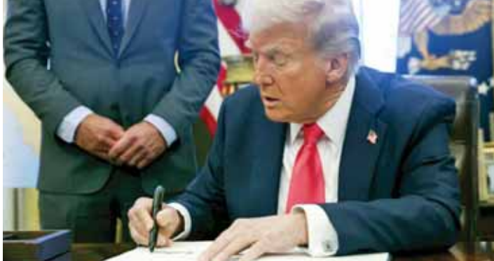
President Donald Trump's proposed "Gold Card" would replace EB-5 visas in the coming two weeks, the commerce secretary said

President Donald Trump said that he plans to offer a "gold card" visa with a path to citizenship for $5 million, replacing a 35-year-old visa for investors. "They'll be wealthy and they'll be successful, and they'll be spending a lot of money and paying a lot of taxes and employing a lot of people, and we think it's going to be extremely successful," Trump said in the Oval Office. Commerce Secretary Howard Lutnick said the "Trump Gold Card" would replace EB-5 visas in two weeks. EB-5s were created by Congress in 1990 to generate foreign investment and are available to people who spend about $1 million on a company that employs at least 10 people. Lutnick said the gold card — actually a green card, or permanent legal residency — would raise the price of admission for investors and do away with fraud and "nonsense" that he said