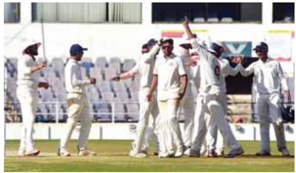
Vidarbha players celebrating on the field.