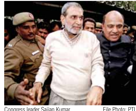
Congress leader Sajjan Kumar