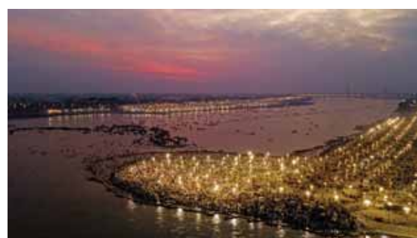
The Sangam area illuminated on the eve of Mahashivratri festival during the ongoing Maha Kumbh Mela 2025 in Prayagraj

Pilgrims thronging river banks through the clock, vendors selling 'puja' ware and security staff everywhere to manage the crowds converging at confluence point — the Triveni Sangam is where the lines between day and night blur. From morning till dusk and midnight till dawn, the cycle of spiritual bathing at the mega gathering of humanity in this holy city goes on without a break. The religious festival, billed to be the largest gathering of people in the world, ends on Wednesday with the final