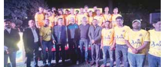
JK Cantt Spartans team ready to participate in KPL.