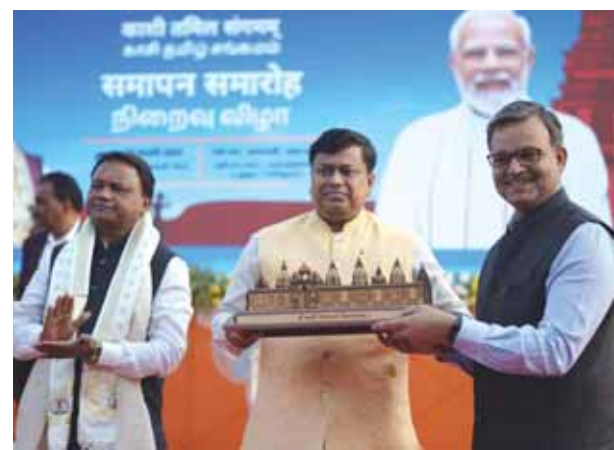
Union minister S Majumdar and Odisha Chief Minister MC Majhi being welcomed at the closing ceremony of KTS 3.0 at Namoo Ghat in Varanasi

The grand closing ceremony of Kashi Tamil Sangamam (KTS) 3.0 was held at the iconic Namoo Ghat here on Monday evening. On the occasion, Union Minister of State for Education Dr Sukanta Majumdar, Odisha Chief Minister Mohan Charan Majhi and many other dignitaries were present. Addressing the function, Union Minister Dr Majumdar said while cherishing the cultural heritage of Kashi and Tamil Nadu, we are moving towards the goal of developed India. "The efforts of the government are promoting youth empowerment, skill development, entrepreneurship and sustainable development, thereby laying the foundation of a prosperous and self-reliant India", he said. He described KTS as a festival of integration of culture and a bond of love and respect. He also said under the visionary leadership of Prime Minister Narendra Modi, this event is becoming a symbol of India's integrity and 'unity in diversity'. Odisha CM Majhi said deep-rooted Kashi and Tamil Nadu have come together to celebrate cultural richness. He said Kashi is a centre of spirituality, while Tamil Nadu is famous for its rich literature, dance and cultural heritage. Referring to the cultural ties between Odisha and Tamil Nadu, he said that from Odissi to Bharatanatyam, from Ganga to Cauvery, we are