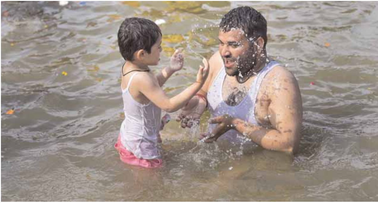
A devotee with his child takes a holy dip at Sangam during the ongoing Maha Kumbh, in Prayagraj on Tuesday

For devotees arriving from the Parade area, the following ghats have been designated for bathing – Sangam Dwar Bhadravaj Ghat, Sangam Dwar Nagvasuki Ghat, Sangam Dwar Mori Ghat, Sangam Dwar Kali Ghat, Sangam Dwar Ram Ghat, Sangam Dwar Hanuman Ghat.