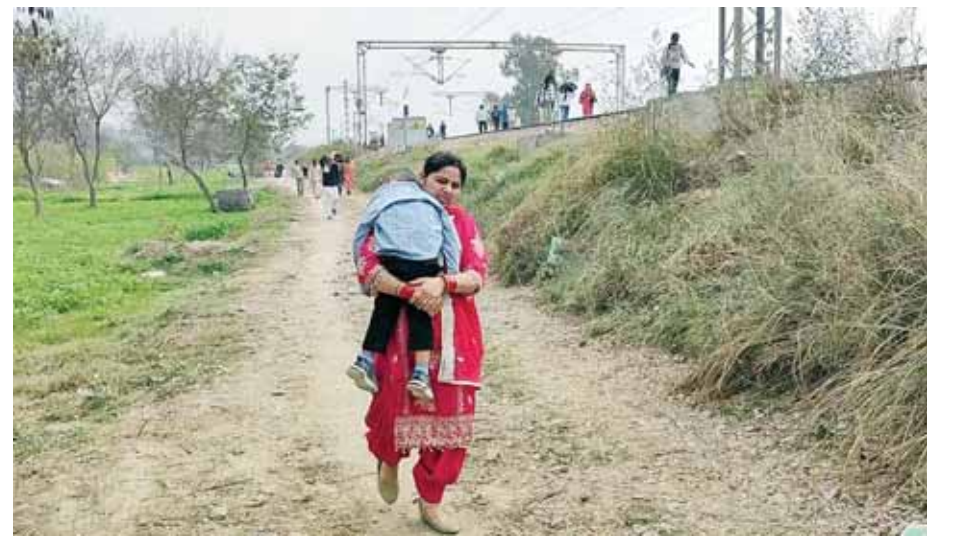
Passengers leave from the site after a bogie of a passenger train, headed from Kurukshetra to Delhi, derailed at Nilokheri.