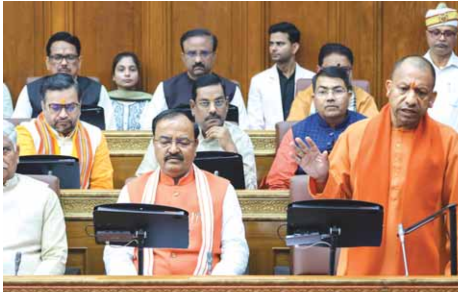
Uttar Pradesh Chief Minister Yogi Adityanath speaks in Uttar Pradesh Legislative Council during the Budget Session in Lucknow on Tuesday

ing against the governor, the chief minister asserted that such actions violate democratic values. He reminded all political parties of their duty to uphold the democratic system enshrined in the Constitution framed by Dr Bhimrao Ambedkar. Chief Minister Yogi firmly stated that the Samajwadi Party's conduct stands against democracy and the Constitution, making it unacceptable in an ideal democratic framework. Chief Minister Yogi, while strongly criticising the opposition's stance in the legislative council, remarked that while the entire world is witnessing the grandeur and divinity of the Prayagraj Maha Kumbh, the opposition remains preoccupied with baseless criticism. He emphasised that this is not just any event but a grand celebration of India's eternal traditions, faith and culture, elevating the nation's prestige on the global stage. Citing statistics, Chief Minister Yogi highlighted that a record-breaking 64 crore devotees have participated in this sacred event, surpassing the attendance of any religious gathering worldwide. He said, "Uttar Pradesh is ushering in a new era, with Ayodhya, Kashi, Mathura-