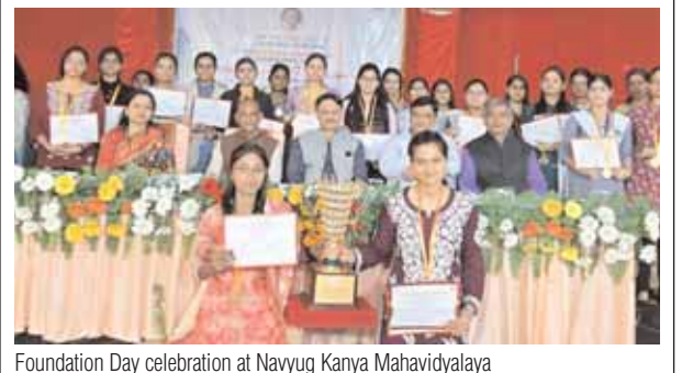
Foundation Day celebration at Navyug Kanya Mahavidyalaya