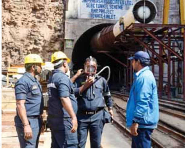
Rescue team at the Srisailem Left Bank Canal (SLBC) project site where a portion of the tunnel collapsed, in Nagarkurnool district.

As there is a continuous flow of silt and water in the partially collapsed SLBC tunnel where eight people have been trapped for over three days, experts warned that the lives of the rescue teams could also be in danger if they attempt to venture inside, Irrigation Minister Uttam Kumar Reddy said on Tuesday. Addressing media persons, Reddy cited experts, who described this as the most complex and difficult tunnel accident in the world or at least in India as there is only one entry or exit to the SLBC tunnel. He opined that the collapse might have taken place due to a slight tectonic shift and as some geological fault lines have given way. "There is one problem. The flow of silt and water into the tunnel at a very high speed continues. So there was one opinion expressed by some experts that the people going into the rescue, even their lives could be endangered. So, we are a responsible government, we are taking the best expert opinion, and we will take a final call on that (on how to go about it)," he said. The Minister noted that experts from 10 agencies such as Indian Army, the Marine Commando Force (MARCOS) of Navy, NDRE, SDRE, GSI, Rat Miners and Singareni Collieries Company Ltd are working round the clock to save the eight lives. He further said a unified command control has been set up which is constantly being monitored by