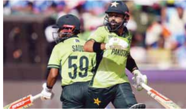
Pakistan players on the field during a match.

"Look at Inzamam-ul-Haq, for example. If you look at his stance, you wouldn't recommend that to a young batter, but he had great temperament. With that kind of temperament, he made up