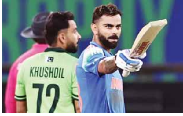
Virat Kohli batting during a match.

En route his century in his 299th 50-over appearance, Kohli became the fastest batter to reach 14,000 ODI runs, joining the elite group of Sachin Tendulkar (18,426 in