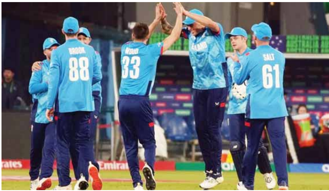
England players celebrating on the field during a match.

Afghanistan's three-pronged spin attack, consisting Rashid Khan, Noor Ahmad and Mohammad Nabi, has the potential to trouble even the best, and England batters' recent outings