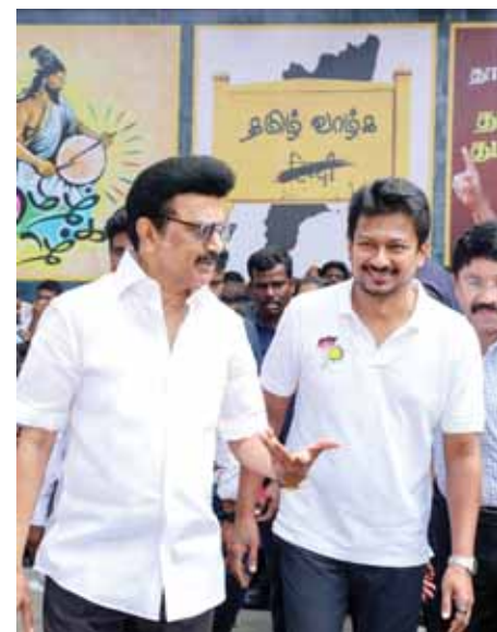
Tamil Nadu Chief Minister MK Stalin with his deputy Udayanithi Stalin and others at the opening of 'Kalaingar Centenary Boxing Academy' in Chennai