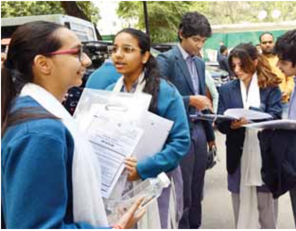
Students discuss after appearing in the class 12th board exam conducted by the CBSE. File Photo