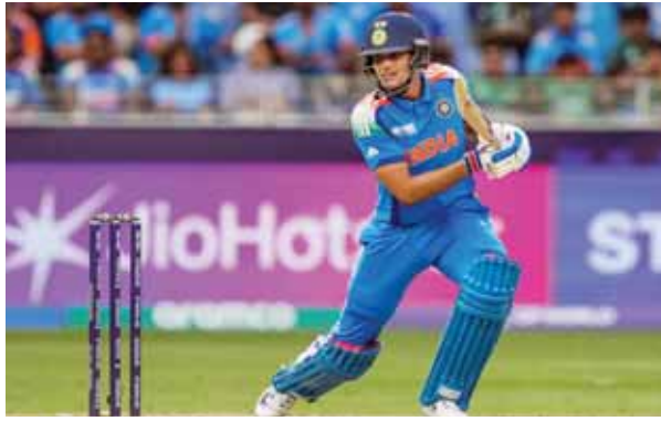
Shubman Gill batting during a match.

Amla said playing the tri-series in Pakistan ahead of Champions Trophy would