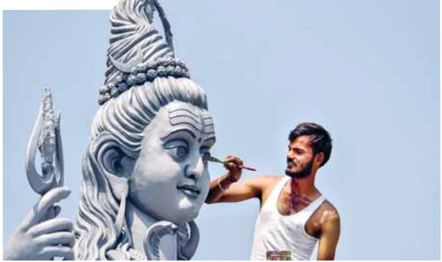
A worker paints the statue of Lord Shiva ahead of the Maha Shivaratri festival, in Chikmagalur