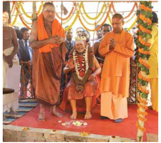
UP CM Yogi Adityanath with Shankaracharya of Kanchi Kamakoti Peetham Jagadguru Shankara Vijayendra Saraswati Swamigal during Maha Kumbh Mela Mahotsav programme at Maha Kumbh Mela in Prayagraj on Sunday