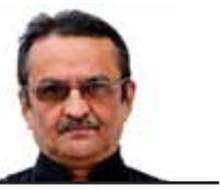
B K JHA

(The writer is a senior journalist; views are personal)