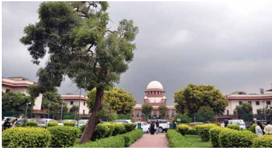
Supreme Court of India