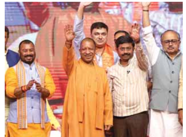
UP CM Yogi Adityanath attends a programme organised to mark Sant Gadge's 149th birth anniversary at Maha Kumbh mela in Prayagraj on Sunday

A grand function was held at the Ganga Pandal in Sector 1 of Mahakumbh Nagar on Sunday to mark the 149th birth anniversary of saintly social reformer Gadge Maharaj. Paying tribute to Sant Gadge on this occasion, Chief Minister Yogi Adityanath hailed him as a pioneer of social justice who spearheaded public awareness against caste discrimination, superstition and uncleanness. He emphasised that Sant Gadge's life has been a beacon of inspiration for societal reform and awareness. He said, "Wherever he travelled, he spread the message of education and cleanliness through kirtans, always carrying a broom as a symbol of his mission." Chief Minister Yogi recalled Sant Gadge's belief that "God resides where there is cleanliness" and noted how Prime Minister Narendra Modi furthered this very vision through the launch of the Swachhata Abhiyan on October 2, 2014, which has now become a global movement. The chief minister remarked that the message of cleanliness propagated by Sant Gadge a century ago continues to inspire millions today. Under Prime Minister Modi's leadership, the Swachh Bharat Mission has facilitated the construction of toilets in crores of households, safeguarding women's dignity and preventing diseases, he added.