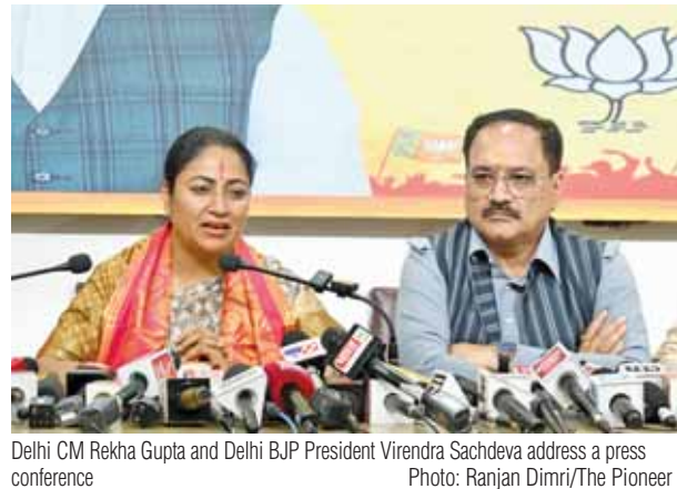
Delhi CM Rekha Gupta and Delhi BJP President Virendra Sachdeva address a press conference