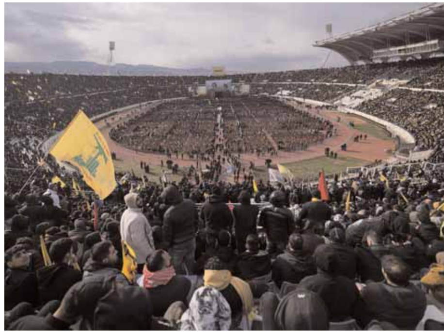
People gather for the funeral ceremony of the Lebanon's late Hezbollah leaders Hassan Nasrallah and Hashem Safieddine at the Sports City Stadium in Beirut, Lebanon, on Sunday