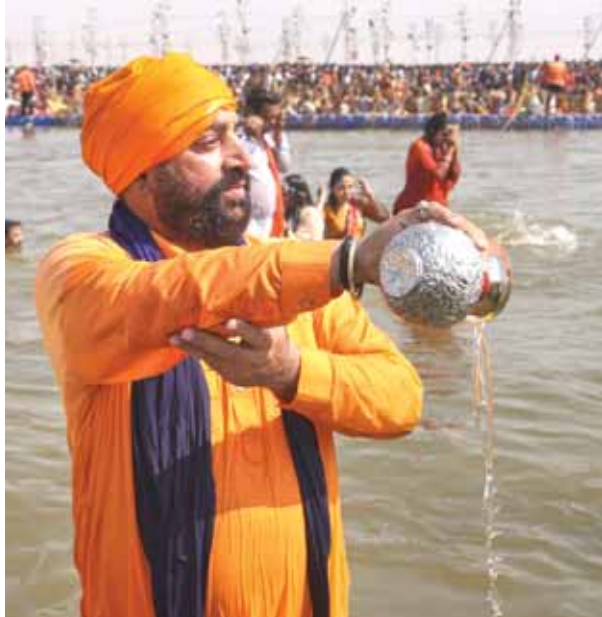
Uttarakhand Governor Lieutenant General Gurmit Singh (Retd) prays after taking a holy dip at Triveni Sangam during Maha Kumbh in Prayagraj on Sunday

Crores of devotees continue to take a sacred dip at the Triveni Sangam, joined by prominent leaders, saints and dignitaries in the grand Maha Kumbh celebrations. On Sunday, Uttarakhand Governor Lt General (Retired) Gurmit Singh, Odisha Chief Minister Mohan Charan Majhi, Bharatiya Janata Party leader Sambit Patra, and renowned Sufi singer Kailash Kher participated in the holy ritual, immersing themselves in faith. Uttarakhand Governor Gurmit Singh praised the arrangements at the Mahakumbh Nagar, stating, "I extend my congratulations to Uttar Pradesh Chief Minister Yogi Adityanath and all officials for the impeccable management. This experience is beyond words - it can only be felt." Odisha Chief Minister Mohan Charan Majhi, who arrived in Prayagraj with his family, also lauded the efforts of the UP government. "The arrangements are outstanding. I thank the administration for ensuring such a smooth experience for millions of devotees," he remarked. BJP leader Sambit Patra, after taking a dip at the Sangam, called it a divine moment. "I have travelled from Puri to Prayagraj today. The management here is truly commendable," he said. Renowned devotional singer Kailash Kher, too, immersed himself in the sacred waters, expressing deep reverence.