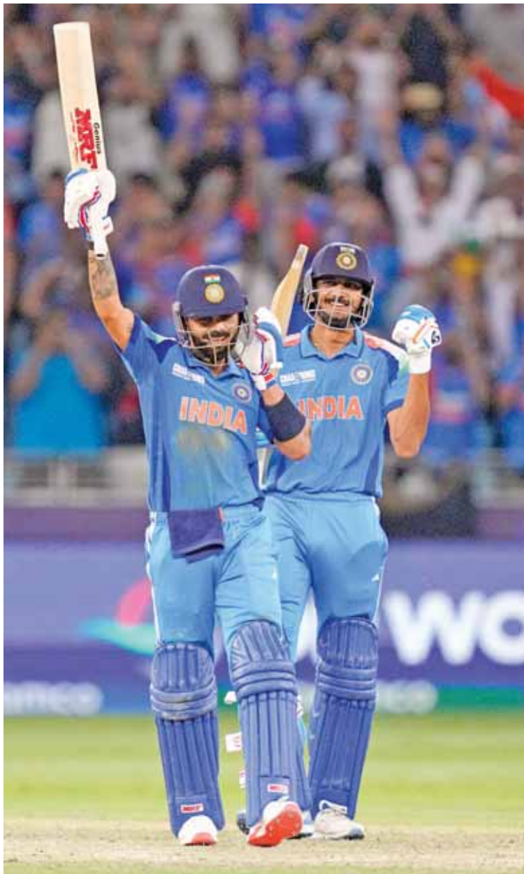
Virat Kohli celebrates his century with Axar Patel after scoring the winning runs during the ICC Champions Trophy between India and Pakistan, at Dubai International Cricket Stadium