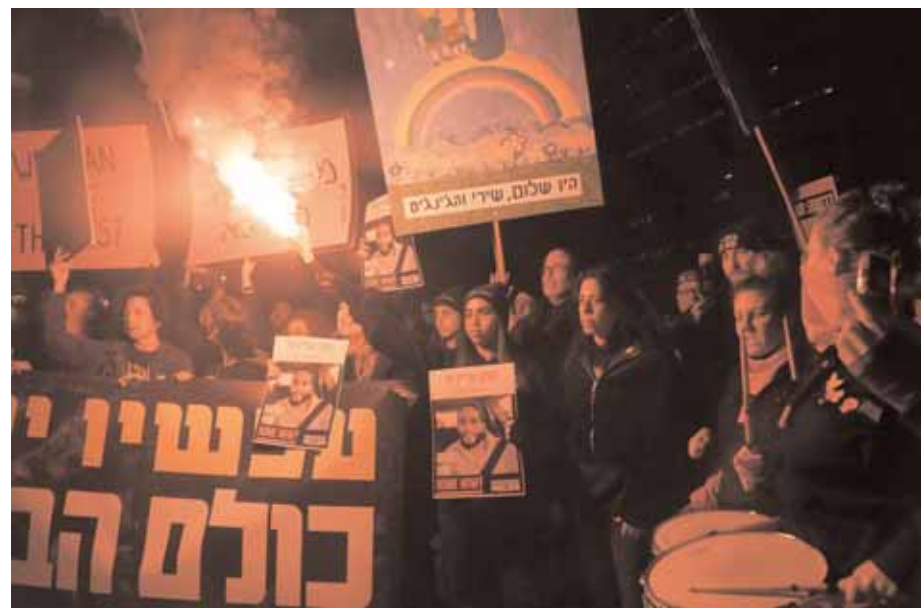
Demonstrators light a flare during a protest demanding the immediate release of hostages held by Hamas in the Gaza Strip, in Tel Aviv, Israel, on Saturday

sent tanks to the territory since 2002, in response to a deadly Palestinian uprising. The refugee camps are home to descendants of Palestinians who fled or were forced to flee during wars with Israel decades ago. Netanyahu under pressure to crack down on the West Bank: Under interim peace agreements from the early 1990s, Israel maintains control over large parts of the West Bank while the Palestinian Authority administers other areas. Israel regularly sends troops into Palestinian zones but it typically withdraws them once forces complete their missions. The UN says the current operation is the longest since the Palestinian uprising of the early 2000s. Violence has surged in the West Bank throughout the Israel-Hamas war. Israel has carried out repeated raids dur-