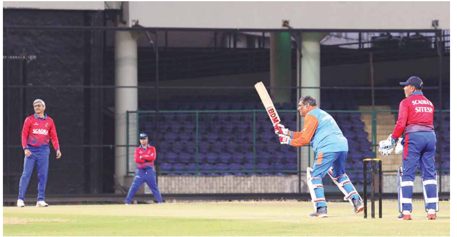
Chief Justice of India Justice Sanjiv Khanna plays a shot during a cricket match of the first SC Advocate On Records Association Vs CJI XI in New Delhi.