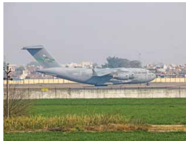
US military aircraft carrying Indian deportees upon its landing at the Shri Guru Ramdas Ji International Airport in Amritsar, on February 5