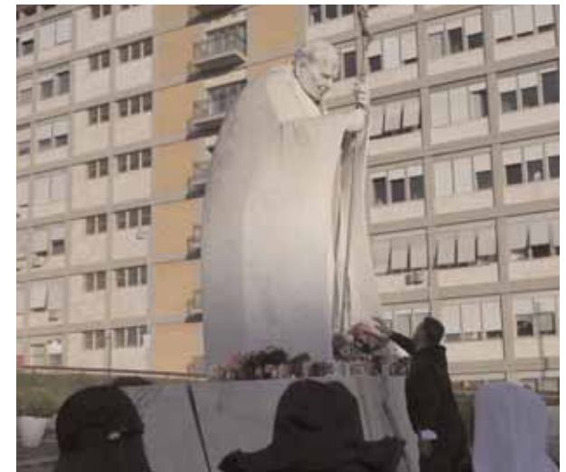
Nuns pray for Pope Francis in front of the Agostino Gemelli Polyclinic, in Rome, on Saturday