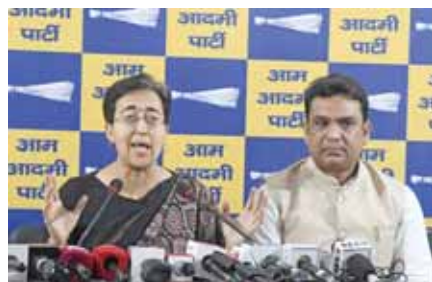
Senior AAP Leader and Former Delhi CM Atishi with MCD Mayor Mahesh Khinchi during a press conference at party headquarters