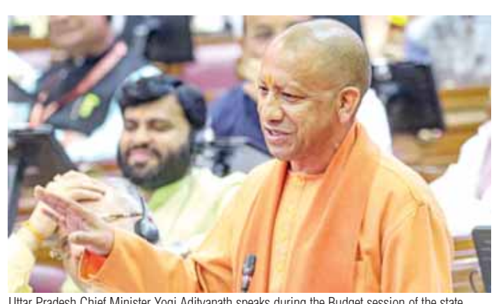
Uttar Pradesh Chief Minister Yogi Adityanath speaks during the Budget session of the state Legislative Assembly, in Lucknow

Prayagraj from January 13 to exceeding Rs 3 Lakh Crore. Sales are reported to have increased due to meticulous branding. It also proves that India's sanatan economy has deep-rooted strength, playing a significant role in the country's overall economic framework," Khandelwal added. This has provided a significant boost to Uttar Pradesh's economy and created new business opportunities. Before the commencement of the Maha Kumbh, initial estimates was projected the arrival of 40 Crore people and business transactions worth around Rs 2 Lakh Crore. According to the Uttar Pradesh government, over 53 Crore