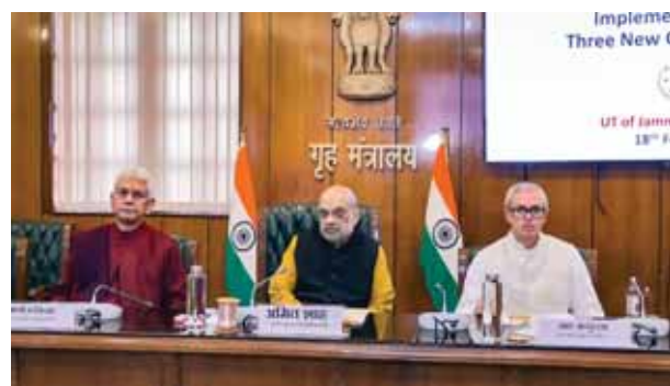
Amit Shah reviews status of the implementation of new criminal laws in Jammu and Kashmir in the presence of CM Omar Abdullah and LG Manoj Sinha, New Delhi

The Bharatiya Nyaya Sanhita, the Bharatiya Nagarik Suraksha Sanhita and the Bharatiya Sakshya Adhinyam replaced the colonial era Indian Penal Code, the Code of Criminal