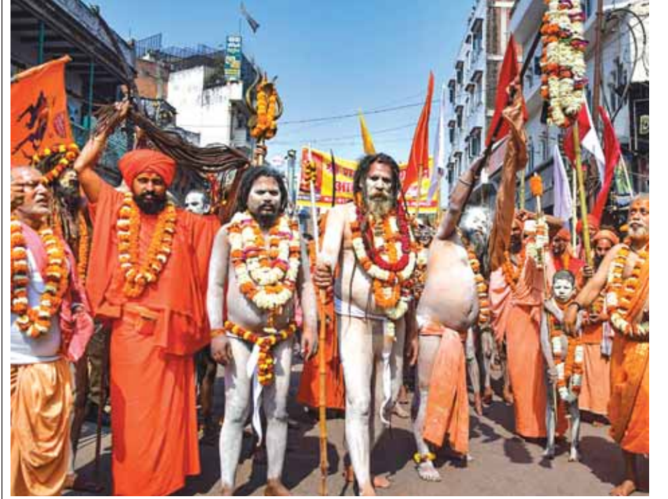
Sadhus of 'Avahan Akhara' taking part in a procession in Varanasi on Tuesday.

AWARD: The Team AVERERA from the Indian Institute of Technology (BHU) has emerged victorious at the Shell Eco-Marathon 2025, securing first place in the prestigious Carbon Footprint Reduction Award and Technical Innovation Award. The team outperformed more than 60 teams from 15 countries, making them the best in the entire Asia-Pacific and Middle East region.