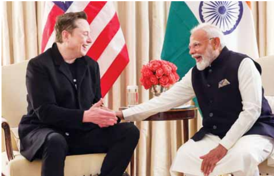
Prime Minister Narendra Modi during a meeting with SpaceX CEO Elon Musk at the Blair House, in Washington

A mailed query to confirm if the recruitments are part of the company's plans to enter the Indian market and the possible timeline for starting sales in India remained