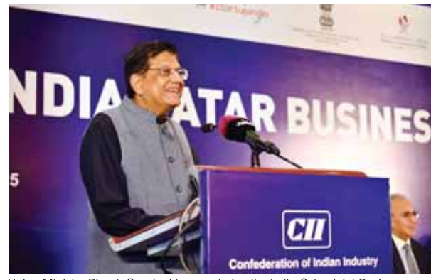
Union Minister Piyush Goyal addresses during the India-Qatar Joint Business Forum

India and the United States (US) are committed to increasing bilateral trade to $500 Billion and negotiating a "strong" trade agreement within the next six-eight months, Commerce and Industry Minister Piyush Goyal said on Tuesday. During the recent visit of Prime Minister Narendra Modi to Washington, India and the US announced to more than double the two-way commerce to $500 Billion by 2030 and negotiate the first tranche of a mutually beneficial, multi-sector bilateral trade agreement (BTA) by fall of 2025. Goyal said once his US counterpart takes charge, both countries will discuss the contours of the pact. "In the next six-eight months, by establishing a strong trade agreement, we are committed to increasing trade to $500 Billion," Goyal said on the sidelines of CII's India-Qatar Business Forum meet. He added businesses of both the countries are excited about the