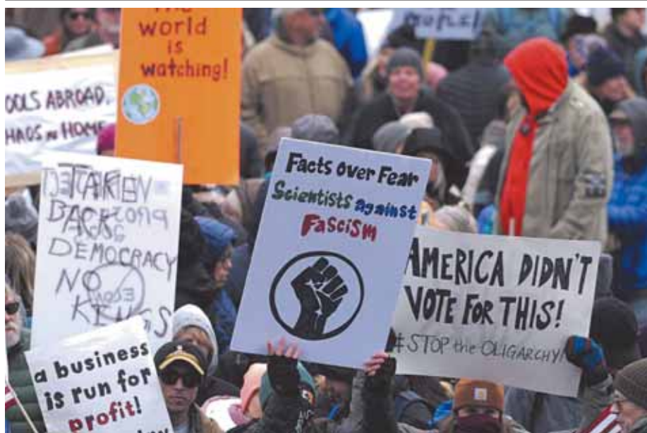
People take part in the 'No Kings Day' protest on Presidents Day in Washington, in support of federal workers and against recent actions by President Donald Trump and Elon Musk, by the Capitol in Washington. The protest was organized by the 50501 Movement, which stands for 50 Protests 50 States 1 Movement.