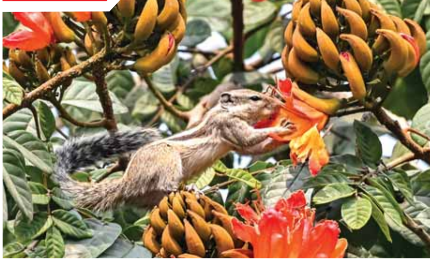
A squirrel enjoys palash flowers, in Nadia