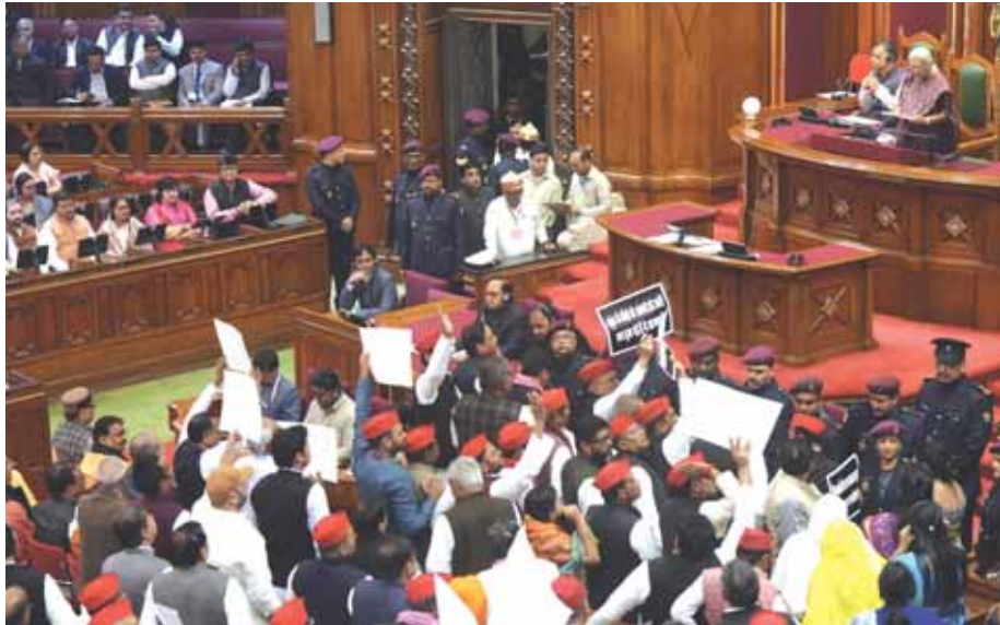
Samajwadi Party leaders protest during the joint sitting of both Houses addressed by Uttar Pradesh Governor Anandiben Patel, marking the beginning of the state Assembly Budget session in Lucknow on Tuesday.

"These efforts have created a crime and fear-free environment as the government continues to work towards realising the vision of Ram Rajya—a state of justice, peace, and good governance," she stated. The governor highlighted the achievements of 'Operation Conviction', stating that from July 2023 to December 2024, the initiative led to 51 criminals being sentenced to death, 6,287 to life imprisonment, 1,091 to over 20 years in prison, 3,868 to 10-19 years, 5,788 to 5-9 years, and 51,748 to less than five years in jail. Highlighting initiatives for women and child safety, she mentioned that campaigns such as Mission Shakti 5.0, Operation Garuda, Operation Shield, Operation Destroy, Operation Bachpan, Operation Khoj, Operation Eagle, and Operation Raksha are being carried out across the state. The governor highlighted the state's progress in connectivity, calling Uttar Pradesh the 'Expressway State' of India. She noted the operational