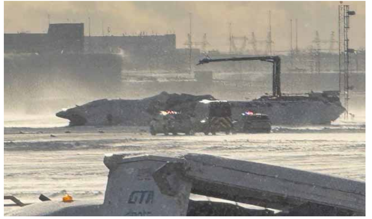
A Delta Air Lines plane heading from Minneapolis to Toronto crashed at Toronto's Pearson Airport.