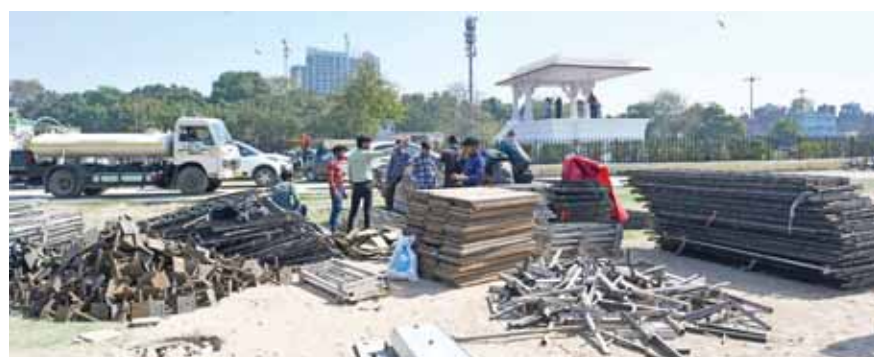
Preparations underway for the oath ceremony of the new Delhi Government, at the Ramlila Maidan