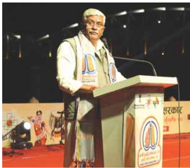
Union Minister of Tourism and Culture GS Shekhawat addressing KTS 3.0 at Namoh Ghat in Varanasi