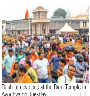
Rush of devotees at the Ram Temple in Ayodhya on Tuesday.

A drone flying amidst the crowd in the Ram temple complex in Ayodhya was brought down by the security forces. The drone had reached Gate No. 3 on Monday evening, at a time when there was a large crowd present to see Ram Lalla. According to sources, the anti-drone system shot down the drone. Following this, security personnel became alert, and a bomb squad team was called in to examine the drone. The individual responsible for flying the drone is currently being searched for. The Ayodhya police suspect that this could be part of a conspiracy to cause a stampede, as flying drones in the Ram temple area is strictly prohibited. Even airplanes are not allowed to fly over the temple. An FIR