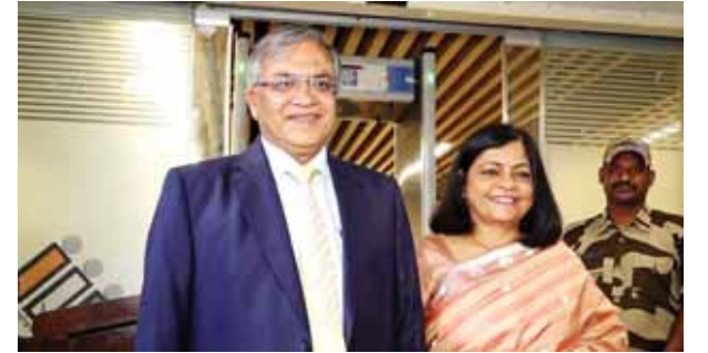
Newly appointed Chief Election Commissioner Gyanesh Kumar with his wife poses for picture at the Election Commission's office, in New Delhi

Kumar along with fellow election commissioner Sukhbir Singh Sandhu was appointed on the same day and was part of the Commission when the 2024 Lok Sabha polls were held. He is the first CEC to be appointed under a new law on the appointment of the members of the Election Commission (EC). His term will run till January 26, 2029, days