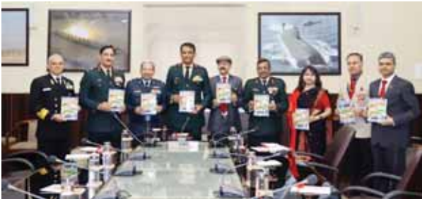
Centre for Joint Warfare Studies releases two critical publications on Contemporary Security Challenges, New Delhi