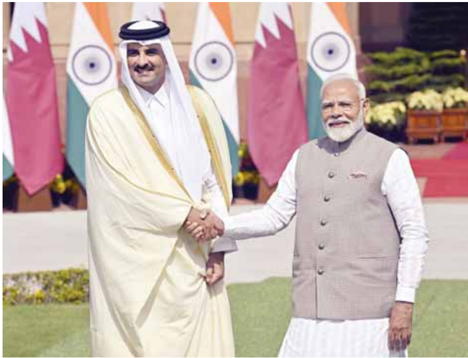
Prime Minister Narendra Modi and Amir of Qatar Sheikh Tamim Bin Hamad Al Thani shake hands before a meeting at Hyderabad House, in New Delhi, Tuesday.