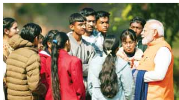
Prime Minister Narendra Modi interacts with students on different aspects of stress-free exams under Pariksha Pe Charcha programme, New Delhi

Not stressing about volume of syllabus, prioritisation of topics and revision are among the tips shared by toppers of various exams during the last episode of Prime Minister Narendra Modi's annual Pariksha Pe Charcha broadcast on Tuesday. From topper of NDA to UPSC, alumni of previous editions of Pariksha Pe Charcha shared their experience during a special session of PPC - an annual event in which Prime Minister Modi interacts with students appearing for the board examinations. In a shift from the traditional town hall format, Modi preferred a more informal setting this time and took students to Delhi's iconic Sunder Nursery for his annual interaction.