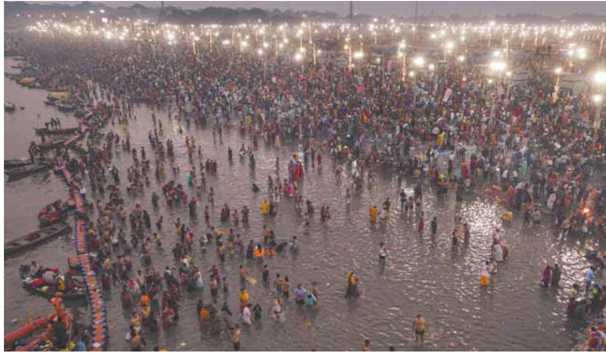
Devotees take a holy dip at Sangam during the ongoing Maha Kumbh, in Prayagraj on Tuesday

The Maha Kumbh 2025 in Prayagraj has etched its place in history, with over 55 crore devotees taking part in the holy dip at the Triveni Sangam, marking the largest participation in any religious, cultural, or social event. This extraordinary turnout is a testament to the meticulous planning of the Uttar Pradesh government under Chief Minister Yogi Adityanath, reflecting the grandeur of India's ancient spiritual traditions, an official said. India, a land of diverse faiths, is home to the largest group of Sanatan Dharma followers. According to Pew Research, India's population stands at approximately 143 crore, with 110 crore adherents of Sanatan Dharma. The turnout at the Triveni Sangam has already reached 50 per cent of India's Sanatan followers, and this number is expected to exceed 60 crore by the final bathing ritual on February 26, the official said.