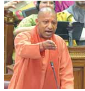
CM Yogi Adityanath speaks in the House during the Budget session of UP Assembly in Lucknow on Tuesday.

He criticised the opposition from the SP to the government's initiatives and stated, "This is the problem with you people, and you (Samajwadi Party) will oppose every good work which is in the interest of the state. This