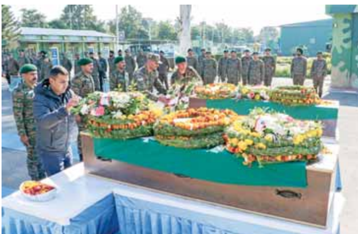
Army personnel pay tribute to soldiers who were killed in a suspected IED blast near LOC, in Jammu's Akhnoor