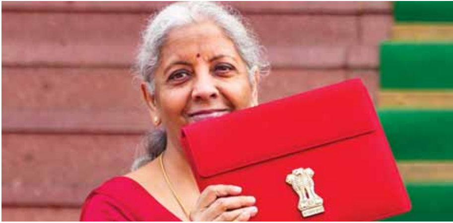
Union Finance Minister Nirmala Sitharaman at the Parliament House complex presenting the 'Union Budget 2025-26'

The new bill has omitted redundant sections, like those relating to Fringe Benefit Tax. The bill is free from