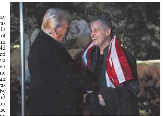
President Donald Trump greets Marc Fogel at the White House on Tuesday.

The Kremlin said Wednesday that a Russian citizen was freed in the United States in exchange for Moscow's release of American Marc Fogel. Kremlin spokesman Dmitry Peskov told reporters that the unidentified individual would return to Russia "in the coming days," and when they are in Russia, their name would be revealed. Fogel, an American history teacher who was deemed wrongfully detained by Russia, has been released and was returned to the US on Tuesday in what the White House described as a diplomatic thaw that could advance negotiations to end the war in Ukraine.