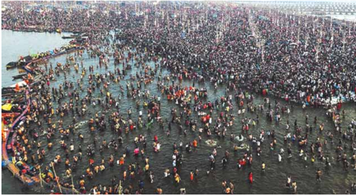
Devotees gather at the Sangam for the Maghi Purnima sacred bath during the ongoing Maha Kumbh Mela in Prayagraj on Wednesday.