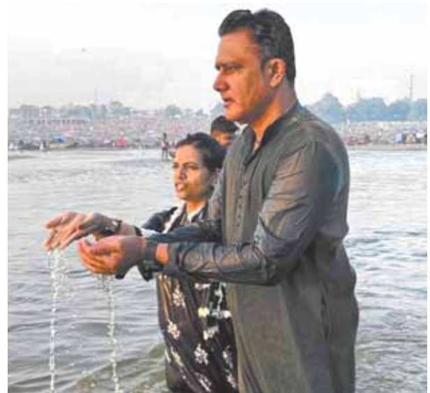
Former Indian cricket captain Anil Kumble prays after taking holy dip at the Sangam on Maghi Purnima during the ongoing Maha Kumbh Mela in Prayagraj.