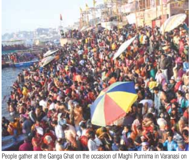
People gather at the Ganga Ghat on the occasion of Maghi Purnima in Varanasi on Wednesday

Lakhs of devotees took a holy dip in the sacred water of Ganga river on the auspicious occasion of Maghi Purnima on Wednesday. Crowds were seen at 85-odd Ganga ghats but famous ghats like Dashaswamedh, Sheetla, Ahilayabai, Man Mandir etc in the central part of this ancient city, Assi in the south and Bainsasur Ghat near Rajghat Bridge in the north, were more crowded. As huge crowds of devotees continued arriving here from Maha Kumbh in Prayagraj, this city of Dwadasa Jyotirlinga remained jam-packed throughout the day.