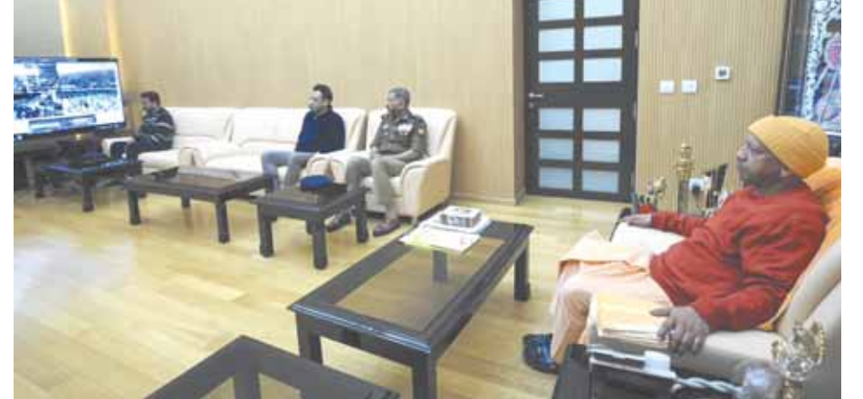
Uttar Pradesh Chief Minister Yogi Adityanath watches the Maghi Purnima Snan during the Maha Kumbh Mela on a screen from the War Room in Lucknow.