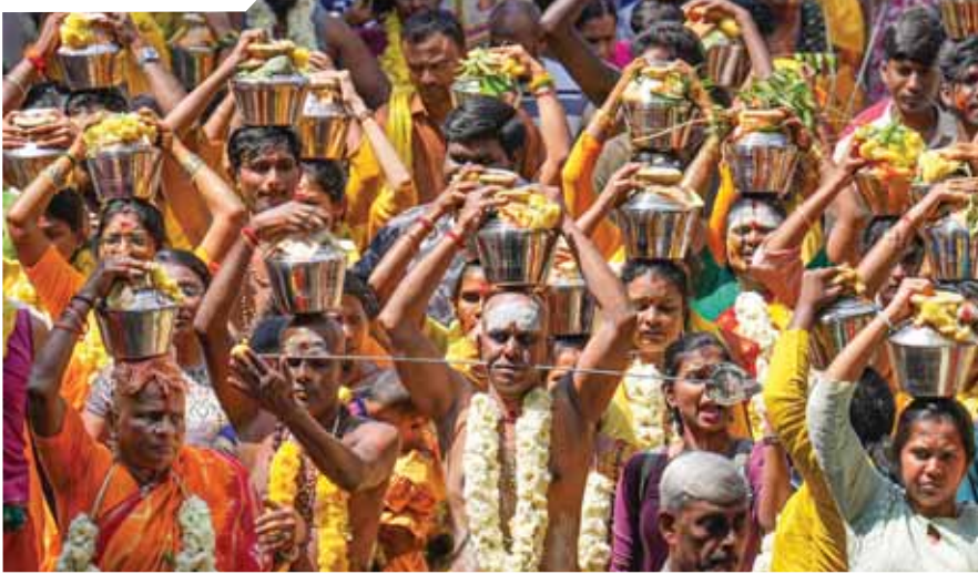
Devotees perform rituals during the Thaipusam festival at Vadapalani Murugan temple, in Chennai