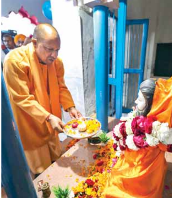
Chief Minister Yogi Adityanath pays tribute to Guru Ravidas on his birth anniversary in Lucknow on Wednesday

Chief Minister Yogi Adityanath emphasised the importance of karma while addressing a programme at Ravidas Mandir in Jafar Khera here on the 648th birth anniversary of Sant Shiromani Ravidas on Wednesday. The chief minister paid floral tributes to the revered saint's statue and highlighted his teachings on spiritual purity and dedication to work. Chief Minister Yogi stated that Satguru Ravidas attained the pinnacle of success through the practice of karma. "He gave importance to karma. Our scriptures also emphasise the significance of performing one's duty. The Bhagavad Gita states Karmanye vadhikaraste Ma Phaleshu Kadachana — one must focus on action, not its rewards. Similarly, karma determines one's destiny," he remarked.