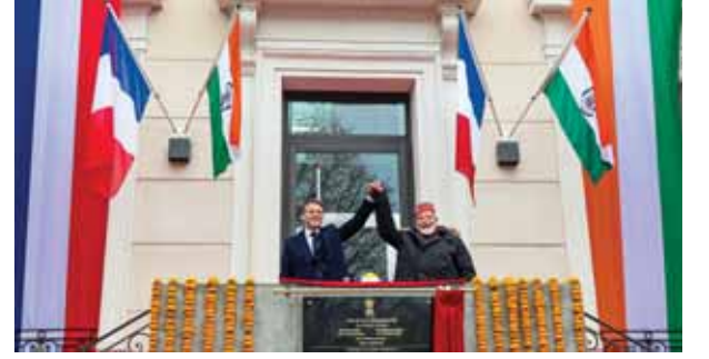
Prime Minister Narendra Modi and French President Emmanuel Macron during the inauguration of the Indian Consulate, in Marseille, France.

India and France on Wednesday expressed an intent to jointly develop modern nuclear reactors, emphasising that nuclear power was crucial for energy security and transition to a low-carbon economy. The two countries signed a letter of intent on Small Modular Reactors (SMRs) and Advanced Modular Reactors (AMRs), according to a joint statement issued after Prime Minister Narendra Modi met French President Emmanuel Macron in Paris. "Prime Minister Modi and President Macron stressed that nuclear energy is an essential part of the energy mix for strengthening energy security and transitioning towards a low-carbon economy," according to the statement. SMRs are compact nuclear fission reactors that can be manufactured in factories and then installed elsewhere. They typically have a smaller capacity than conventional nuclear reactors. The two leaders also acknowledged the strong civil nuclear ties between India and France and efforts in cooperation on the peaceful uses of nuclear energy,