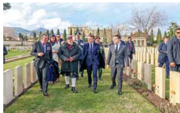
Prime Minister Narendra Modi and French President Emmanuel Macron at the Mazargues Cemetery to pay their respects to the fallen heroes, in Marseille