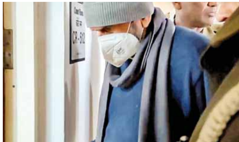
Former Congress MP Sajjan Kumar at the Rouse Avenue Court, in New Delhi