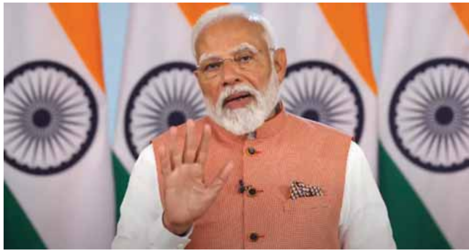
Prime Minister Narendra Modi delivers his remarks via video conferencing during inauguration of India Energy Week

important part of India's energy ambitions," Modi told investors. He further said, "All experts are saying that 21st century is India's century. Bharat is not only driving it is own growth but driving global growth." India's energy ambitions, he said, are based on five pillars. "We have resources, which we are harnessing. We are encouraging our brilliant minds to innovate. Thirdly, we have economic strength and political stability," he said. Also, he said, India has strategic geography, which makes energy trade easier and more attractive. Besides, India is committed towards global sustainability and this is aiding new possibilities in the country's energy sector, the prime minister said. For Viksit Bharat, the next two decades are very crucial, he said, adding that in the next five years we will cross many