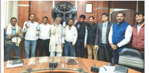
The beneficiaries of e-lottery at Vikas Bhawan in Varanasi on Tuesday.