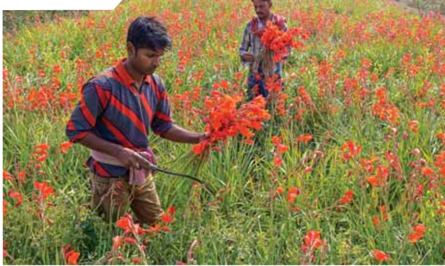
Farmers pluck Gladiolus flowers at an orchard, in Nadia