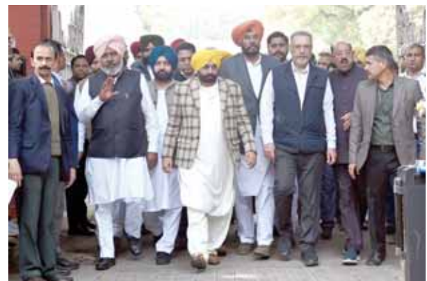
Punjab CM Bhagwant Mann with AAP MLAs talks to the media after a meeting at the Kapurthala House.

Amidst reports of exodus of MLAs, Aam Aadmi Party (AAP) convener Arvind Kejriwal met Punjab chief minister Bhagwant Mann and 91 state MLAs in Delhi on Tuesday and dismissed speculation of internal discord within the party stating that "all is well" in the party. After the meeting, which lasted for about an hour, Mann and other leaders outright rejected the possibility of Kejriwal becoming the Chief Minister of Punjab and about 35 MLAs in Punjab breaking away and joining the Congress. "Our MLAs arrived here for a meeting with party national convener Arvind Kejriwal, who expressed his gratitude for their efforts in campaigning during the Delhi Assembly elections," the chief minister said. He said the party accepts the verdict of the people in the Delhi Assembly elections while praising the AAP's 'Delhi model' of governance. The meeting sent out a strong signal about there being no threat to the party's government in Punjab amid claims by the rival Congress about a brewing discontent