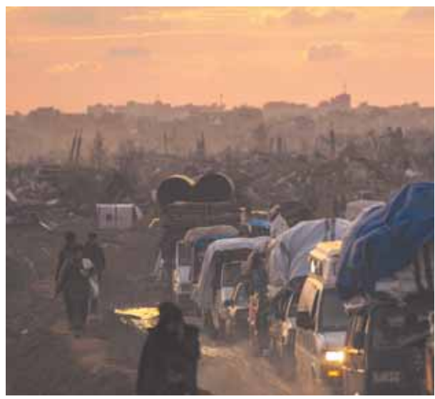
Displaced Palestinians, travelling in vehicles, wait in line to pass through a security checkpoint at the Netzarim corridor as they make their way from central Gaza to their homes in the northern Gaza Strip, on Monday.

Hamas has brushed off President Donald Trump's threat that "all hell" will break out if it does not release the remaining Israeli hostages held in the Gaza Strip by Saturday. Hamas spokesman Sami Abu Zuhri said Tuesday that the dozens of hostages would only be returned if all parties remain committed to a ceasefire deal reached last month. "Trump must remember there is an agreement that must be respected by both parties," he said, adding that threatening language only complicates matters. Hamas has threatened to delay the next release of three Israeli hostages, due Saturday, accusing Israel of violating the ceasefire agreement, including by not allowing a surge of tents and shelters into the devastated territory. While Trump said the ceasefire should be cancelled if Hamas doesn't release all the remaining hostages Saturday, he also said such a decision would be up to Israel. During the first phase of the ceasefire, Hamas has com-