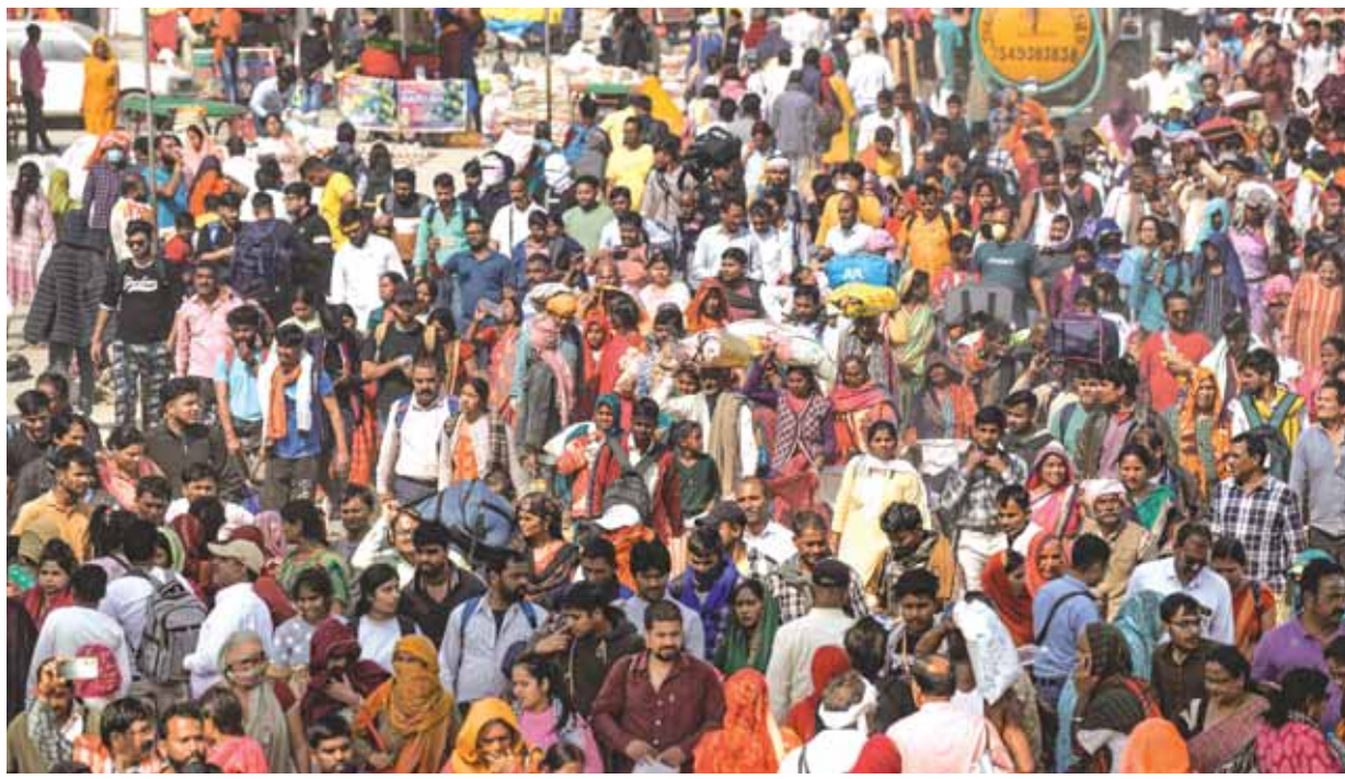
UNPRECEDENTED DEVOTION: Rush of devotees on Tuesday on the eve of Maghi Purnima during the ongoing Maha Kumbh Mela in Prayagraj