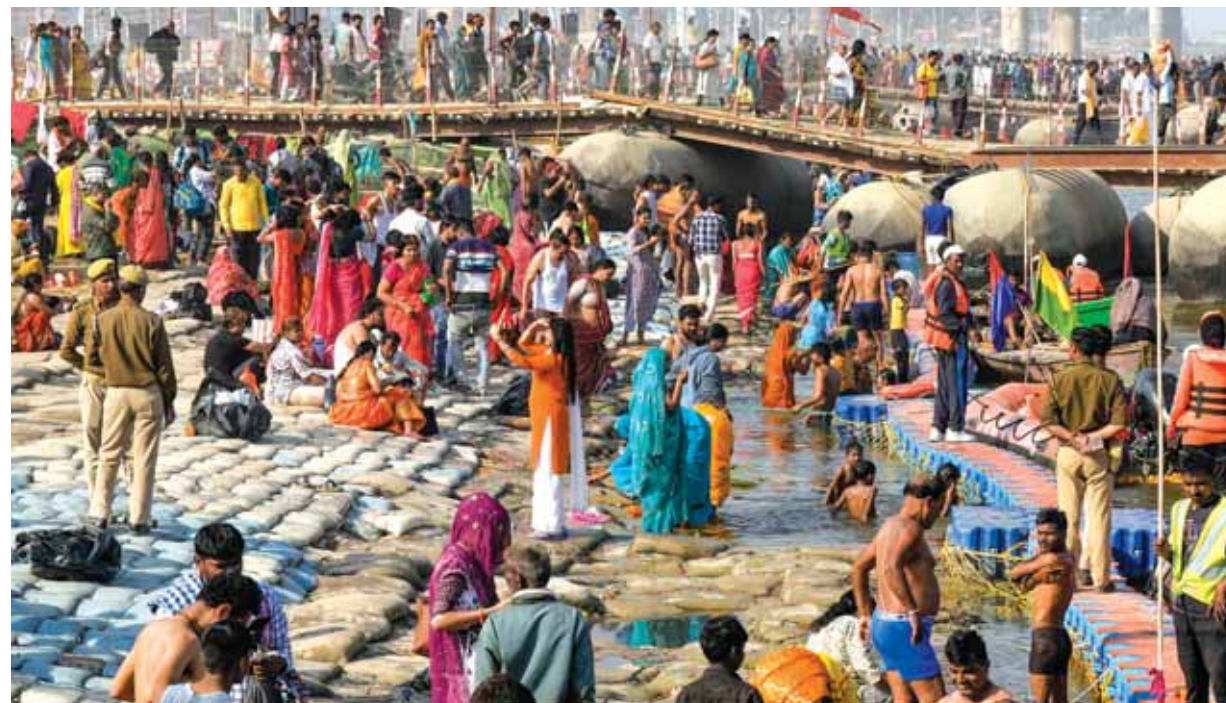
Devotees at Sangam on Tuesday on the eve of Maghi Purnima during the ongoing Maha Kumbh Mela in Prayagraj