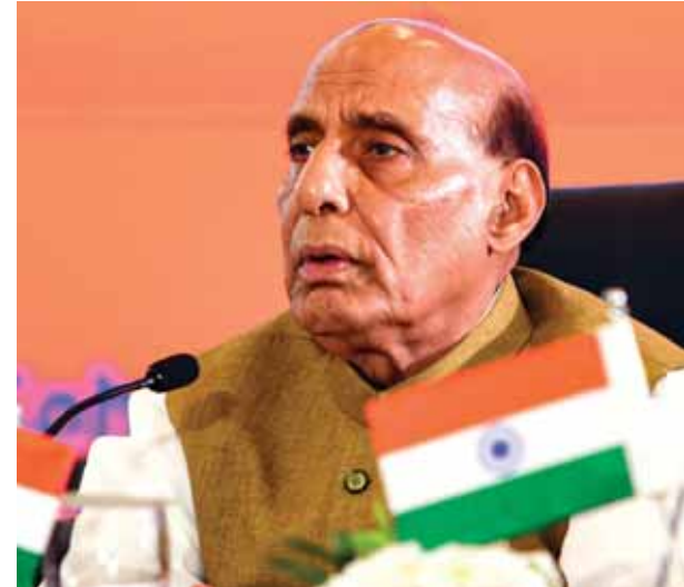
Union Minister for Defence Rajnath Singh addresses the Defence Ministers' Conclave 'Bridge' at Aero India, in Bengaluru

"It is my firm belief that the evolving global security scenario demands innovative approaches and stronger partnerships. India's engagements in the global stage exemplifies our commitment to fostering security and growth for all," he added. According to officials, the Defence Ministers' Conclave, organised in hybrid mode, is aimed at strengthening defence cooperation with friendly nations amidst a rapidly-evolving global security landscape, and this year's theme 'Building Resilience through International Defence and Global Engagement (BRIDGE)' underscores the importance of supply chain resilience and strategic collaboration in defence. Officials had earlier said that representatives from more than 80 countries were likely to participate in the conclave and around 30 defence ministers in addition to defence, service chiefs and permanent secretaries from friendly nations would attend the event. Reiterating India's conviction on being strong to ensure peace, the defence minister said, "We have been working very hard, to bring about a transformation in our defence