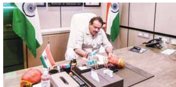
Minister of state for Panchayati Raj S P Singh Baghel

Minister of State for Panchayati Raj S P Singh Baghel will release the comprehensive Devolution Index Report on panchayats in the country on Thursday. It will provide insights into the progress of decentralisation across states and Union Territories, the ministry said on Tuesday. The Panchayati Raj Ministry in a statement issued here said the report titled "Status of Devolution to Panchayats in States - An Indicative Evidence Based Ranking 2024", will be released by the Minister on February 13. The ministry said it marks a milestone in India's journey towards empowering Panchayati Raj Institutions (PRIs) and realizing the vision of "Local Self Government" of the 73rd