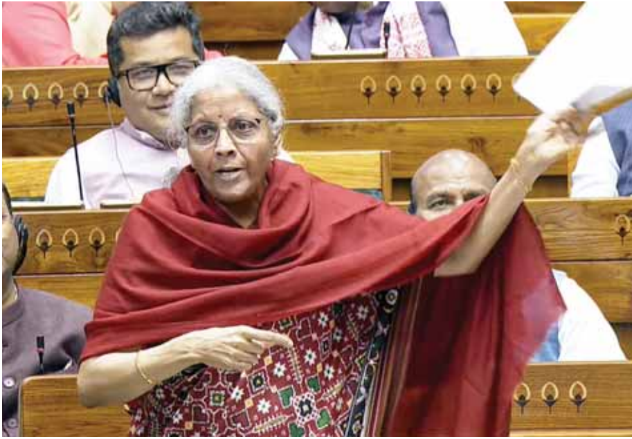
Finance Minister Nirmala Sitharaman speaks in the Lok Sabha during the Budget session of Parliament, in New Delhi

Finance Minister Nirmala Sitharaman on Tuesday said that the Indian economy is seeing a "speedy rebound" from 5.4 per cent growth clocked in the second quarter of the current fiscal, and the government shall take measures to ensure that India remains the world's fastest-growing economy. Replying to discussions on the Union Budget for 2025-26 in the Lok Sabha, the finance minister said the Budget has taken various steps to increase liquidity in the hands of people while maintaining fiscal prudence by using 99 per cent of the borrowing in FY26 to fund capital expenditure. She also said that inflation management receives the highest priority of this government with retail inflation within the tolerance band of 2-6 per cent. Inflation trend, particularly in food, appears to be moderating, she added. Speaking about GDP growth, Sitharaman said in the three years prior to 2024-25, the country's GDP growth rate averaged about 8 per cent. The Indian economy is projected to grow at 6.4 per cent in the current fiscal - the lowest pace in four years. The Finance Ministry's Economic Survey has projected growth in next fiscal FY26 to be between 6.3 per cent to 6.8 per cent.