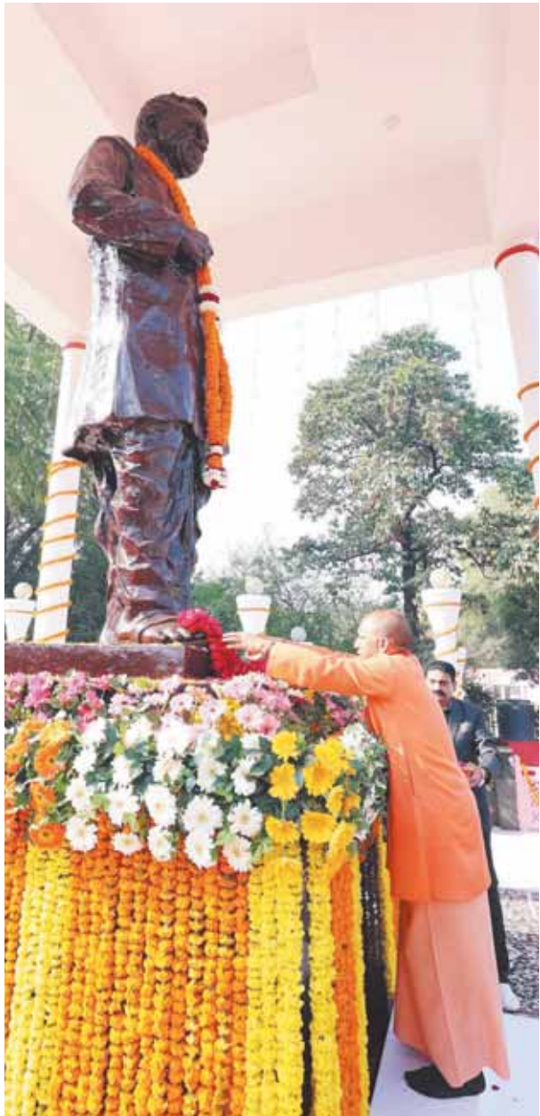
Chief Minister Yogi Adityanath pays floral tribute to Deendayal Upadhyay on his 57th death anniversary, in Lucknow on Tuesday

Uttar Pradesh Chief Minister Yogi Adityanath on Tuesday said that some people are trying to spread confusion by linking the Maha Kumbh to VIP bathing, but the truth is that it is a confluence of harmony and faith where devotees join hands by removing the barriers of caste, religion, language and region. Addressing an event to mark the 57th death anniversary of Deendayal Upadhyay, Adityanath said, "Who are these people spreading negativity? These are the same people who took VVIP treatment from the government throughout their lives and tried to pave a path for their future generations. These are people who stand against India and Sanatan Dharma by creating negativity and spreading false propaganda." The chief minister's remarks came amid opposition leaders accusing the Uttar Pradesh government of "mismanagement" and "VIP culture" after at least 30 devotees were killed in a pre-dawn stampede in Prayagraj on January 29. To mark the occasion, Adityanath paid floral tributes to Upadhyay and underlined the relevance of his thoughts, the Uttar Pradesh government said in a statement. "In Prayagraj, 45 crore devotees