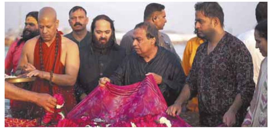
Reliance Industries Chairman Mukesh Ambani with his son Anant Ambani takes a holy dip during the Maha Kumbh Mela at the Sangam in Prayagraj on Tuesday