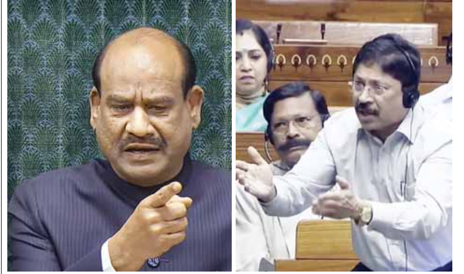
Lok Sabha Speaker Om Birla and DMK MP Dayanidhi Maran during the Budget session of Parliament, in New Delhi