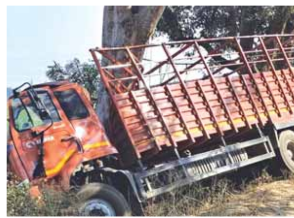
An uncontrolled DCM rammed into a tree in Paras, Ghatampur, early on Tuesday morning.