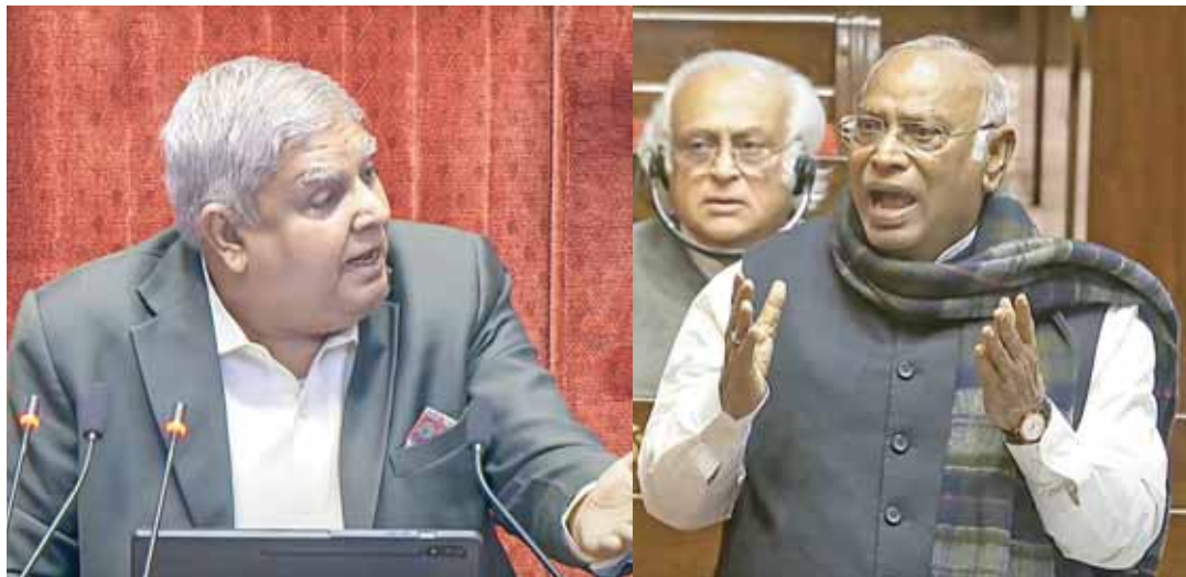
Leader of Opposition Mallikarjun Kharge speaks in the Rajya Sabha as Chairman Jagdeep Dhankhar looks on during Budget session of Parliament, in New Delhi, Tuesday

categorical, the Constitution signed by the founding fathers of the Constitution, carrying 22 miniatures, is the only authentic one and it can include amendments by the Parliament. If there is any change effected by judiciary or any institution, it is not acceptable to this House. "I will appeal to the Leader of the House to ensure that in the country only the authentic version of the Indian Constitution be promulgated. Any violation of this should be taken quite seriously by the government and severe action taken," the Chairman said in the House. Kharge was first given the floor to speak on the issue, who alleged that the BJP was unnecessarily raising the issue to create a controversy. "They are unnecessarily raising the issue and want to create a controversy on Ambedkar's Constitution. They never raised this issue when Ambedkar, Patel, others were alive...Now they are bringing new