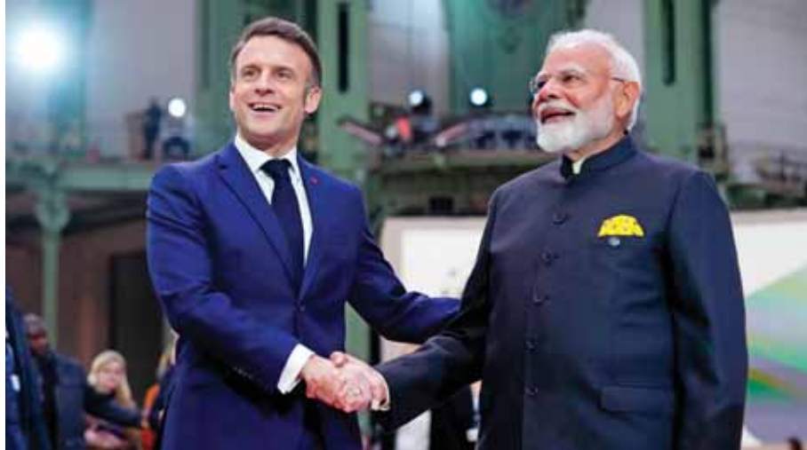
French President Emmanuel Macron shakes hands with India's Prime Minister Narendra Modi as they arrive to the Artificial Intelligence Action Summit at the Grand Palais in Paris, France

Prime Minister Narendra Modi on Tuesday made a strong case for collective efforts to establish a global framework for artificial intelligence (AI) based on open source which enhances trust, transparency and is free from biases. Co-chairing the AI Action Summit along with French President Emmanuel Macron here, Modi said that AI is changing the polity, economy, security and society, and is writing the code for humanity in this century. Modi also offered to host the next AI Action Summit in India, supporting the decision taken at the first summit hosted by France to set up the 'AI Foundation' and the 'Council for Sustainable AI'. "There is a need for collective global efforts to establish governance and standards that uphold our shared values, address risks and build trust," Modi said, adding that governance is not just about managing risks and rivalries but is also about promoting innovations and deploying them for global good. "We must democratise technology and create people-centric applications. We must address concerns related to cyber security, disinformation and deep fakes," the Prime Minister said. Stressing on the need to develop quality data sets free from biases, the Prime Minister said there is a need to develop open-source AI ecosystems that enhance trust and transparency. He said the technology should be rooted in the local ecosystem for it to be effective and useful. Modi started his address with