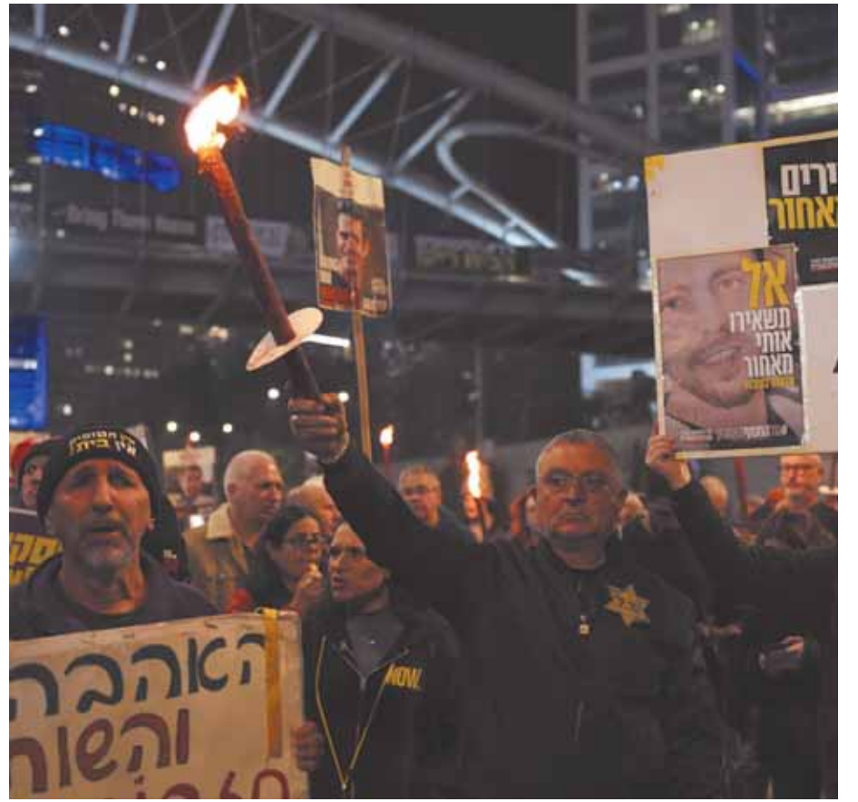
Relatives of hostages, held by Hamas in the Gaza Strip, protest outside of Israel's Ministry of Defense in Tel Aviv, Israel, on Monday after the militant group announced it would delay hostage releases in the Gaza Strip after accusing Israel of violating a fragile ceasefire.