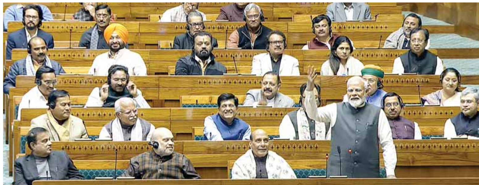
Prime Minister Narendra Modi replies to the Motion of Thanks to President's address in the Lok Sabha during the Budget session of Parliament, in New Delhi