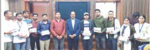
Tablets provided to DAV PG College students on Tuesday under the Digi Shakti scheme of the Uttar Pradesh government.