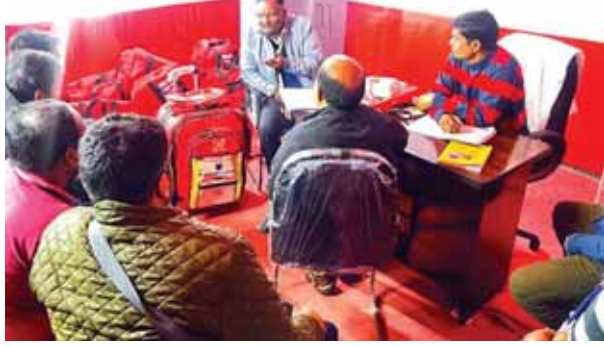
Doctors examining Kumbh pilgrims at NER observation room at a station on Tuesday.

During Maha Kumbh-2025, Varanasi Division of North Eastern Railway (NER) has made arrangements to provide special medical facilities round-the-clock in observation rooms at Prayagraj Rambag and Jhusi railway stations to ensure health safety of pilgrims. Railway personnel are dedicatedly engaged in service to provide quick medical assistance to the pilgrims coming to Maha Kumbh at Prayagraj Rambag and Jhusi railway stations of Varanasi Division of NER. In this sequence, on Tuesday, medical facilities were provided to 278 fair travellers at the observation room and first aid centres located at Jhusi, while two fair travellers were referred to local hospitals. Similarly, medical facilities were provided to 263 fair passengers at the observation room and first aid centres located at Prayagraj Rambag, Public Relations