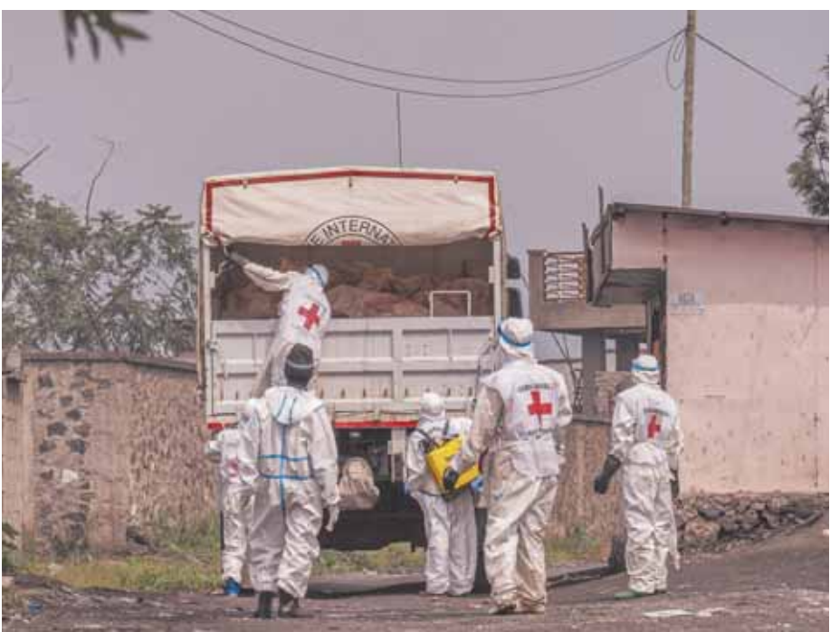
Red Cross personnel load bodies of victims of the fighting between Congolese government forces and M23 rebels in a truck in Goma, Democratic Republic of Congo, Monday as the U.N. health agency said 900 died in the fight.

third country" agreement with El Salvador that would allow for non-Salvadorean migrants in the US to be deported to El Salvador.