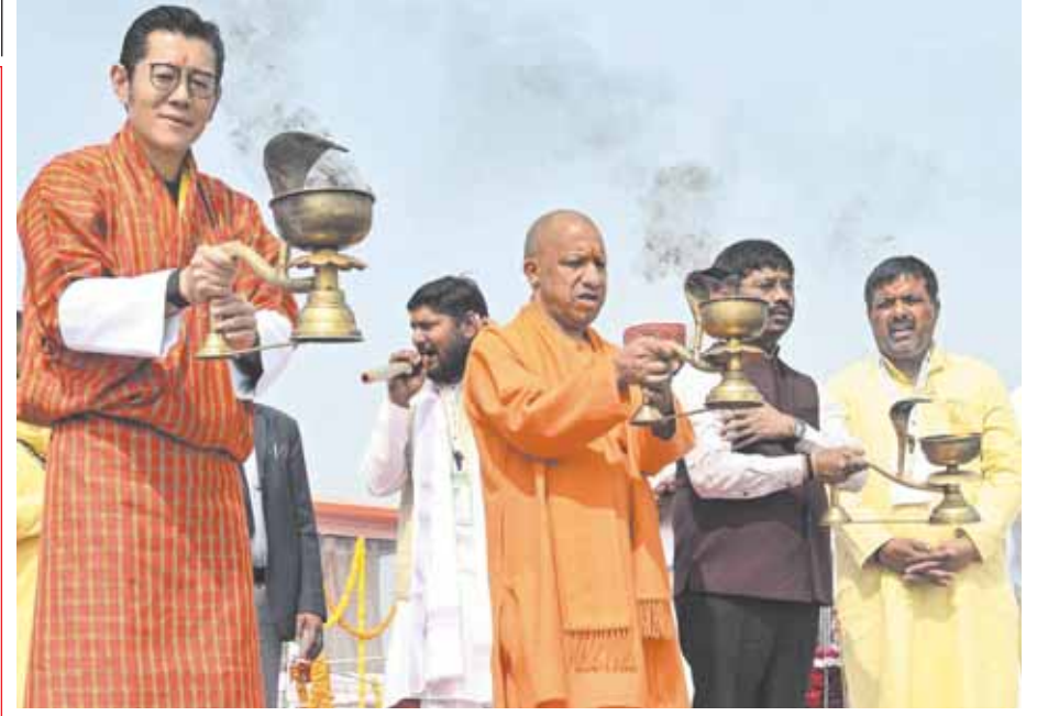
Uttar Pradesh Chief Minister Yogi Adityanath and Bhutan's King Jigme Khesar Namgyel Wangchuck perform rituals at Sangam during the ongoing Maha Kumbh Mela, in Prayagraj and take holy dip