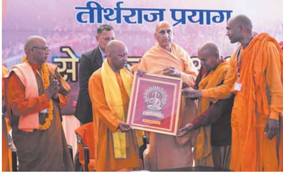
Chief Minister Yogi Adityanath at the Baudh Mahakumbh Yatra during Maha Kumbh Mela in Prayagraj