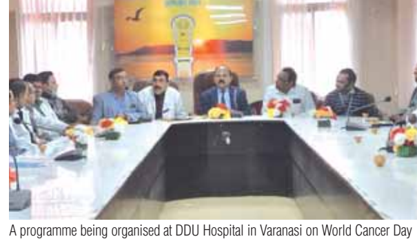
A programme being organised at DDU Hospital in Varanasi on World Cancer Day on Tuesday