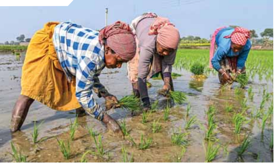
Labourers plant paddy saplings in a field, in Nadia