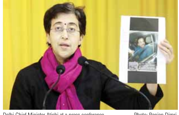
Delhi Chief Minister Atishi at a press conference