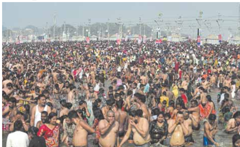
Devotees take a holy dip at Sangam during the Maha Kumbh in Prayagraj on Tuesday

In response to this massive influx, the Prayagraj Railway Division strategically operated both regular and special trains, ensuring seamless travel for pilgrims. Special trains were run in a direction-wise manner, with services from Prayag and Phaphamau stations catering to travellers heading towards Lucknow and Rae Bareilly, while Rambagh and Jhansi stations managed routes towards Varanasi.