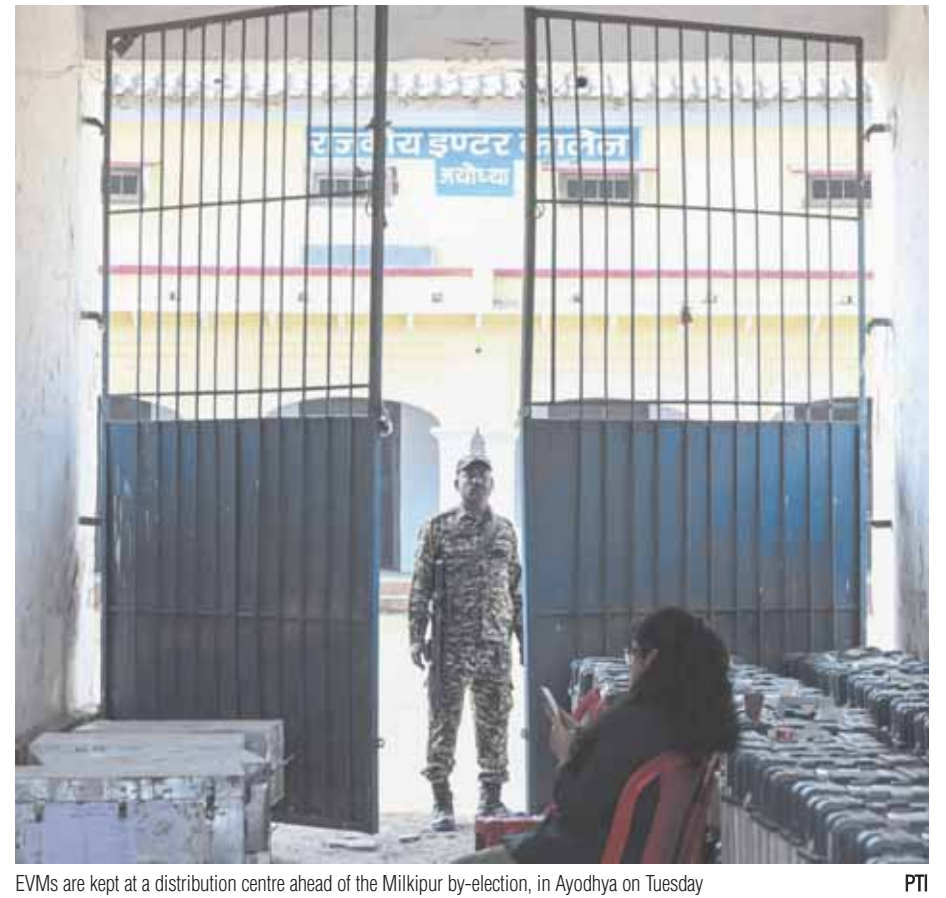
EVMs are kept at a distribution centre ahead of the Milkipur by-election, in Ayodhya on Tuesday

criticised the SP for opposing Ayodhya's development, while the BJP's state chief mocked Akhilesh for never having visited Ayodhya. In turn, Akhilesh ridiculed Yogi, accusing him of being a saint only in appearance, not in action.