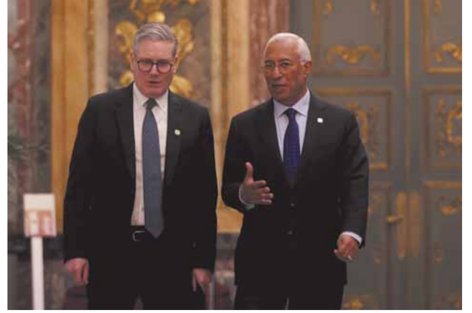
Britain's Prime Minister Keir Starmer, left, speaks with European Council President Antonio Costa as he arrives for an EU summit at the Egmont Palace in Brussels, Monday.

on the fact "that everybody has to respect the sovereignty of all national states in the world, and that Greenland is today a part of the Kingdom of Denmark. It's part of our territory and it's not for sale." European Council President Antonio Costa, noting that the EU has stood beside Ukraine in defense of its borders, said of Greenland: "Of course, we will stand also for these principles, all the more so if the territorial integrity of a member state of the European Union is questioned." Frederiksen acknowledged US concerns about security in the Arctic Region, where Russia and China have been increasingly active. "I totally agree with the Americans that the High North, that the Arctic region is becoming more and more important when we are talking about defense and security and deterrence," Frederiksen said.