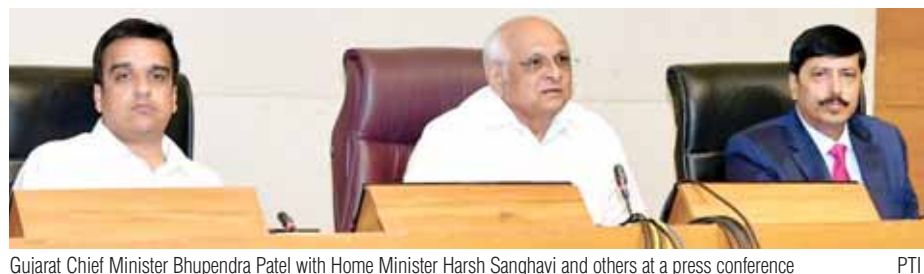
Gujarat Chief Minister Bhupendra Patel with Home Minister Harsh Sanghavi and others at a press conference