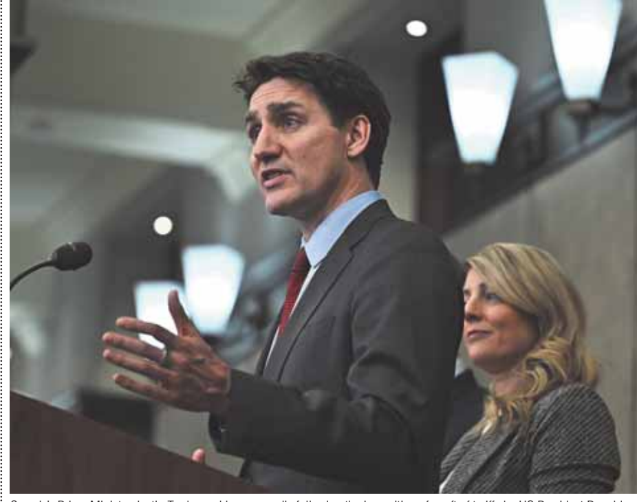
Canada's Prime Minister Justin Trudeau addresses media following the imposition of a raft of tariffs by US President Donald Trump against Canada, Mexico and China, in Ottawa on Saturday

'You're worried about grocery prices. Don's raising prices with his tariffs," Senate Democratic Leader Chuck Schumer of New York posted on X. "You're worried about tomato prices. Wait till Trump's Mexico tariffs raise your tomato prices. ... You're worried about car prices. Wait till Trump's Canada tariffs raise your car prices," he wrote in a series of posts.