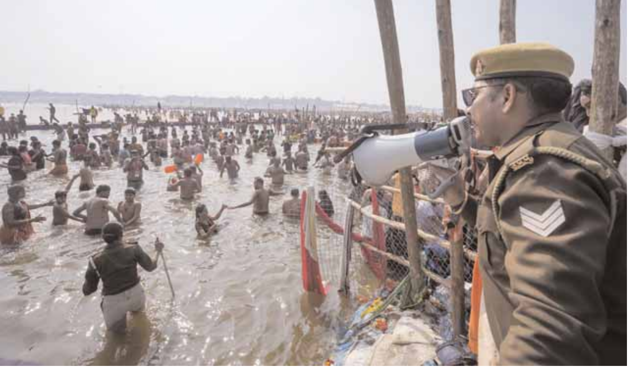
A police official manages a crowd of devotees taking a holy dip at Sangam on 'Basant Panchami', during the ongoing Maha Kumbh in Prayagraj on Sunday

security monitoring. This strategic security overhaul designated routes in South aims to facilitate a seamless and