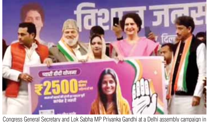
national Capital on Sunday. Delhi goes to polls on Wednesday

Members of Opposition parties under the INDIA bloc has claim that about 63 election petitions have been filed across various benches of the Bombay High Court