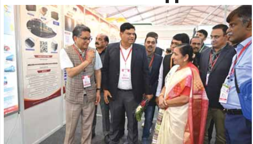
Union Minister of State for Consumer Affairs, Food & Public Distribution Nimuben Jayantibhai Bambhania at BLW Pavilion in Raikot on Sunday