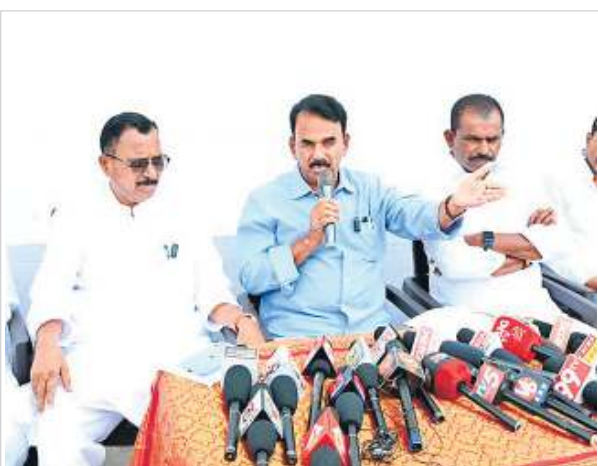
Excise Minister Jupally Krishna Rao speaking to reporters in Wanaparthy on Thursday

On the SLBC Tunnel accident, the Minister informed that 11 agencies, including the