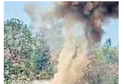
Black smoke rising from defused IED allegedly being planted by Maoist

Security forces defused a 5kg improvised explosive device (IED), allegedly planted by Maoists in the Sukma district of Chhattisgarh, bordering the Bhadradi Kothagudem district. The alertness of the security forces averted a major disaster. On the Kunta-Golapalli road, the police discovered and defused a 5 kg IED bomb. Maoists had allegedly planted the bomb targeting the security forces on the Kunta-Golapalli road in Sukma district. However, the CRPF 228 Battalion and district police responded promptly, identified the bomb, and defused it at the site. After the incident, the police launched an extensive combing opera-