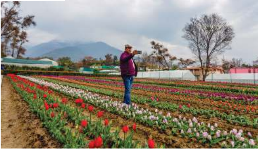
A visitor takes a selfie at Institute of Himalayan Bioresource Technology Tulip Garden, in Palampur