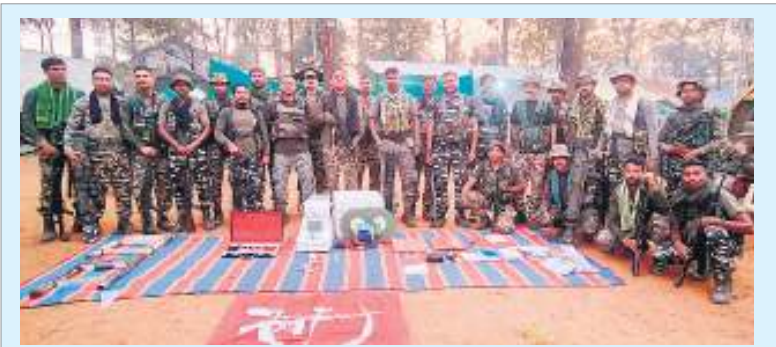
Security forces with medical equipment seized from Maoist dump in Bhadradi Kothagudem district on Thursday

The government will determine the fee based on land costs, and the concession will apply if the realtor acts promptly. In Nirmal district, which comprises three municipalities—Nirmal, Bhainsa, and Khanapur—and 18 rural mandals, a total of 26,487 applications for layout regularisation have been submitted in the municipalities, alongside 18,483 applications from the rural mandals. Site owners have paid registration fees of Rs 1,000 for plots and Rs 10,000 for layouts. Three months ago, government officials conducted field inspections of the sites and layouts seeking regularization. However, the review of applications has been sluggish due to a lack of coordination among officials, insufficient personnel, and the ongoing MLC election activities. The fee concession is expected to facilitate the process.