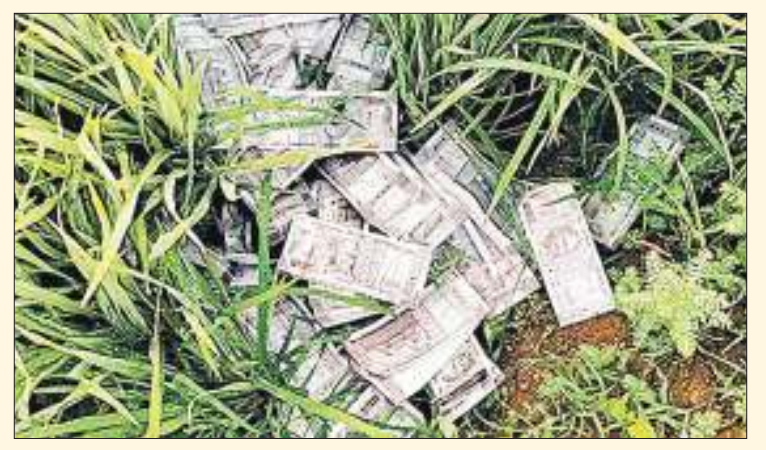
Fake currency abandoned in an agricultural field at Bothalpallem village in Nalgonda district