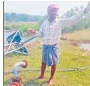
A farmer pouring out his grievances over damaged pipeline leading to withering of crops at Vaddipet in Bhadradi Kothagudem district

During the previous BRS government, a pipeline was constructed through the Mission Bhagiratha scheme to provide drinking water. However, during the pipeline installation, the main pipeline that supplied water from the Taliperu lift irrigation system to the farmers' fields was dam-