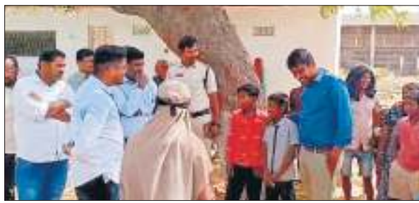
Labour Department officials with rescued child labourers at Mittapalle village in Siddipet district on Monday

ment was given a week's time to carry out the task. Otherwise, action would be taken against the management.