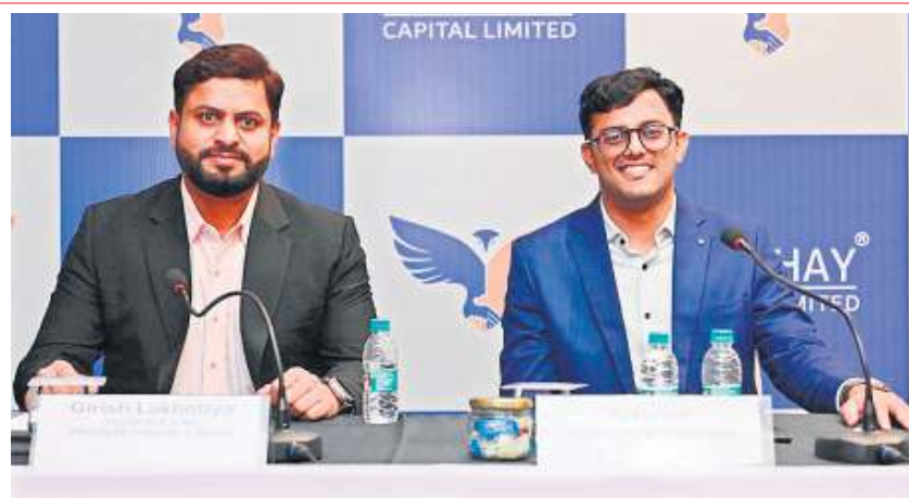
Prachay Capital Limited, an RBI-registered Non-Banking Financial Company – Investment and Credit Company (NBFC-ICC), has announced the public issue of Secured, Rated, Redeemable Non-Convertible Debentures (NCDs) to raise up to Rs 100 Crore. The issue will open on 28 February 2025 and close on 13 March 2025.