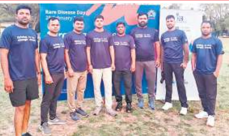
The Organization for Rare Diseases India (ORDI), supported by Novo Nordisk India, successfully hosted the 10th edition of the "Race for 7" Awareness Run across 21 cities in India to commemorate Rare Disease Day. People living with rare diseases, caregivers, healthcare professionals, and policymakers came together to advocate for better healthcare access for individuals affected by these conditions.