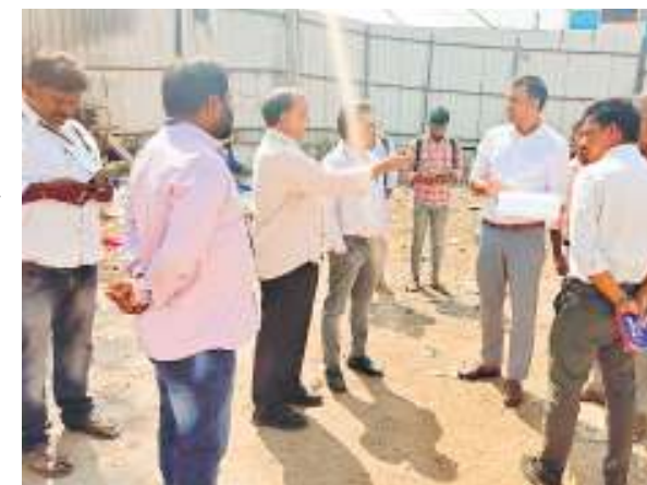
Greater Hyderabad Municipal Corporation (GHMC) officials in spot visit for parking facility near Charminar

In light of these challenges, MP Asaduddin Owaisi has urged the immediate commencement of the parking