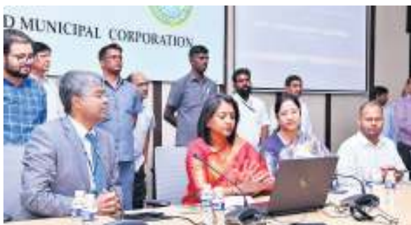
GHMC Mayor Gadwal Vijayalakshmi and GHMC Commissioner Ilambarathi launch the training for Build Now application

Speaking at the programme, Mayor Vijayalakshmi emphasised that the FDSS technology will simplify and expedite the construction approval process. She stated that through 'Build Now', city residents can apply for building permissions online and receive approvals quickly. The system will enhance transparency and benefit citizens, government officials, architects and engineers. The initiative ensures all necessary permissions are