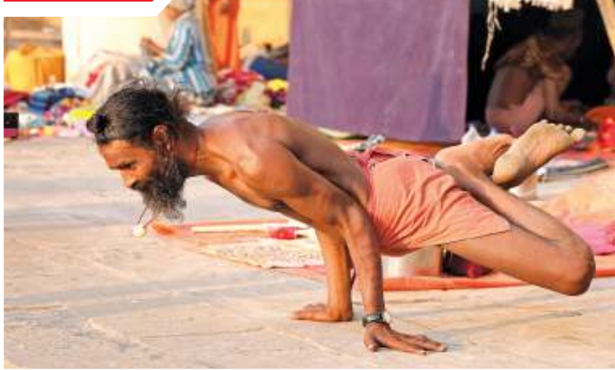
A sadhu performs a yogasana at a Ganga ghat, in Varanasi