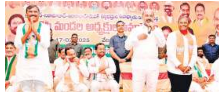
Union Minister of State for Home Affairs Bandi Sanjay Kumar addressing the MLC election campaign meeting at Karimnagar on Monday