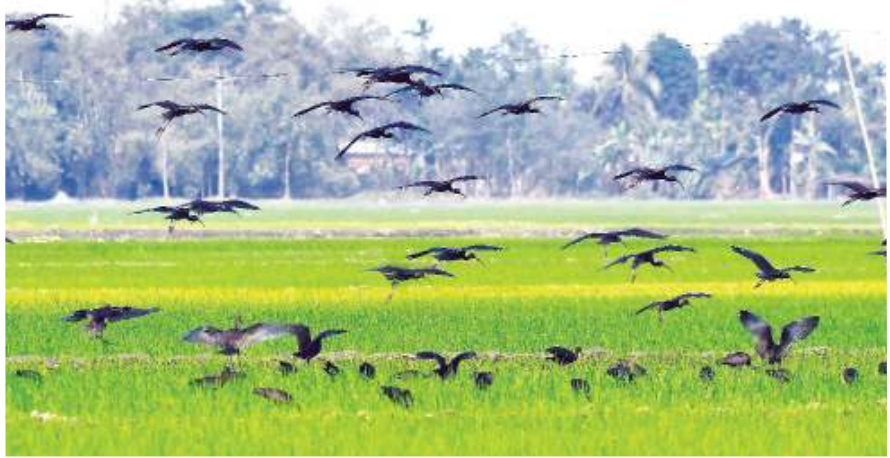
A flock of ibis flying over a paddy field, in Nagaon