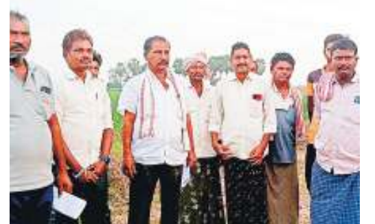
Farmers staging a protest at Khajipuram village under Madhira mandal in Khammam district on Monday

Farmers demanded that highway works should continue only after compensation is paid to them. They stated that it is the government's and the concerned NHAI (National Highways