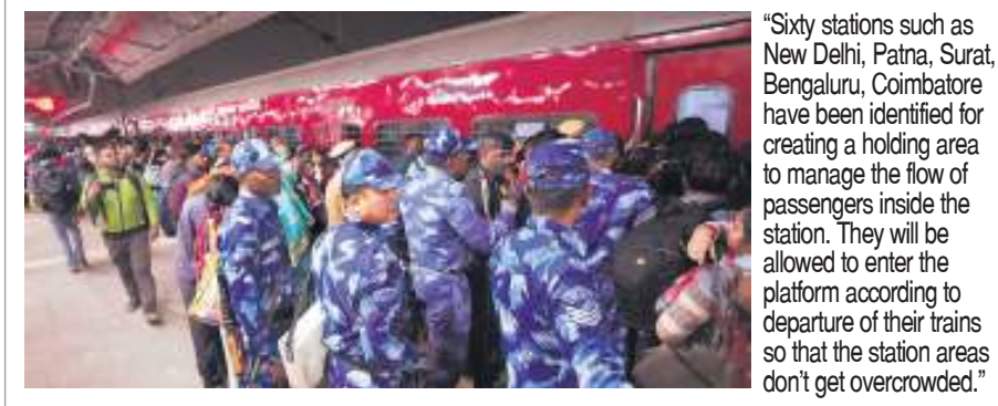
"Sixty stations such as New Delhi, Patna, Surat, Bengaluru, Coimbatore have been identified for creating a holding area to manage the flow of passengers inside the station. They will be allowed to enter the platform according to departure of their trains so that the station areas don't get overcrowded."

Interacting with mediapersons at the Rail Bhawan here, Vaishnaw said the Railways has identified 60 stations which normally receive a high footfall and decided to make permanent or temporary holding areas outside the platforms to regulate the flow of passengers to the stations. "Sixty stations such as New Delhi, Patna, Surat, Bengaluru, Coimbatore have been identified for creating a holding area to manage the