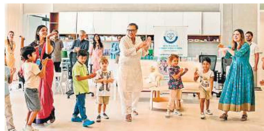
Patricia Scotland, Secretary-General of the Commonwealth Nations, at the Heartfulness International School in Kanha Shanti Vanam on Monday