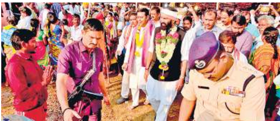
Irrigation Minister N Uttam Kumar Reddy at Peddagattu Jatara at Durajpally in Suryapet district on Monday

The Peddagattu Jatara, also known as Gollagattu Jatara, is Telangana's second-largest religious congregation after the Medaram Sannammas-Saralamma Jatara. Held once every two years, this five-day festival is of great spiritual significance, particularly for the Yadava community, which worships Lingamantula Swamy