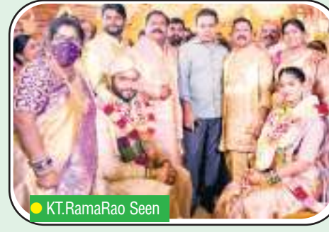
● KT.RamaRao Seen