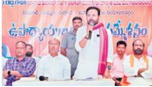
Telangana BJP president G Kishan Reddy addressing the MLC elections campaign meeting in Warangal on Sunday

He said that intellectuals, teachers and graduates are looking at the BJP and added that he is confident that the