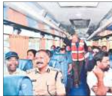
Greater Hyderabad Municipal Corporation Commissioner Ilambarthi inspecting various locations

As part of the inter-departmental convergence tour, officials from HMDA, Water Works, TSIIC, Police and the Electricity department accompanied the Commissioner to assess the proposed projects. Along with zonal commissioners, town planning officials, and project maintenance engineers, Commissioner Ilambarthi reviewed the sites for flyovers, road expansion and junction improvement projects proposed under the H-CITI initiative.