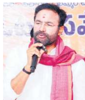
ly to go bankrupt. The Revanth Government is trying to make money by selling government lands, he added.

He said that Chief Minister Revanth Reddy criticised the KCR family which looted the state in the name of irrigation projects when he was in the opposition. However, the Revanth is now walking on KCR's path. The Congress Government is now borrowing heavily and is like-