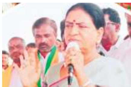
Lok Sabha member DK Aruna addressing a meeting in Udandapur in Jadcherla district on Sunday

How can there be threats when farmers demand compensation for the land they gave for the project? If compensation is provided based on party affiliations, where is the justice in that?