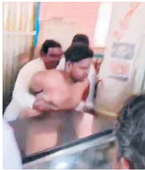
People at Mondri Sadak giving a sound thrashing to a youth who allegedly attempted to kidnap a girl from Gurukul School on Sunday in Kamareddy district