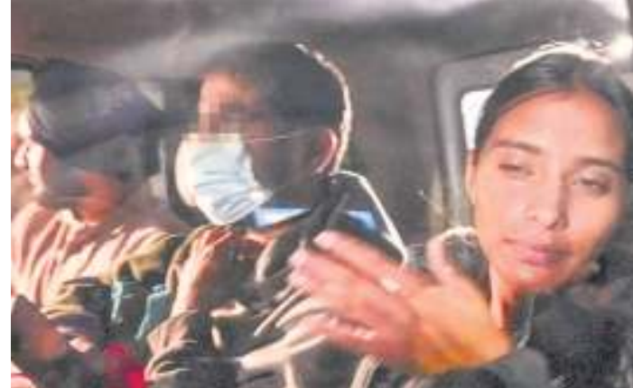
Himachal Pradesh and Jammu and Kashmir. They were provided food upon reaching Amritsar,

Of these 115 deportees, 65 are from Punjab, 33 from Haryana, eight from Gujarat, two each from Uttar Pradesh, Goa, Maharashtra and Rajasthan, and one each from