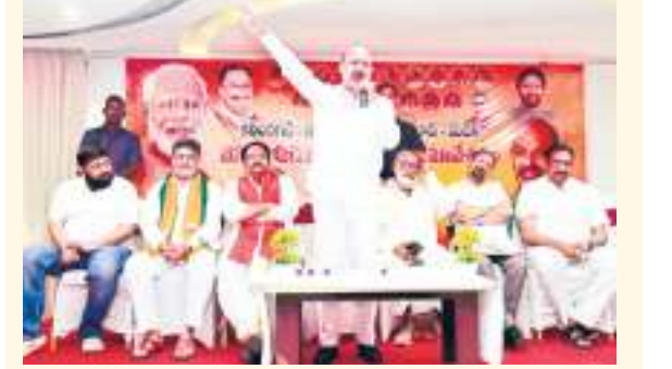
Union Minister of State for Home Affairs Bandi Sanjay Kumar addressing the BJP social media activists of Karimnagar-Nizamabad-Medak-Karimnagar MLC constituency on Sunday

KCR as a Telangana activist. However, Telangana became debt-ridden during KCR's rule, he added.