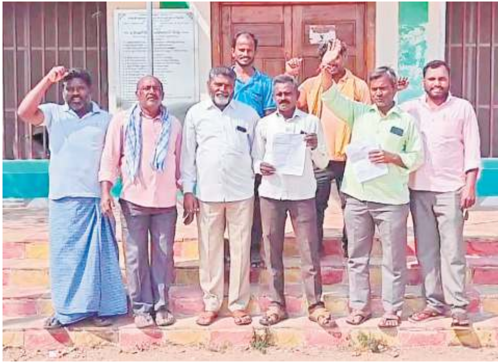
Farmers staging a protest at Gudur in Warangal district to highlight the 'exploitation' by transport contractors

Some farmers are unaware of the government's payment scheme, while others are unable