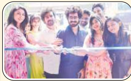
Anam Cara, a one-day designer exhibition, was officially inaugurated on Friday at Labels – The Popup Space, located on Road No. 1, Banjara Hills, Hyderabad. The event showcased an eclectic mix of fashion and creativity, drawing the presence of renowned models who added glamour to the occasion.