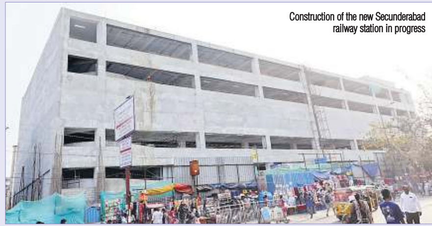
Construction of the new Secunderabad railway station in progress

The Rs 699 crore station upgrade awarded to Girdharilal Constructions Pvt Ltd. in 2022, aims to modernise infrastructure while increasing passenger convenience. The features include new multi-level parking, skywalks, travelators and an upgraded concourse, with a