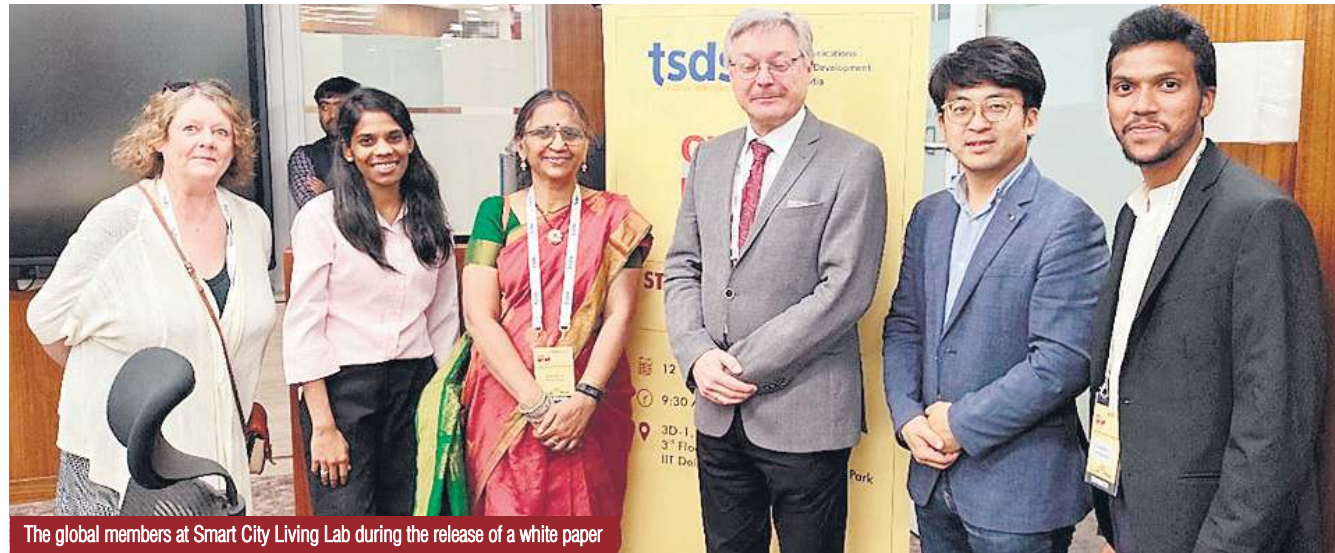
The global members at Smart City Living Lab during the release of a white paper

IIIT Hyderabad's Smart City Living Lab was featured as a model case study, showcasing deployments based on oneM2M standards and the Indian Urban Data Exchange (IUXX). The lab also presented live demos at the event, including: City IoT Operating Platform (ctOP) - A