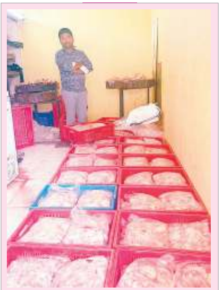
Hyderabad City Police seizing frozen and contaminated chicken waste