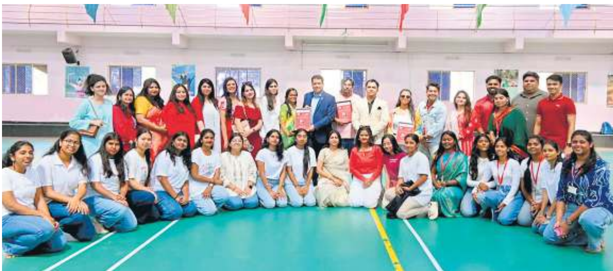
Students, activists and influencers participate in a special Menstrual Health Awareness programme in Hyderabad on Friday