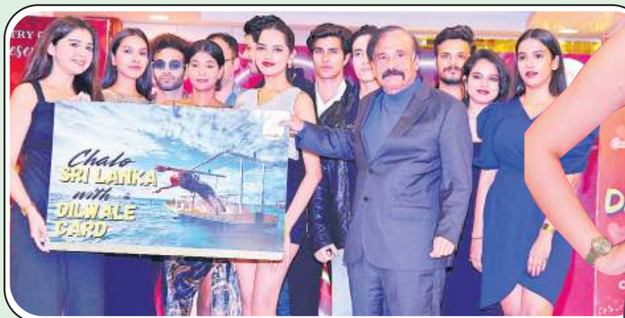
The Country Club Darling's Day 2025 celebration in Begumpet, Hyderabad, was a dazzling affair as teenage beauties, couples, and senior citizens graced the ramp, captivating the audience with their charm and elegance. With its vibrant energy and unforgettable performances, the celebration created a joyous and memorable experience for all attendees.