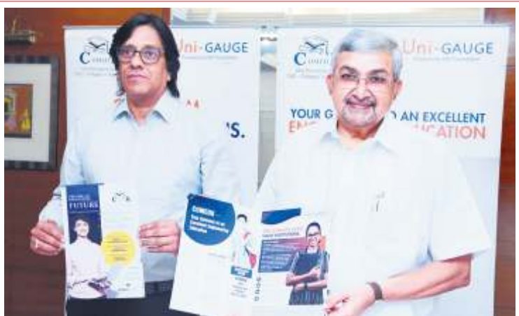
For the past five decades, Karnataka has established itself as a premier hub for higher education, attracting aspiring engineers from across the country. Highlighting Karnataka's contributions to the education sector, a special event was held at the Hyderabad Marriott Hotel, celebrating its impact on engineering and workforce development.

Humane Society International India has officially rebranded as Humane World for Animals, launching a global integrated campaign to reinforce its mission of creating lasting change for animals in India and worldwide. Effective immediately, this transition aligns with the organization's broader global impact, uniting all international entities under a single name and logo that reflects its commitment to protecting all animals.