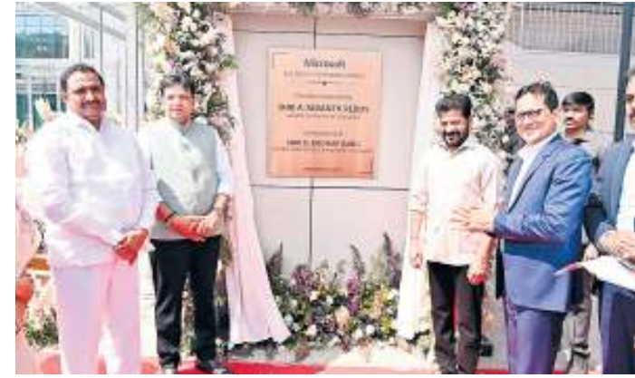
CM Revanth inaugurating Microsoft's new office at Gachibowli on Thursday

Prime Minister Narendra Modi met US National Security Advisor Michael Waltz here on Thursday. Modi arrived in the US capital Wednesday evening for a bilateral meeting with President Donald Trump. The meeting with Waltz was his first engagement of the day. External Affairs Minister S Jaishankar and NSA Ajit Doval were also present at the meeting. After arriving at Blair House, the President's Guest House, Modi met US Director of National Intelligence Tulsi Gabbard on Wednesday. "Congratulated her on her confirmation. Discussed various aspects of the India-USA friendship, of which she's always been a strong votary," Modi said on X.