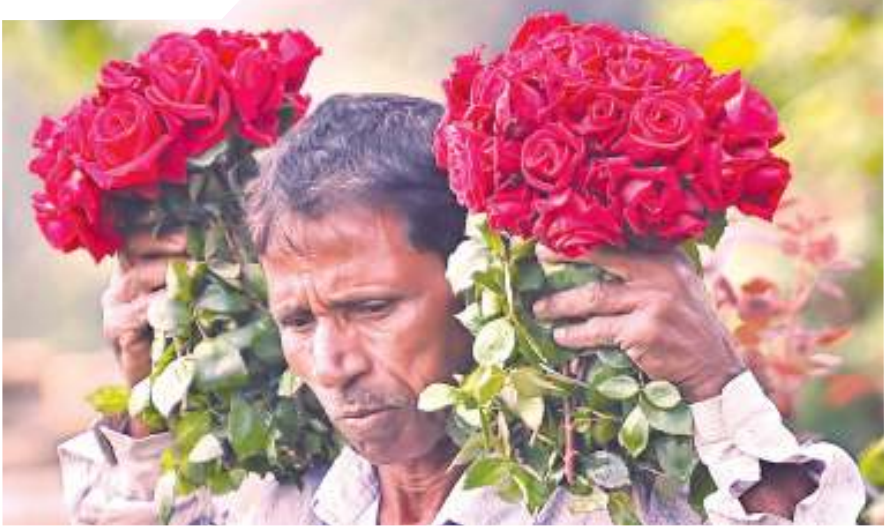
Farmer carries rose flowers during the Valentine's Week, in Agartala