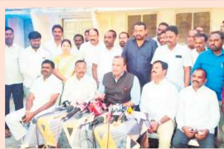
Roads and Buildings Minister Komatireddy Venkat Reddy speaking to the media in Nalgonda on Friday