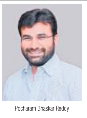
Pocharam Bhaskar Reddy

held significant positions such as minister and Speaker of the Legislative Assembly, gaining recognition and respect. He started his political journey with the Congress and later joined TDP and afterwards BRS.