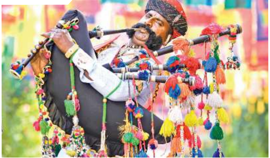
A folk artist at the 'Jaipur Literature Festival' (JLF), in Jaipur