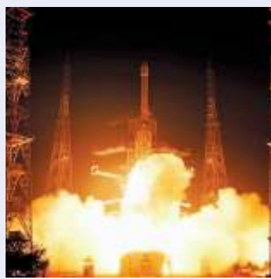
ISRO has added yet another feather to its cap with its 100th launch of GSLV, its most trusted workhorse rocket, from Sriharikota in 46 years and is planning to launch another hun-

dred of them in the next five years. GSLV is capable of launching satellites for both geosynchronous orbit (when it appears motionless from a point on the equator—primarily used for weather and communication and is placed at a very high altitude of about 42,000 km) and sun-synchronous orbit (when the satellite is passing over the same location at the same local time—used for imaging, weather forecasting, spying, and global observation at low altitudes of about 700 km, capable of capturing high-resolution images as a result). This launch has put India in a much better situation to be self-reliant in its technology, giving a boost to its economy, defence, and spatial dominance in the near future. The ISRO scientists need to be applauded for their time-bound achievements and speed through their hard work and dedication.