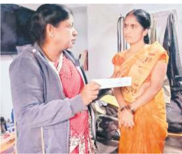
Field staff assisting women in Arkalguda village of Medchal for HPV Pilot Project study

According to Dr Kalpana Basani of the Medciti Institute of Medical Sciences, "A pilot study was conducted in Arkalguda village in Medchal district. Based on the database, 93 women were to be contacted. Of these, 2 women refused participation, 16 were ineligible due to prior hysterectomy, one had passed away, and 15 houses were vacant. HPV DNA self-collected swabs were taken from 58 women, with all test results returning negative. Most of the participants were between 36 to 45 years old. Additionally, 72 per cent of the women were housewives, but only 5.17 per cent had a previ-