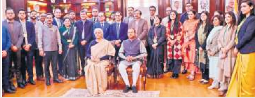
Finance Minister Nirmala Sitharaman with core team of officials on Friday

"I pray to Goddess Lakshmi that the poor and the middle-class sections in the country are blessed by her," Modi said on Friday while speaking to reporters outside Parliament before the start of the Budget session.