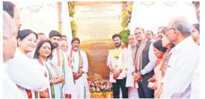
CM Revanth Reddy, Health Minister Damodar Raja Narasimha and Ministers at the foundation stone laying function of the New Osmania General Hospital at Goshamahal on Friday

"We have taken the 26-acre Goshamahal Police Ground and the new Osmania General Hospital