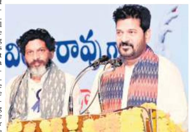
CM Revanth Reddy addressing the Gaddar's birth anniversary meeting at Ravindra Bharathi on Friday