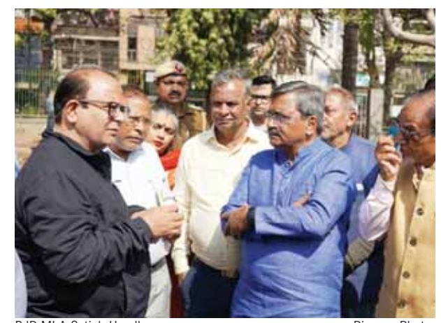
BJP MLA Satish Upadhyay.