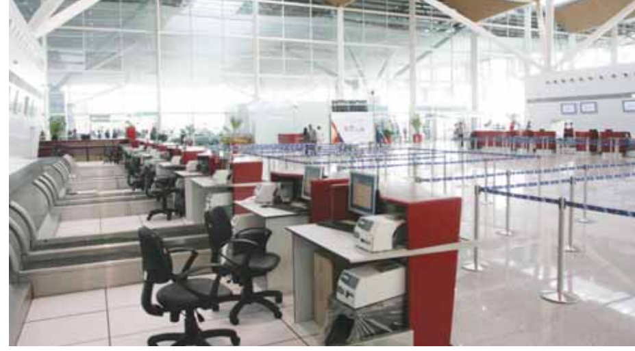
Delhi Airport.