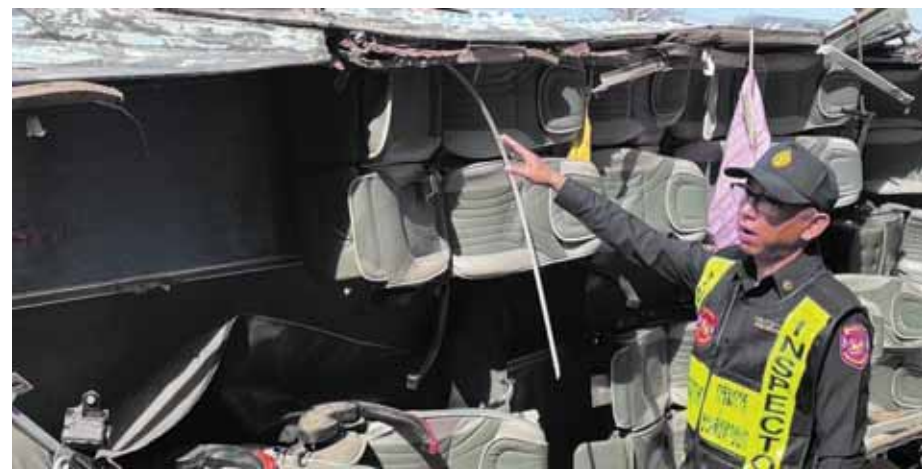
An investigator inspects the accident site where a bus travelling from northern Thailand overturned in eastern Prachinburi province, killing multiple people on Wednesday.