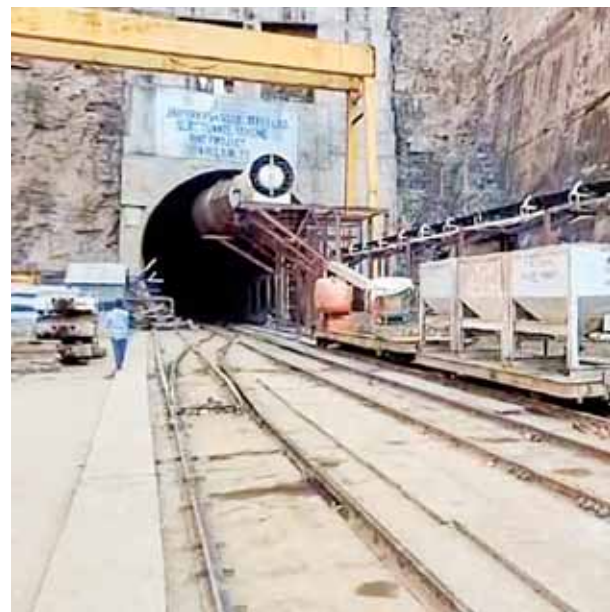
The project site where a portion of the tunnel collapsed in Nagarkurnool district on Wednesday