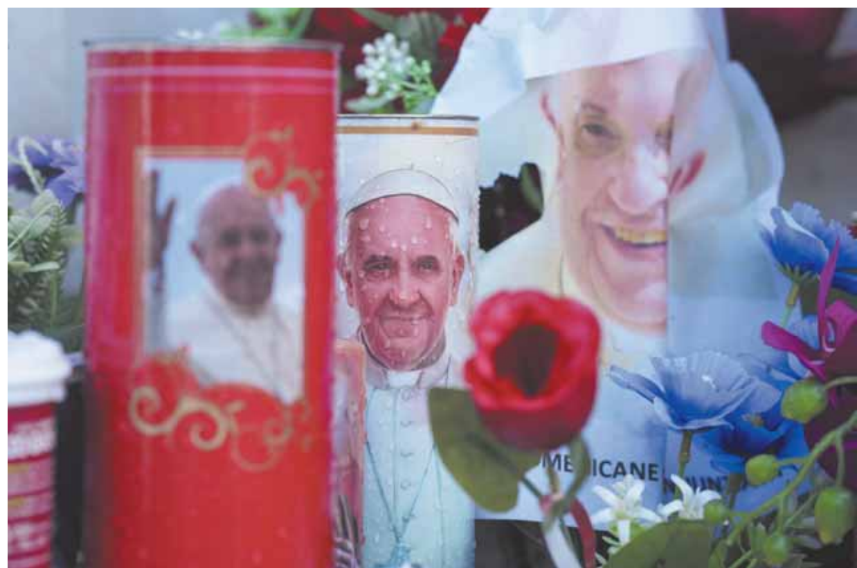
Candles and flowers for Pope Francis are seen at the Agostino Gemelli Polyclinic, in Rome, Wednesday, where the Pontiff is hospitalised since Friday.

Pope Francis was sitting upright and receiving therapy for double pneumonia Wednesday, the Vatican said, as Argentines and Romans alike gathered in the Eternal City to pray for his recovery. Francis remained in critical condition. The Vatican said that it hoped to have information later in the day about the results of a CT scan taken Tuesday evening to check on the status of the complex lung infection that has kept him hospitalised since Feb. 14.