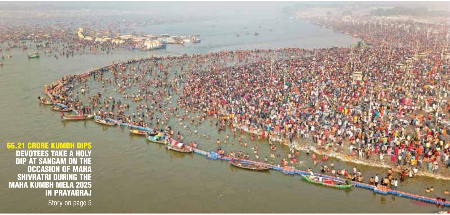
66.21 CRORE KUMBH DIPS DEVOTEES TAKE A HOLY DIP AT SANGAM ON THE OCCASION OF MAHA SHIVRATRI DURING THE MAHA KUMBH MELA 2025 IN PRAYAGRAJ Story on page 5