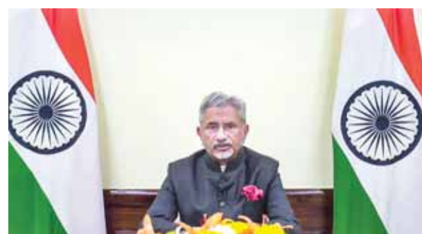
External Affairs Minister S Jaishankar addresses the Japan-India-Africa business forum on Wednesday

"India's approach to Africa has always been guided by a deep-rooted commitment to building long-term, mutually-beneficial partnerships," he said. "Unlike extractive models of engagement, India believes in capacity-building, skill development and technology transfer, ensuring that African countries not only benefit from investments but also develop self-sustaining growth ecosystems," he added. India is Africa's fourth-largest trading partner, with bilateral trade reaching nearly USD 100 Billion and growing steadily, Jaishankar noted. India has also made significant