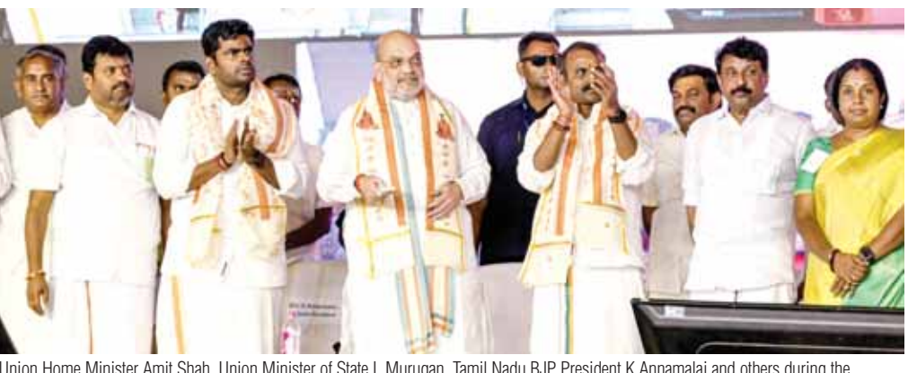
Union Home Minister Amit Shah, Union Minister of State L. Murugan, Tamil Nadu BJP President K Annamalai and others during the inauguration of a BJP office, in Coimbatore, Tamil Nadu

The plea in the top court filed by advocate Ashwini Kumar Upadhyay seeks a life ban on convicted politicians. In its affidavit, the Centre underlined the apex court had consistently held that the legislative choice over one option or the other couldn't be questioned in courts over its efficacy or otherwise. Under Section 8 (1) of the Representation of the People Act, 1951, the period of disqualification was six years from the date of conviction or in case of imprisonment, six years from the date of release, it added. Continued on page 2