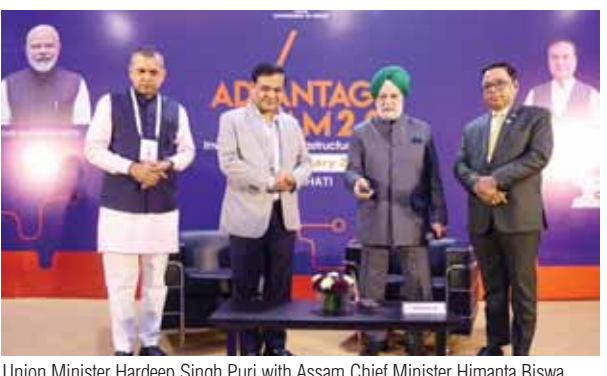
Union Minister Hardeep Singh Puri with Assam Chief Minister Himanta Biswa Sarma during Advantage Assam 2.0 Investment and Infrastructure Summit 2025 in Guwahati

PTI ■ GUWAHATI India is looking at increasing its target to blend ethanol with petrol to more than 20 per cent and has formed a committee under the NITI Aayog for this, Petroleum Minister Hardeep S Puri said on Wednesday. Addressing the Advantage Assam 2.0 business summit in Guwahati, he said 19.6 per cent blending has already been achieved. "We will be looking at more than 20 per cent blending of biofuel. Already a NITI Aayog group has been set up and they are looking into it," he said. "We had set a target of 20 per cent blending by 2026, but already achieved 19.6 per cent. I am sure we will touch