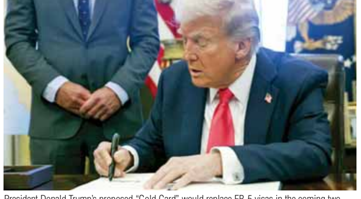
President Donald Trump's proposed "Gold Card" would replace EB-5 visas in the coming two weeks, the commerce secretary said

PTI ■ WASHINGTON President Donald Trump said that he plans to offer a "gold card" visa with a path to citizenship for $5 million, replacing a 35-year-old visa for investors. "They'll be wealthy and they'll be successful, and they'll be spending a lot of money and paying a lot of taxes and employing a lot of people, and we think it's going to be extremely successful," Trump said in the Oval Office. Commerce Secretary Howard Lutnick said the "Trump Gold Card" would replace EB-5 visas in two weeks. EB-5s were created by Congress in 1990 to generate foreign investment and are available to people who spend about $1 million on a company that employs at least 10 people. Lutnick said the gold card — actually a green card, or permanent legal residency — would raise the price of admission for investors and do away with fraud and "nonsense" that he said characterise the EB-5 program. Like other green cards, it would include a path to citizenship. About 8,000 people obtained investor visas in the 12-month period ending September 30, 2022, according to the Homeland Security Department's most recent Yearbook of Immigration Statistics. The Congressional Research Service reported in 2021 that EB-5 visas pose risks of fraud, including verification that funds were obtained legally. Investors' visas are common around the world. Henley and Partners, an advisory firm, says more than 100 countries around the world offer "golden visas" to wealthy individuals. Continued on page 2