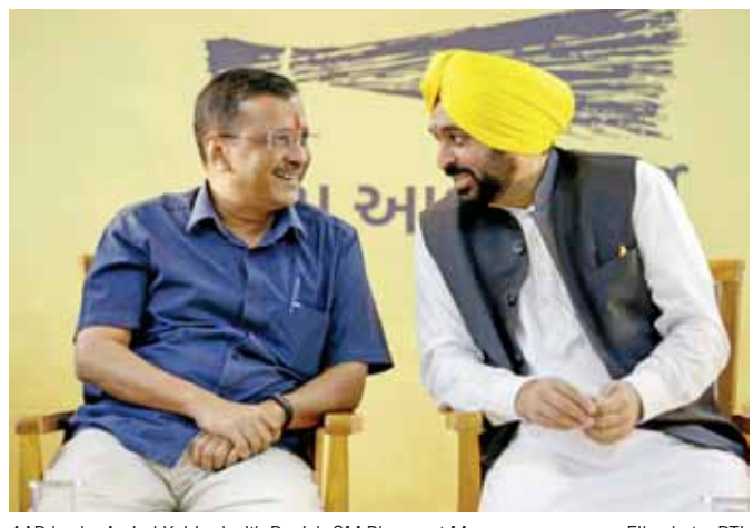
AAP leader Arvind Kejriwal with Punjab CM Bhagwant Mann