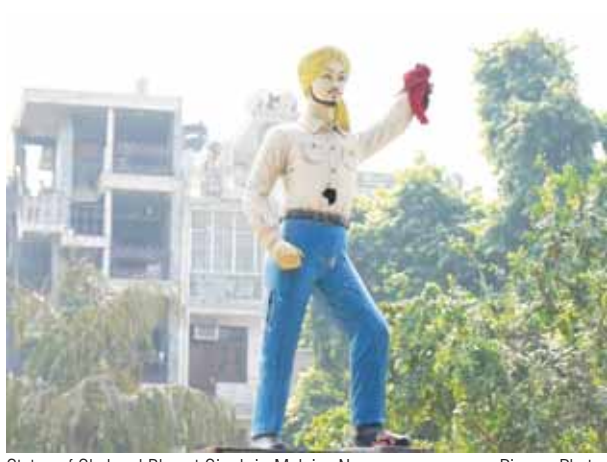
Statue of Shaheed Bhagat Singh in Malviya Nagar.