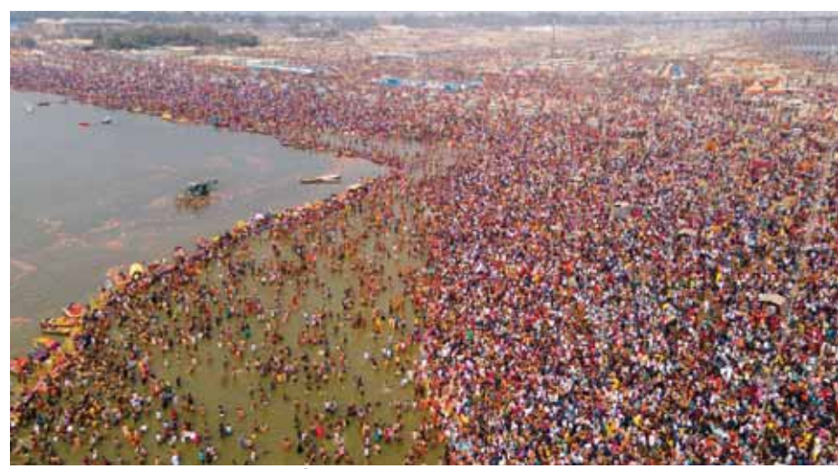
An aerial view of devotees taking holy dip at Sangam on the occasion of 'Mahashivratri' during the ongoing 'Maha Kumbh Mela' in Prayagraj in Uttar Pradesh on Wednesday