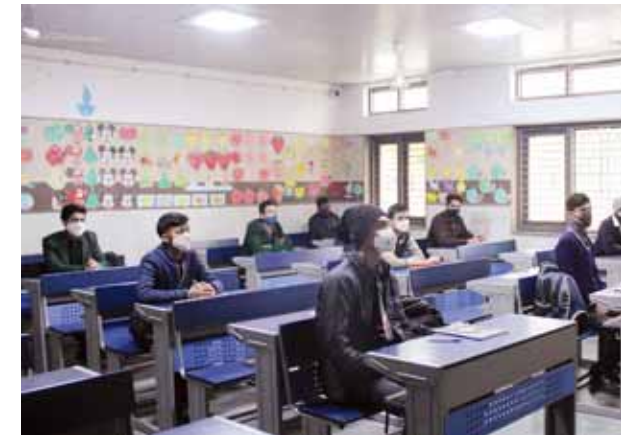
Representative photograph of a classroom