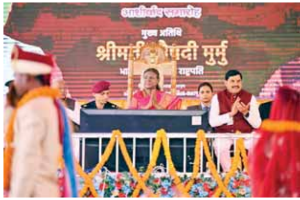
President Droupadi Murmu with Madhya Pradesh CM Mohan Yadav during a mass marriage ceremony in Chhatrapur, Madhya Pradesh

President Droupadi Murmu on Wednesday said saints in India have ensured a respectable place for women in the society and the country is now moving "from women-development to women-led development". "The contemporary spiritual leaders could play an important role in building a self-reliant, harmonious and environment-friendly India," Murmu said addressing a mass wedding function at Bageshwar Dham in Garha village, at Madhya Pradesh's Chhatrapur district, where 251 couples got married. "The saint community has played a major role in removing social evils from the society by raising voice against them, and ensured a respectable place for women in the society. Today, as our country moves from women-development to women-led development, we must all contribute to making our daughters and sis-