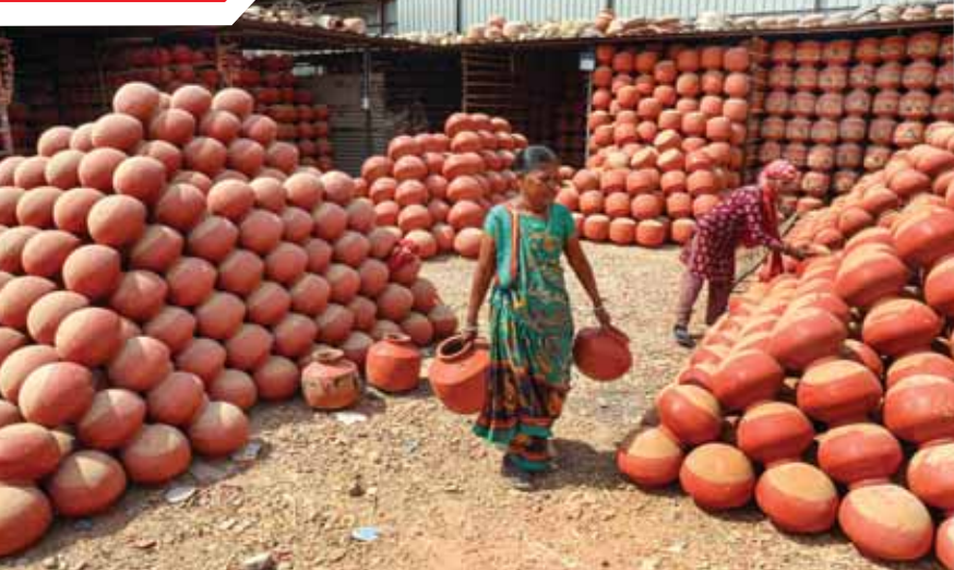
Vendors display earthen pots for sale, on the outskirts of Ahmedabad